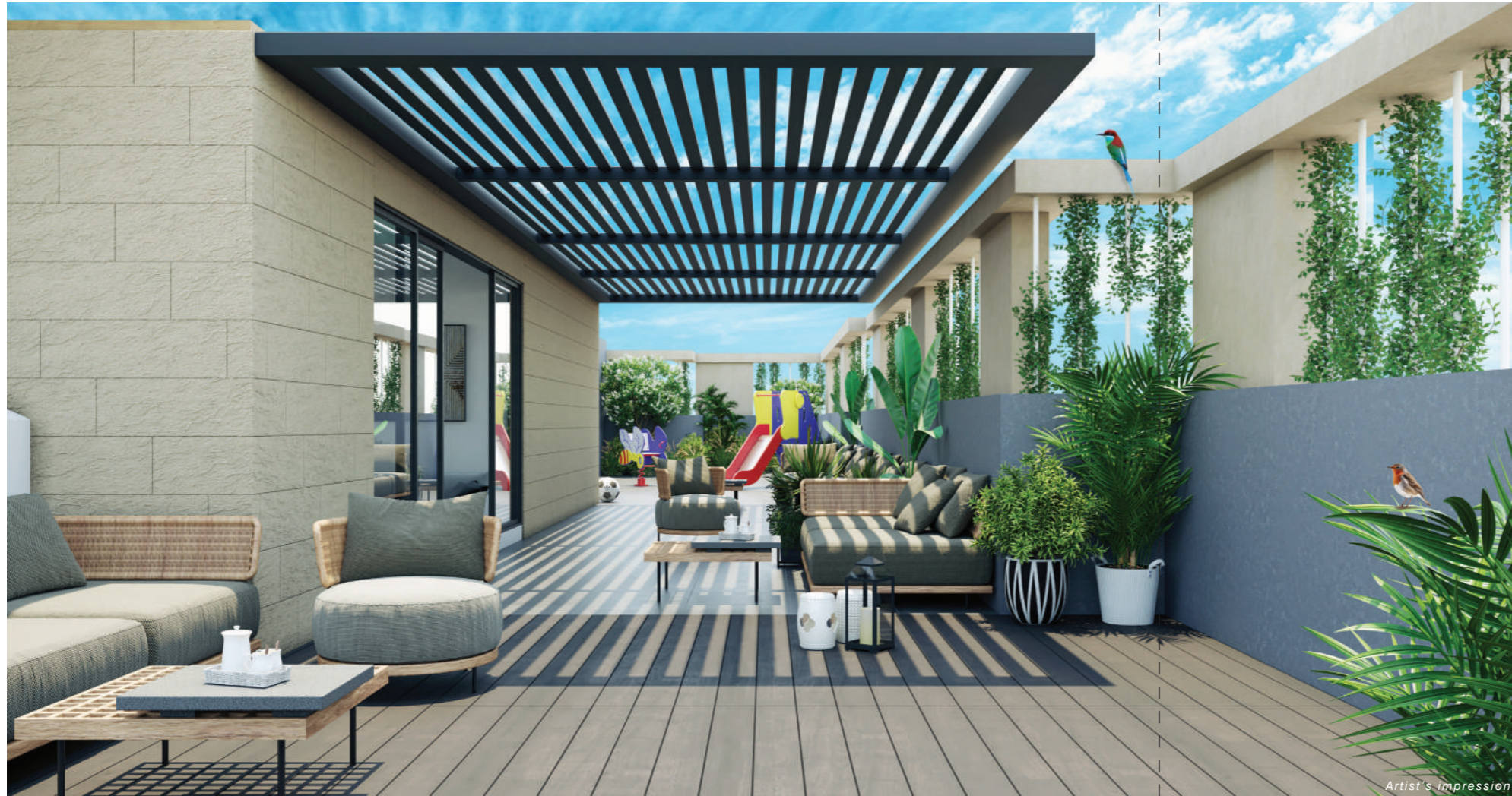
Terrace with lots of amenities

What could be more soothing in this crowded city than having a cup of coffee in the morning in the company of beautiful birds and their melodious songs.