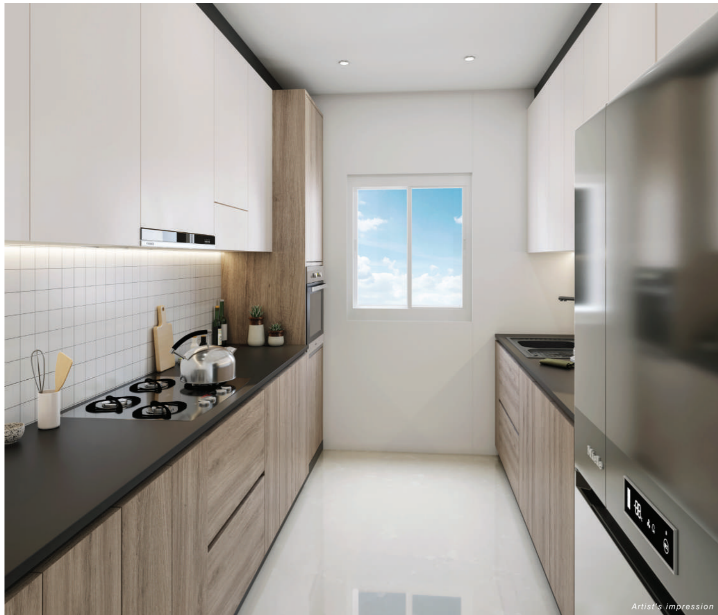
Well planned kitchen