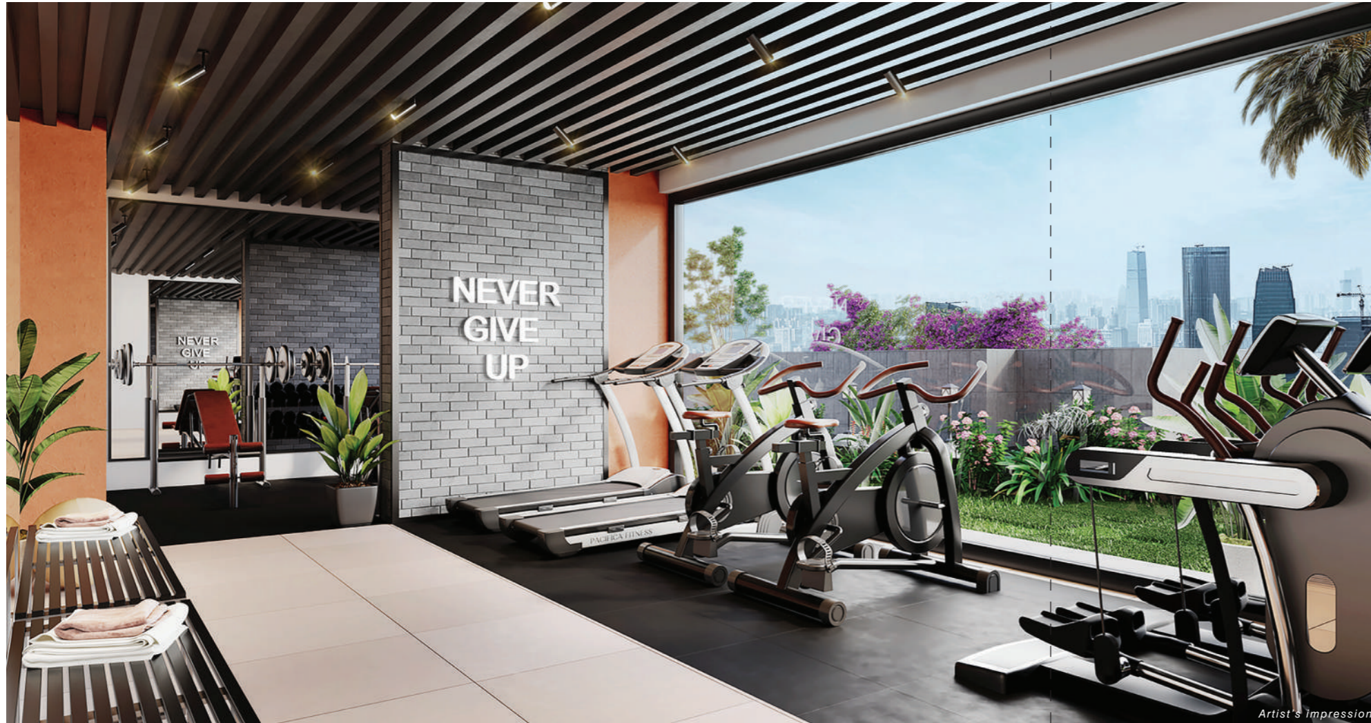
Well equipped gym