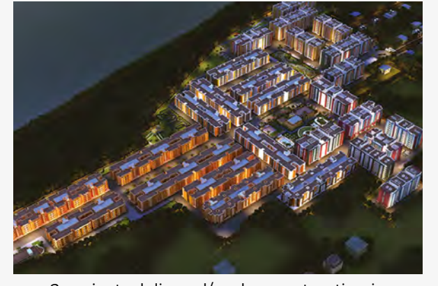
2 projects delivered/under construction in Chennai. On an aggressive spree with 5 new projects in the pipleline.