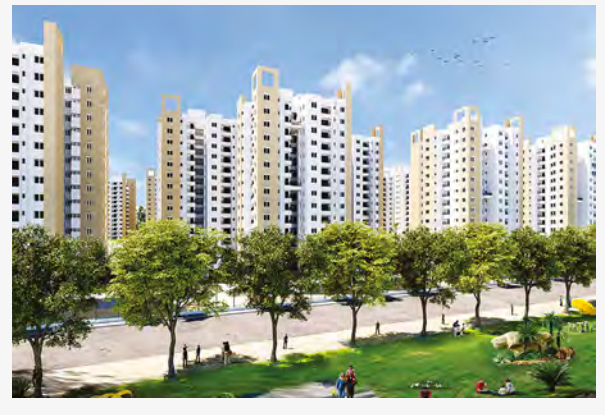
A 314 acre mega city under development in Kolkata.