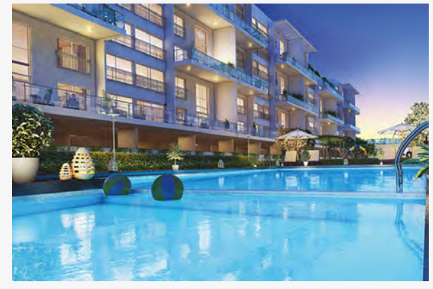
16 completed projects and 10 ongoing projects in Bangalore.