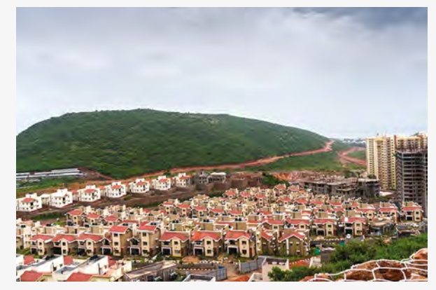
Vizag's most premium address. Phase 1 - delivered.