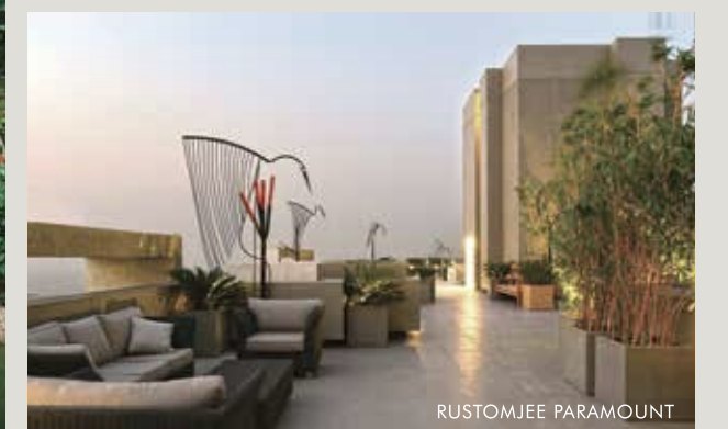
ALL IMAGES ARE SHOT AT LOCATION