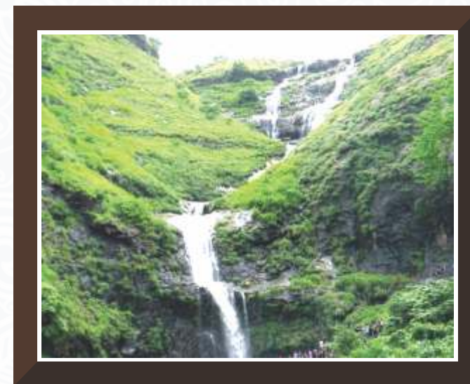
Ashane Water Fall