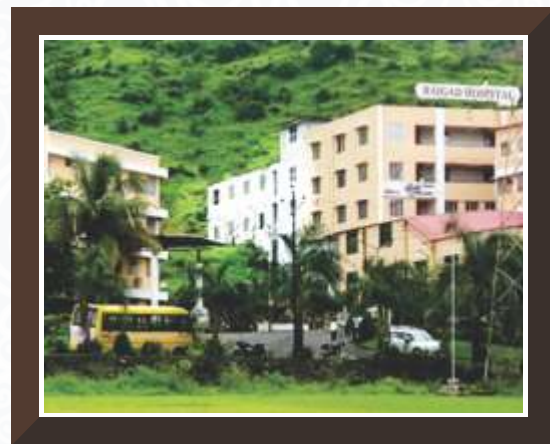
Raigad Hospital & Research Centre 0.5 kms