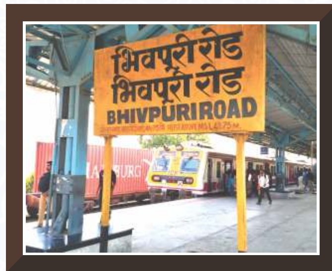
Bhivpuri Road Railway Station 0.0 km