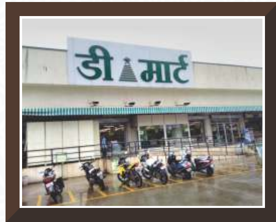
D-Mart from Project 4.3 kms