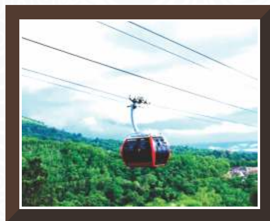
Proposed Matheran Ropeway