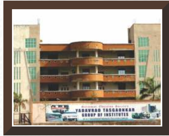
Education Hub 1.9 kms