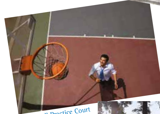
Basketball Practice Court