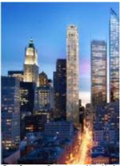
Four Seasons Downtown, New York