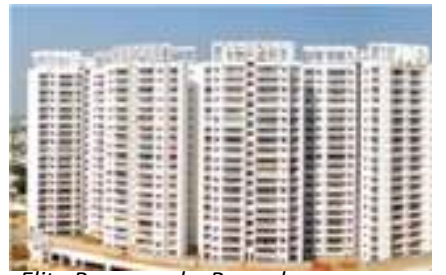
Elita Promenade, Bangalore