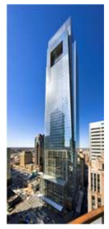
Comcast Center, Pennsylvania