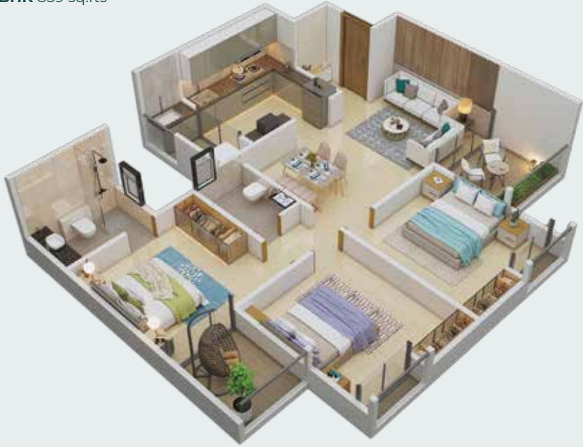
2.5BHK 859 sq.fts