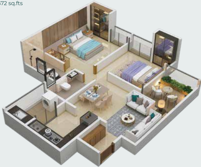
2BHK 672 sq.fts