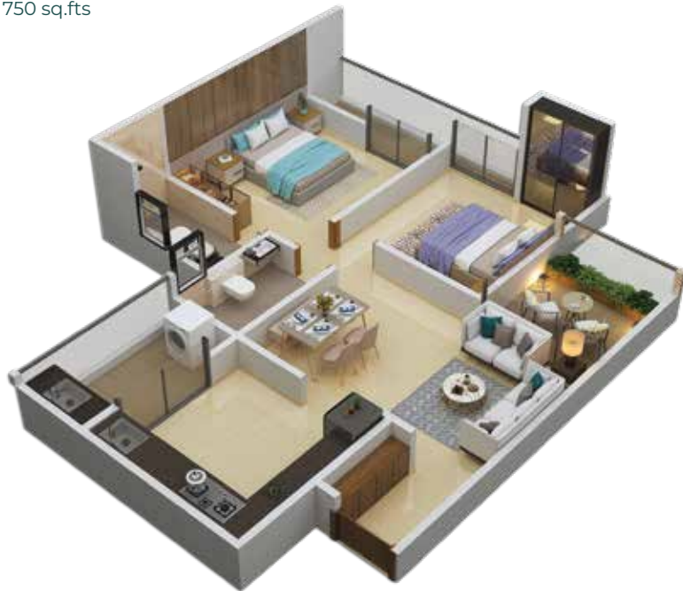
2BHK 750 sq.fts