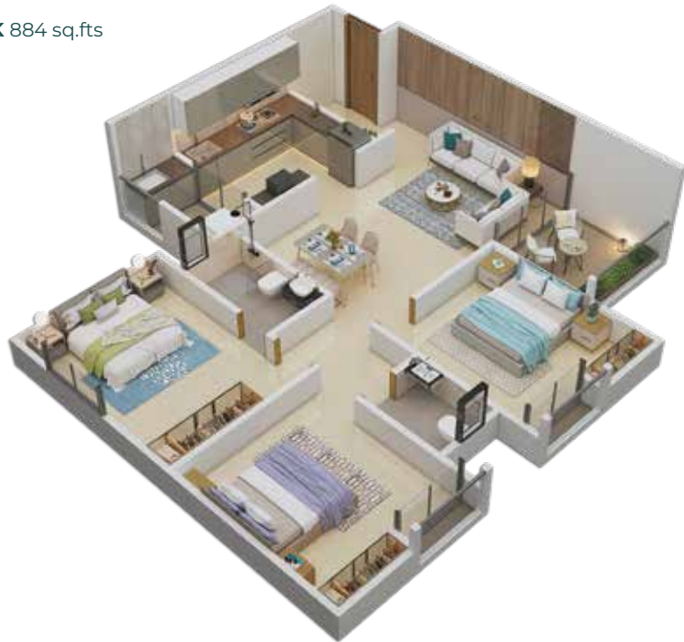
2.5BHK 884 sq.fts