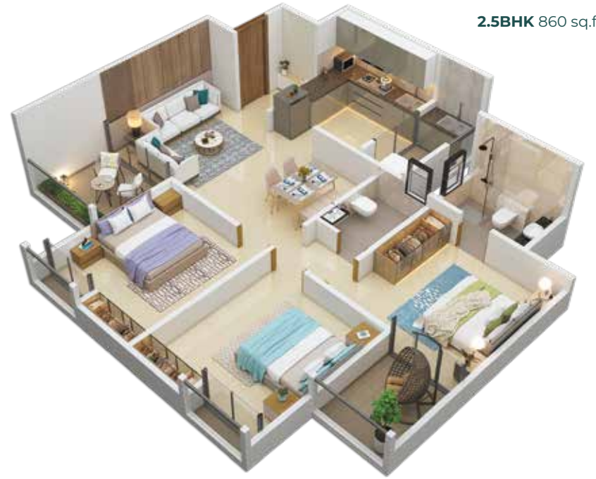
2.5BHK 860 sq.fts