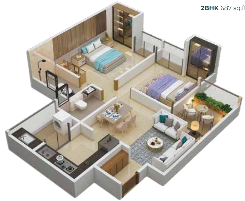
2BHK 687 sq.fts