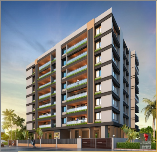
THE SHWET PALLOD FARMS