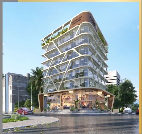
ALPHA-C PAN CARD CLUB ROAD