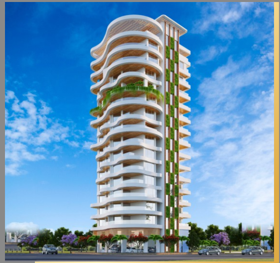
SUNMAN MODEL COLONY