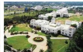
CANADIAN INTERNATIONAL SCHOOL