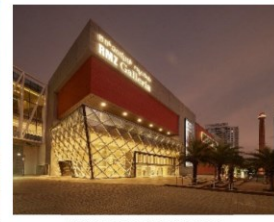
RMZ GALLERIA MALL