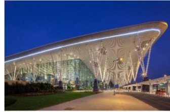
BANGALORE INTERNATIONAL AIRPORT