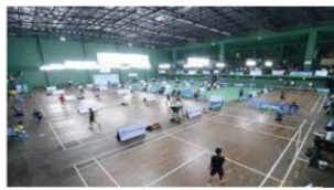
PRAKASH PADUKONE BADMINTON ACADEMY