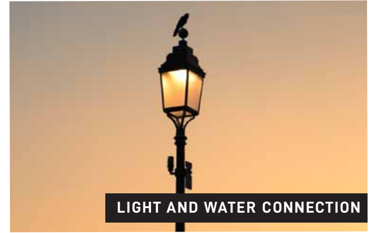
LIGHT AND WATER CONNECTION