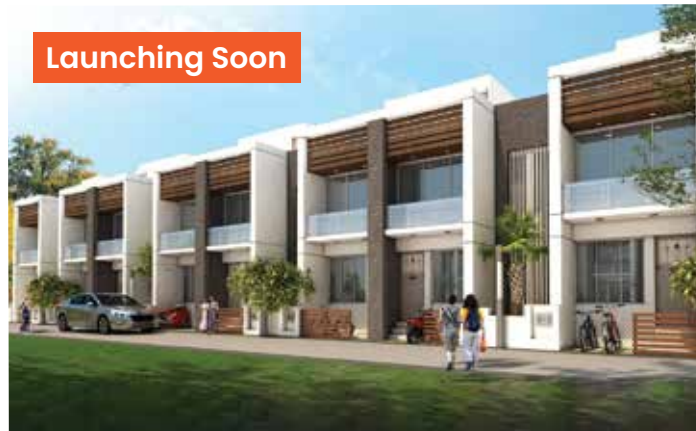
Nivaan Legacy (Wagholi, Bakori)