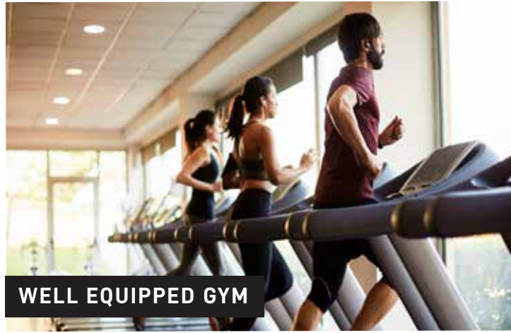
WELL EQUIPPED GYM