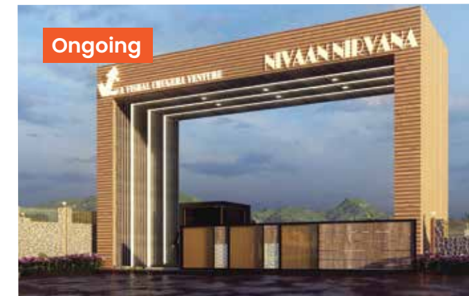
Nivaan Nirvana (Saswad, Pune)