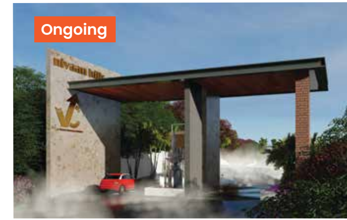
Nivaan Hills (Mahabaleshwar)