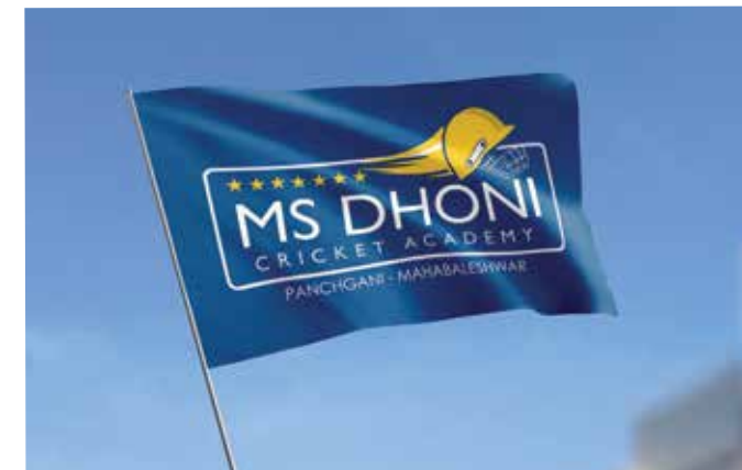
M S Dhoni Cricket Academy (Mahabaleshwar)