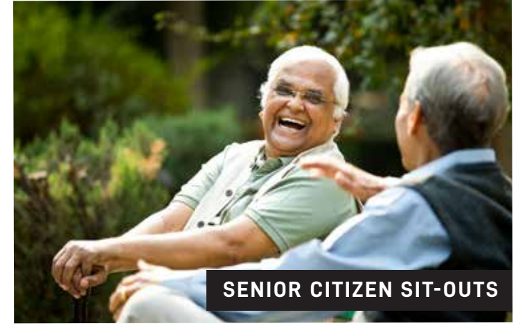
SENIOR CITIZEN SIT-OUTS