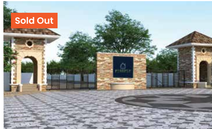
Nivaan Suraksha Enclave (Wagholi, Bakori)