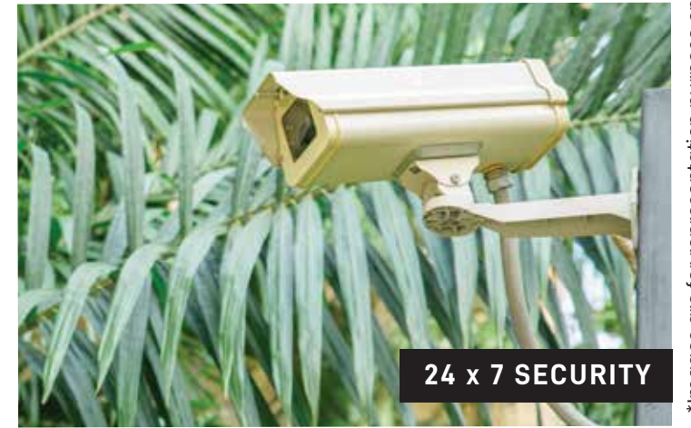
24 x 7 SECURITY