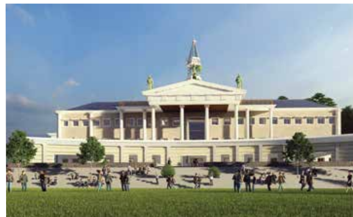
Doon International School (Mahabaleshwar)