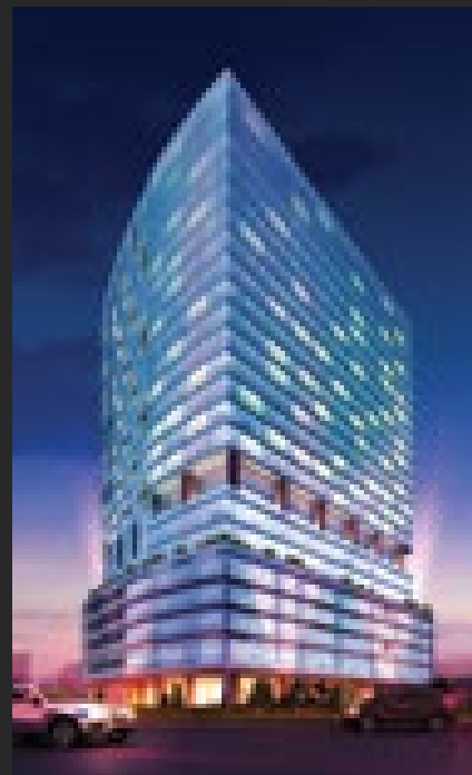
Artistic Rendition of Two Horizon Center