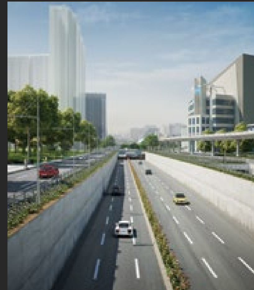
Artistic rendition of Ch. Raghvendra Singh Marg