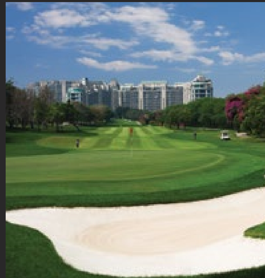
DLF Golf & Country Club