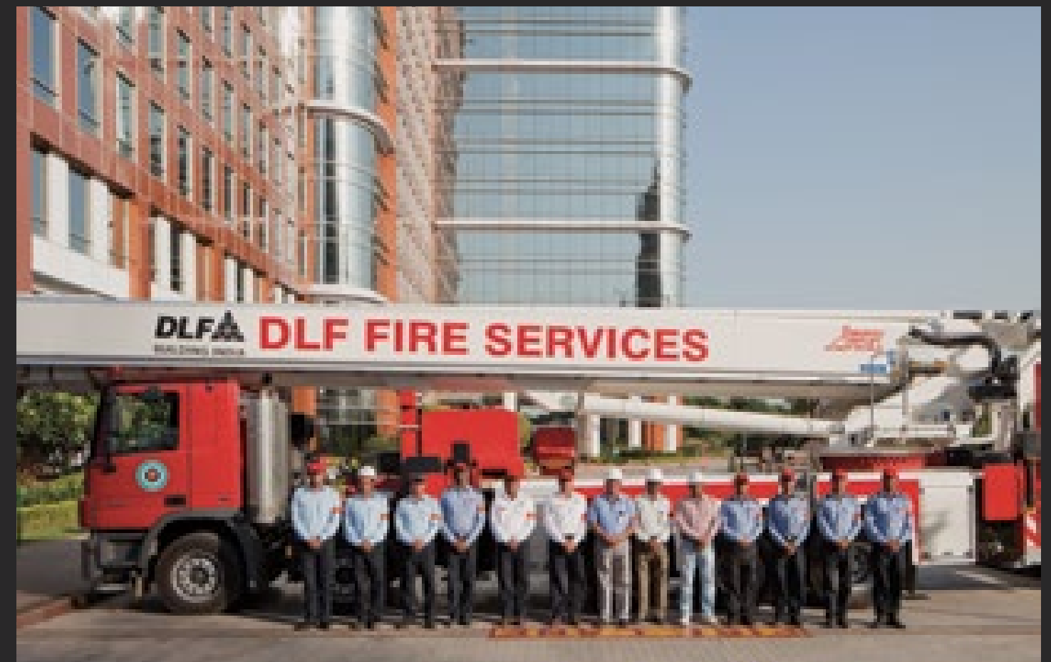
DLF Fire Services