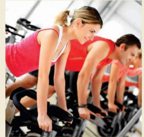
Well Equipped Gymnasium