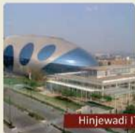
Hinjewadi IT Park