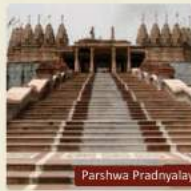
Parshwa Pradnyalay (Jain Temple)