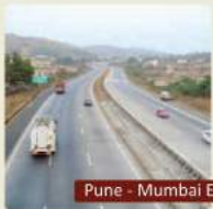
Pune - Mumbai Expressway