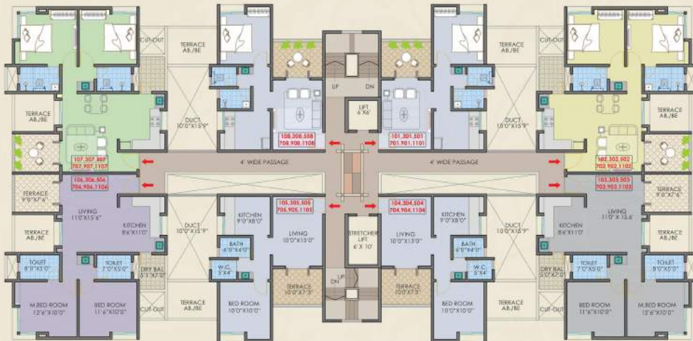
Area Statement in Sq. Ft.