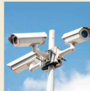
CCTV Surveillance with Security