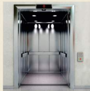
Power Back-up for Lifts & Common Area