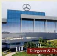
Talegaon & Chakan MIDC