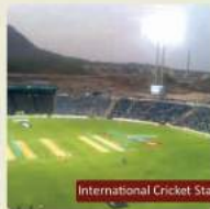
International Cricket Stadium at Gahunje