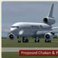
Proposed Chakan & Panvel Airport