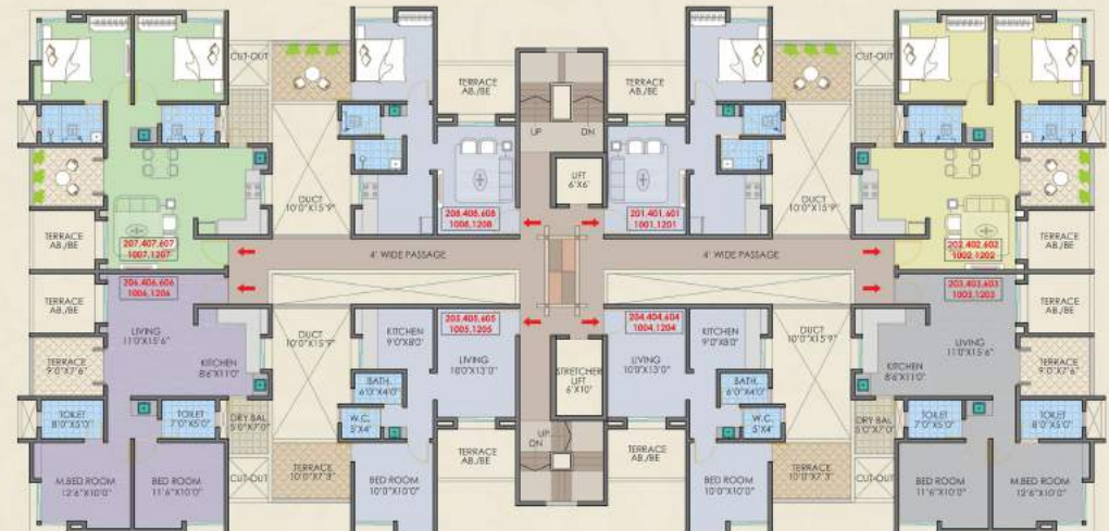
Area Statement in Sq. Ft.