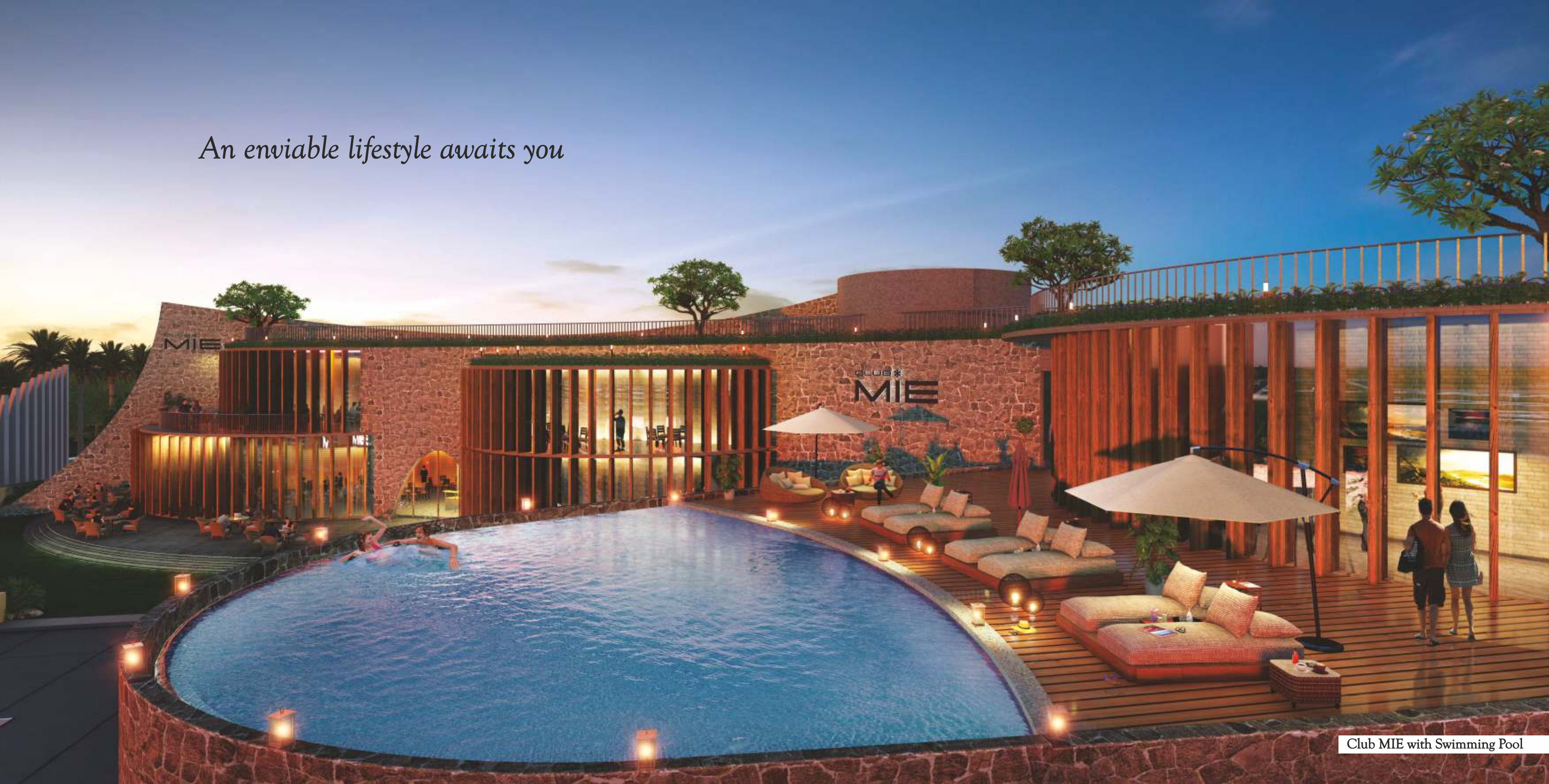
Club MIE with Swimming Pool