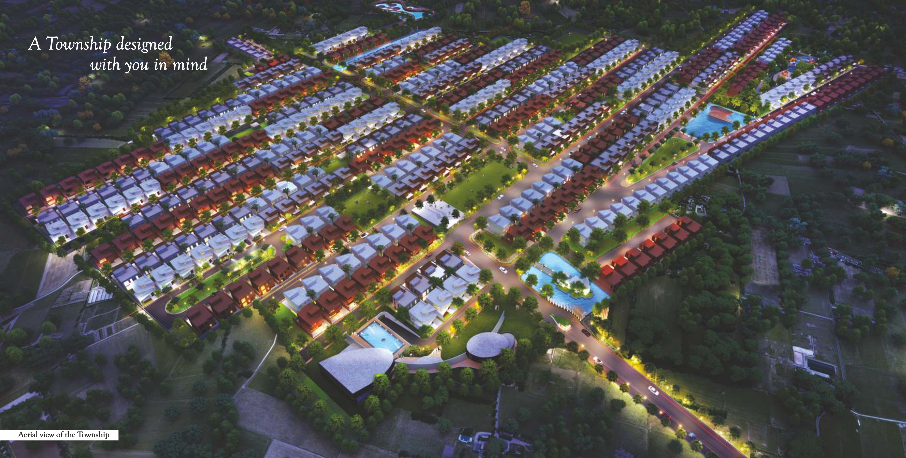
Aerial view of the Township