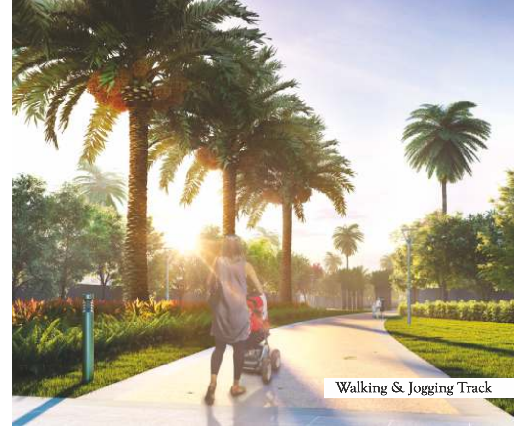
Walking & Jogging Track