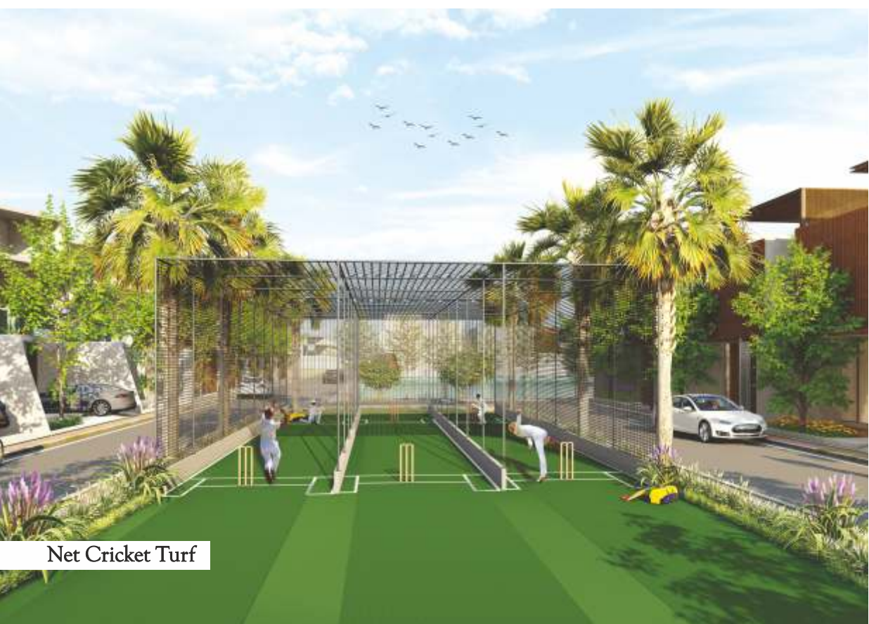
Net Cricket Turf