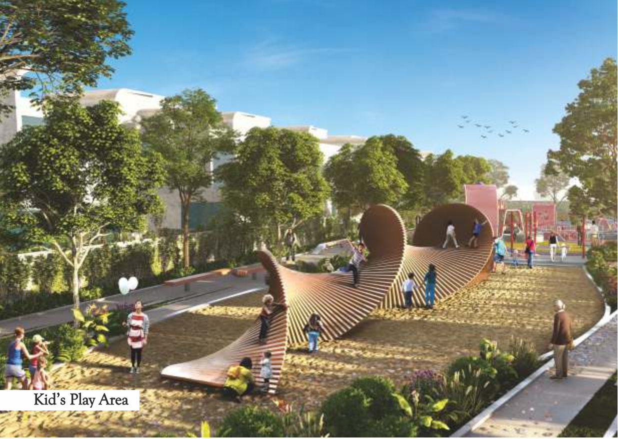
Kid's Play Area