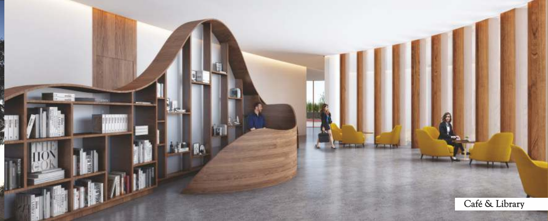
Café & Library