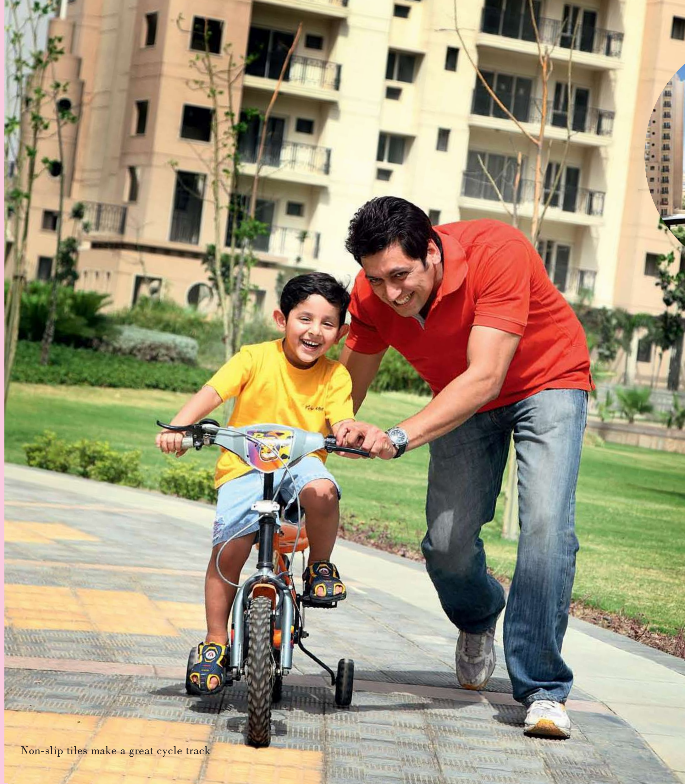
Non-slip tiles make a great cycle track

Top class construction quality is a hallmark of all ATS projects. The best materials and workmanship deliver quality you can literally touch with your fingers. And when you combine that with a well-designed interior, the result is a home to be proud of. ✨