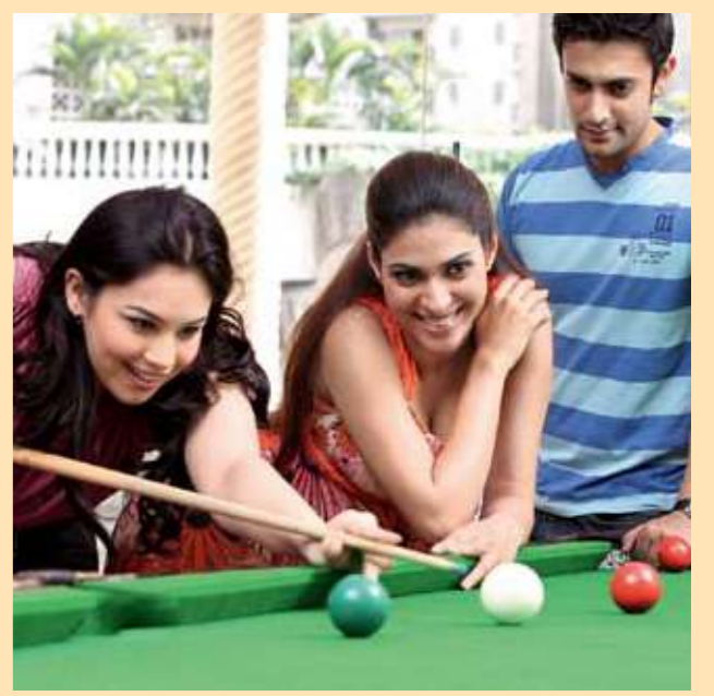
ATS Village has a full-size snooker table