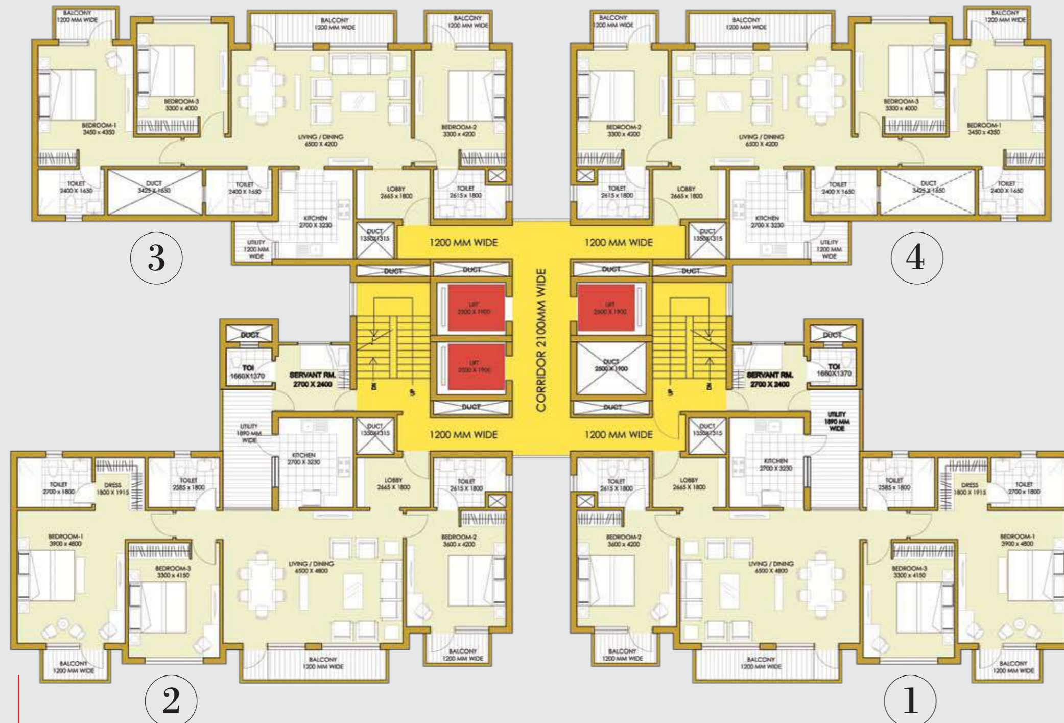
Floor Plan - Type C Area: 1636 sq.ft.

Notes : Saleable area is tentative and is subject to change due to changes asked by approving authorities till occupancy certificate is obtained. Architect reserves the right to add / delete any detail / specification / elevation mentioned if so warranted by circumstances.