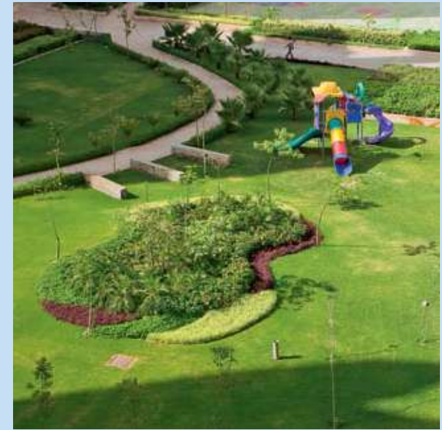
Acres of greenery at ATS Greens Paradiso