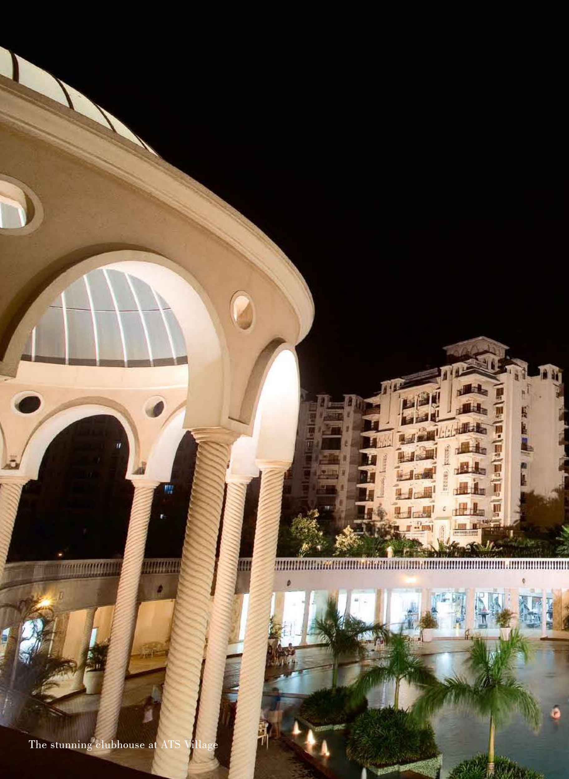
The stunning clubhouse at ATS Village