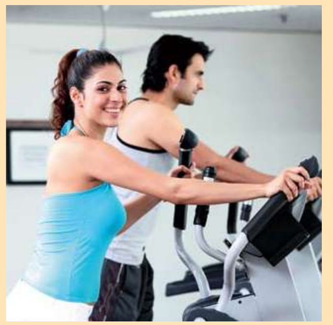
A state-of-the-art workout at ATS Village