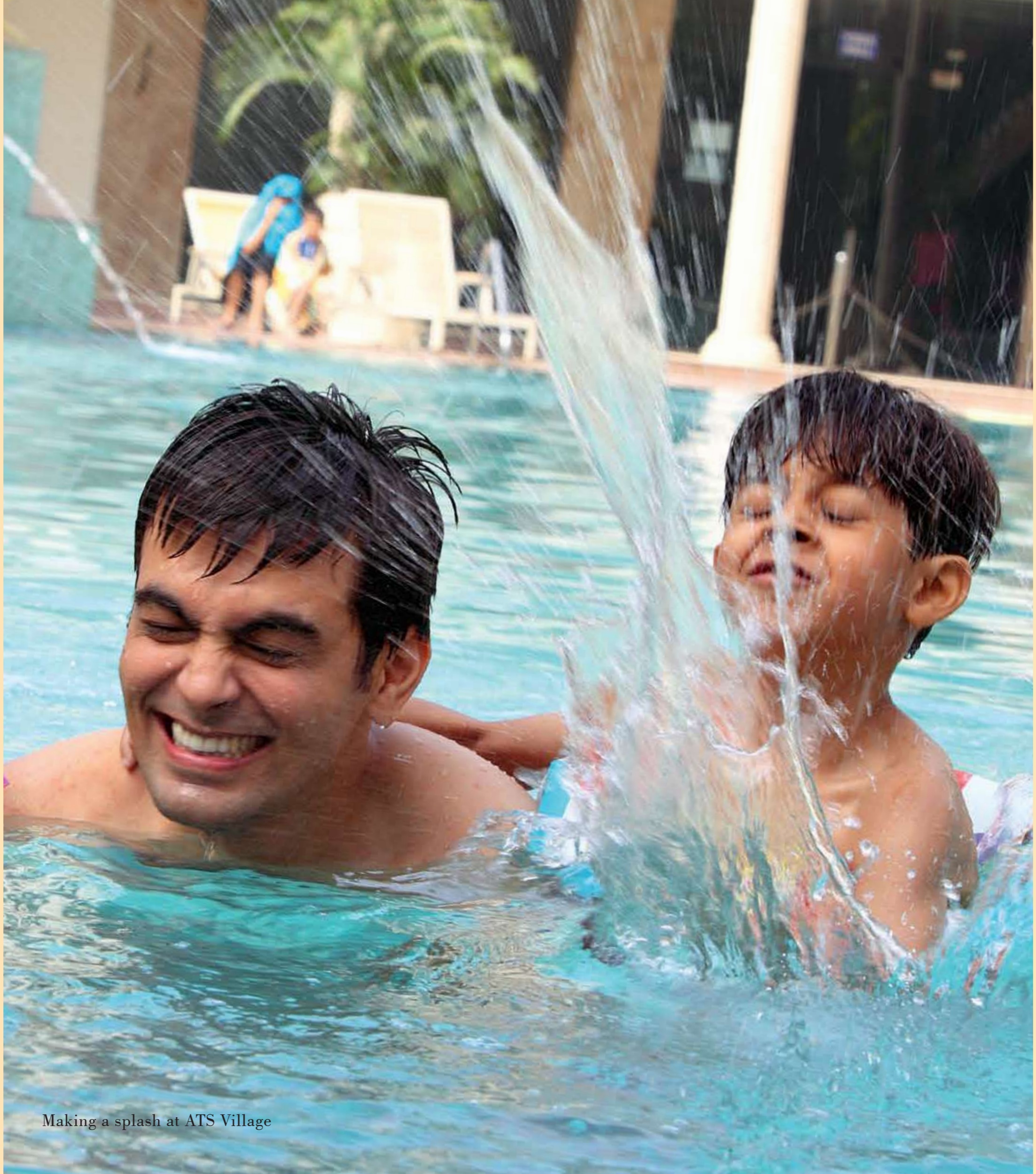
Making a splash at ATS Village

Large and luxuriously fitted clubhouses are probably the best-known feature of ATS developments. Tennis, squash and basketball courts, shopping arcades, gymnasiums, spas, high tech security and ample parking are just some of the other amenities ATS offers its residents. ♦