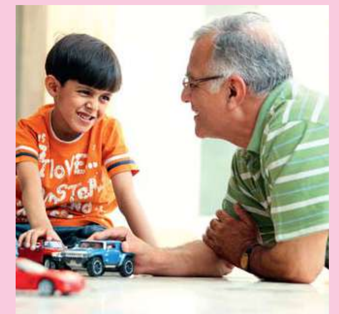
Auto Show at ATS Greens II