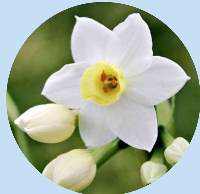
Nature in full bloom at ATS Village