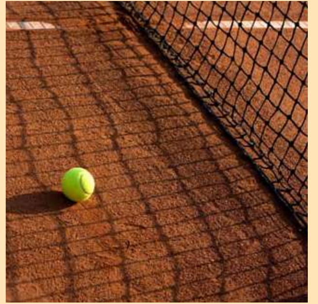
ATS Greens Paradiso: Game, set and match