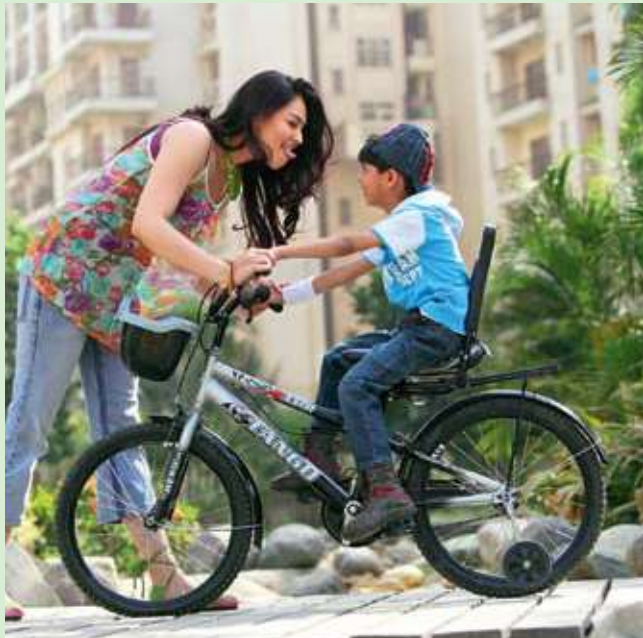
Traffic jam at ATS Village