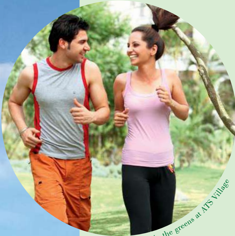
Jogging in the greens at ATS Village