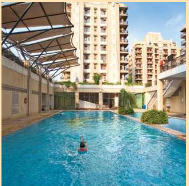
A refreshing swim at ATS Greens II