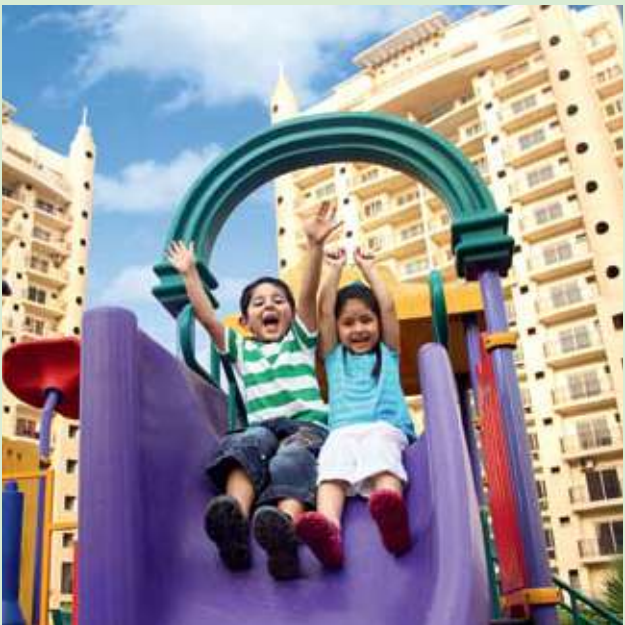
A children's play area at ATS Greens Paradiso

At ATS, the layout of the site receives a lot of attention. Maximisation and even distribution of the green areas, the way the towers are arranged, the provision of large community areas like the clubhouse and the swimming pool – all these are vital ingredients of the joy of living at an ATS development. ❖