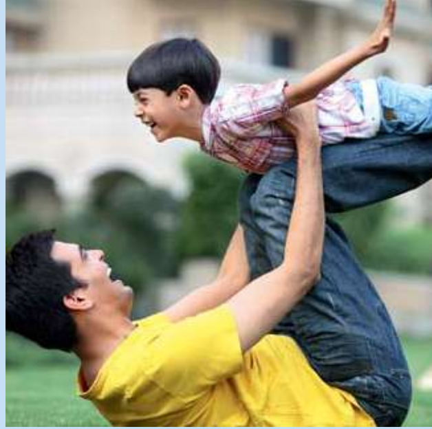
Energy flows at ATS Village

A feeling of largeness and green open spaces is a distinctive element of ATS properties. There are beautifully maintained parks, flower-bordered walkways, and patches of green tucked away in unexpected places between towers. Stepping out onto dew-covered grass in an aesthetic and invigorating environment becomes a daily pleasure for ATS residents. ❖