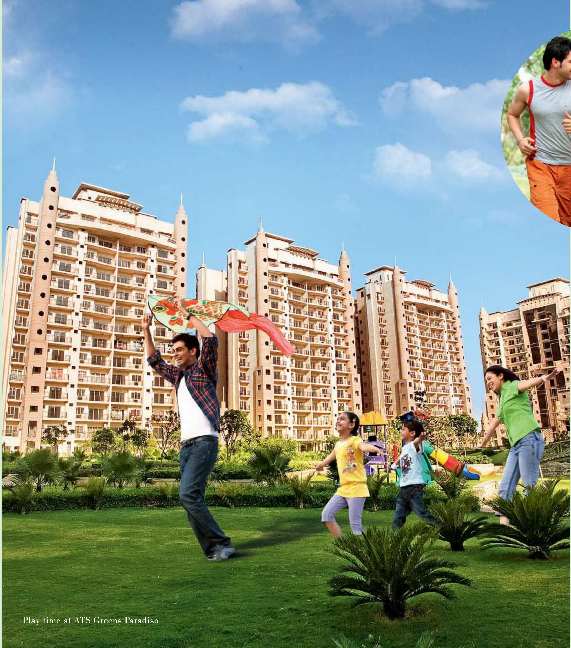
Play time at ATS Greens Paradiso