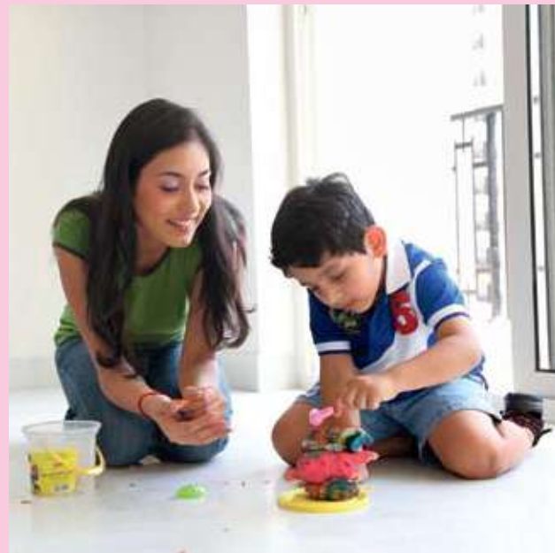
A typical floor at ATS Greens II