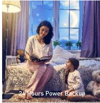
24 Hours Power Backup