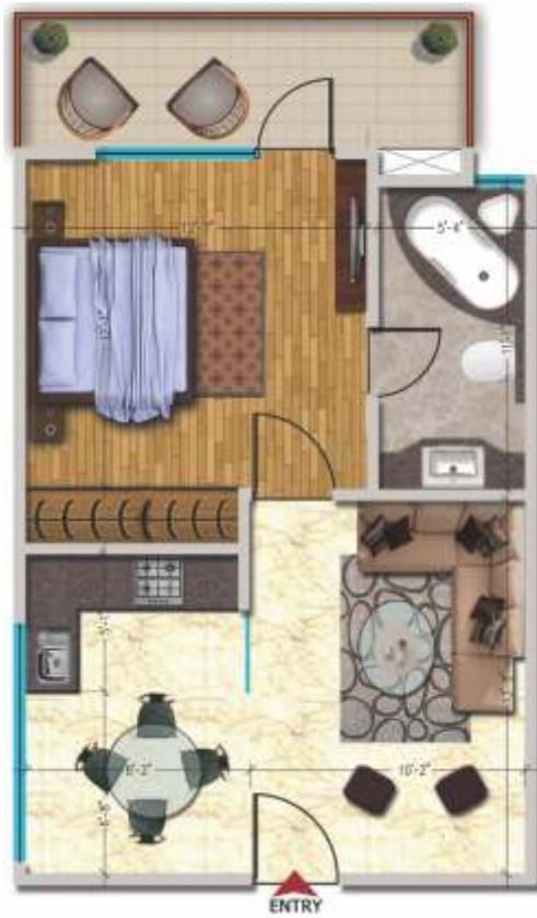
APT #01 SUPER AREA 816 SQ. FT.