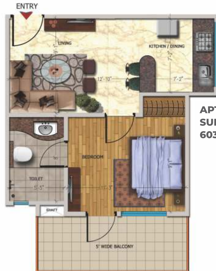
APT #06 SUPER AREA 603 SQ. FT.

FLOOR PLANS ARE FROM 3rd FLOOR AND ABOVE