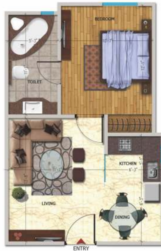
APT #02 SUPER AREA 635 SQ. FT.

FLOOR PLANS ARE FROM 3rd FLOOR AND ABOVE