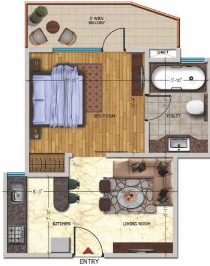
APT #03 SUPER AREA 639 SQ. FT.