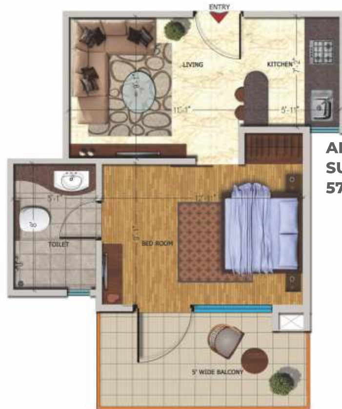
APT #08B SUPER AREA 587 SQ. FT.