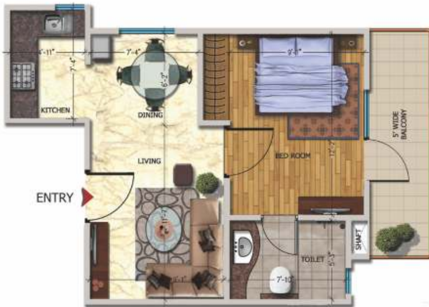
APT #05 SUPER AREA 652 SQ. FT.