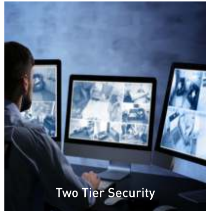
Two Tier Security