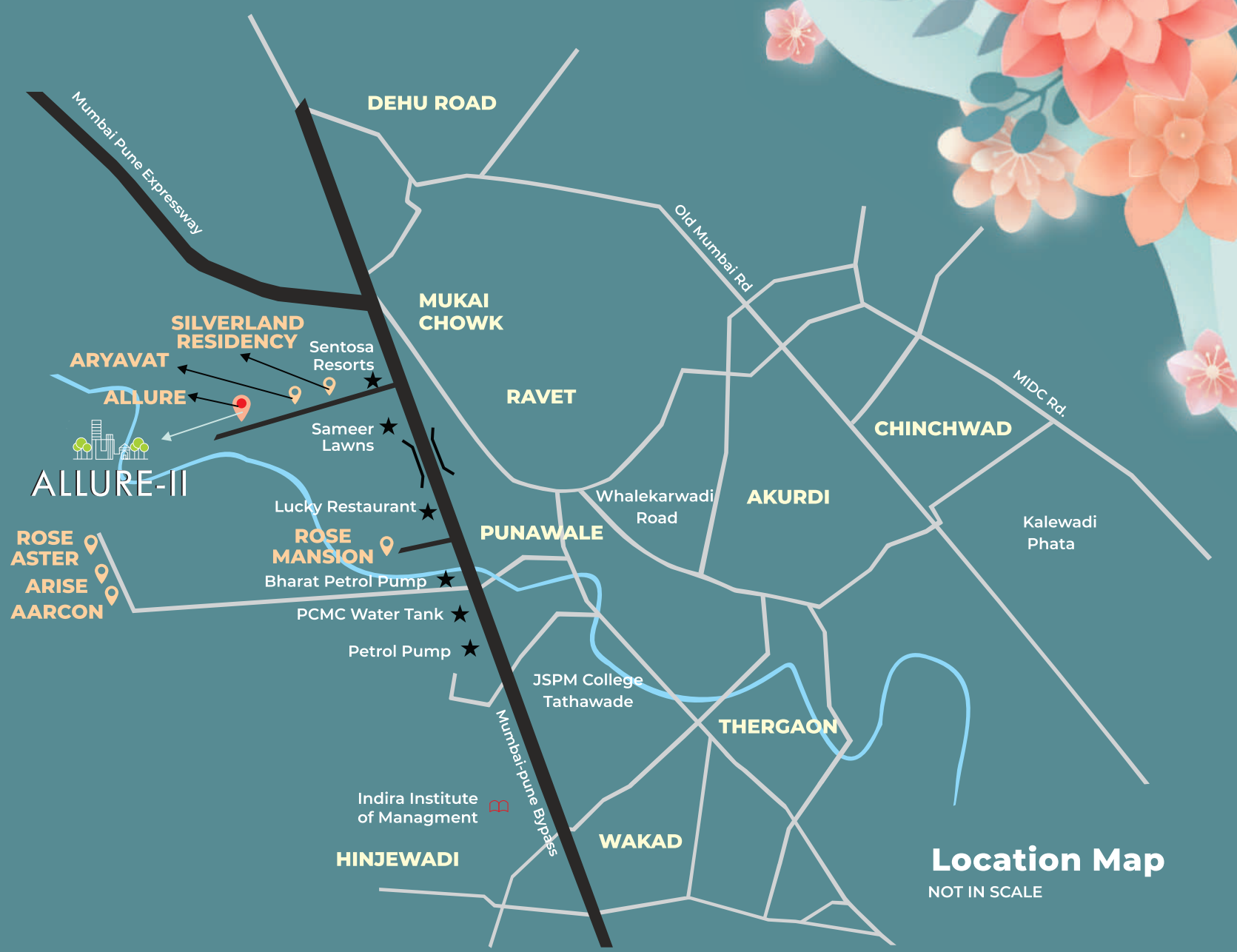
Location Map NOT IN SCALE

Rera Registration No. P52100034241 mahareraonline.gov.in