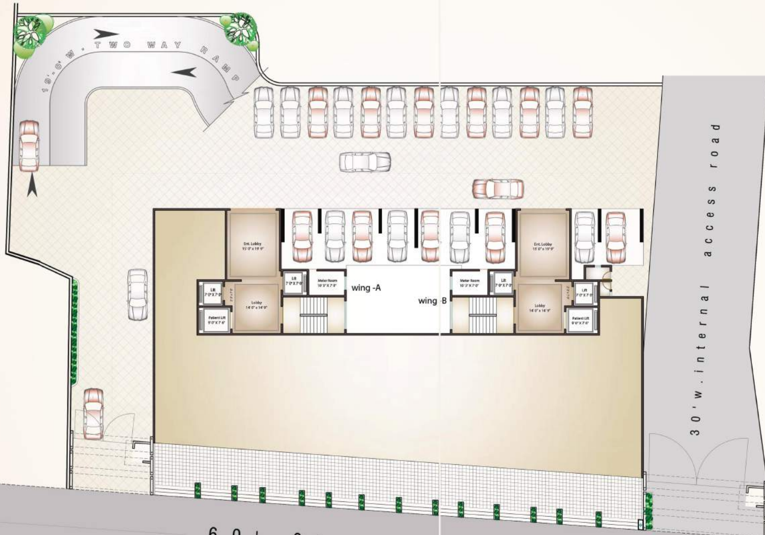
GROUND FLR PLAN

AVENUE — PARK - I — For a precious life!