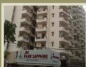
Actual Site Picture JM Park Sapphire - Vaishali