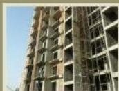
Actual Site Picture JM Orchid - Noida - Ongoing