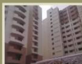
Actual Site Picture JM Royal Park - Vaishali