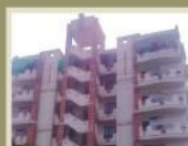
Actual Site Picture JM Royal Legacy - Vasundhara