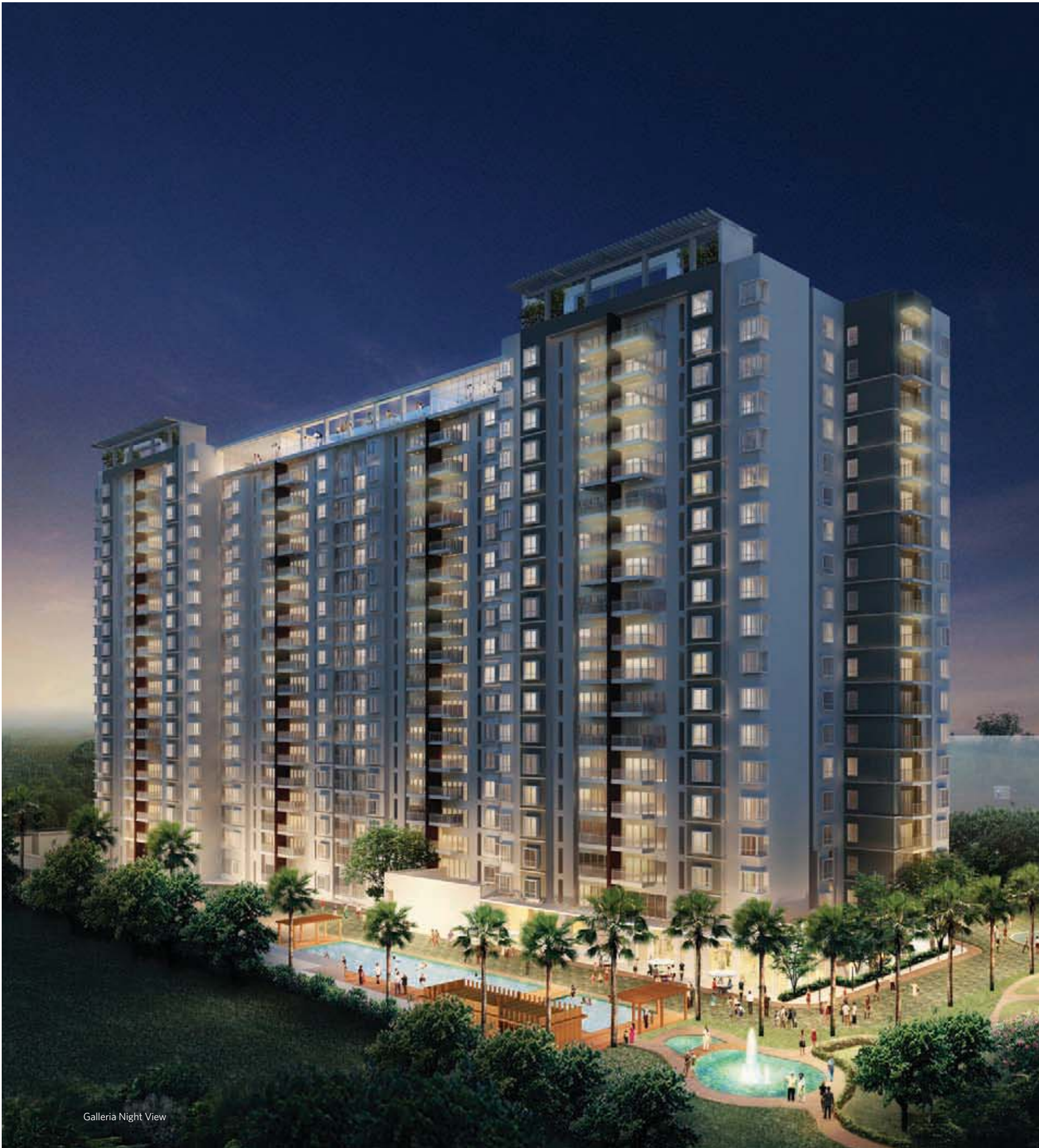
Galleria Night View

RMZ Corp is a leading corporate real estate developer redefining the real estate industry scape across India. Established in 2002 and head-quartered in Bangalore, we have built an impressive portfolio of projects spanning 13 million sq ft. Over 150 world-class corporations such as Airbus, Accenture, Boeing, Google and Rolls Royce (among others) occupy workspaces built and managed by RMZ. In the past 8 years, we have excelled in the area of developing office spaces. We are now extending our considerable expertise to building home concepts, shopping centres and hospitality spaces. RMZ brings prime investments to people at surprisingly good cost – layering value upon value.