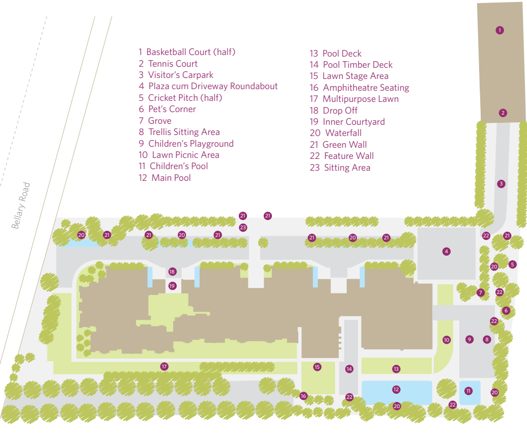
Above: Master Plan Left: Location Map

Galleria provides easy access to a 1/2 million sq ft of world class shopping. A retail destination with a hypermarket, boutique stores and anchor department stores offers a staggering variety of options to shoppers. Restaurants, food courts and a multiplex make it a complete, fun experience for visitors. As a resident of Galleria, you can choose to take full advantage of this wonderful convenience a stone's throw away. And yet, you can always maintain your privacy with separate access to the arcade, and safeguards that ensure that your exclusive living space will never be interfered with.