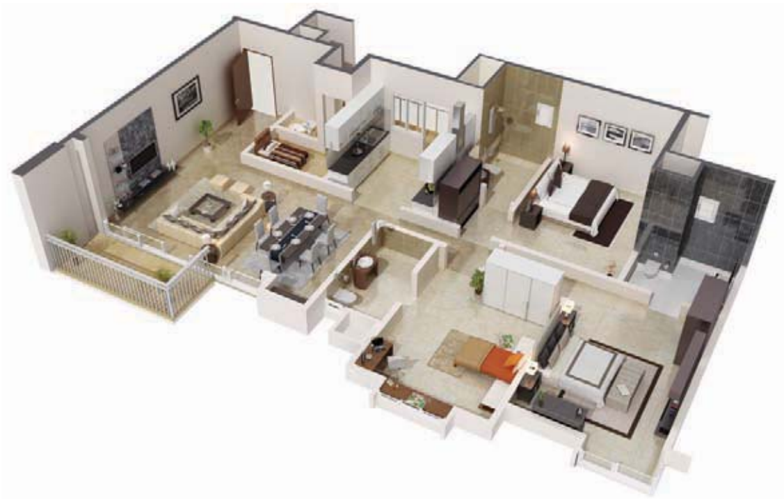
Above: 2 Bedroom Home Below: 3 Bedroom Home Left: Living Room