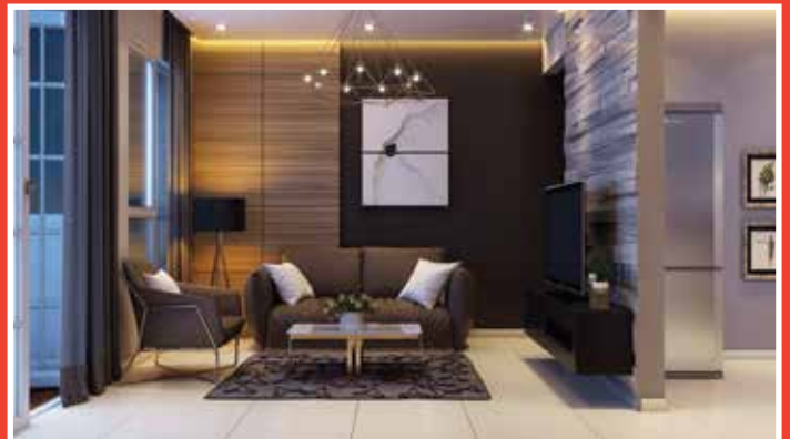
Artist's Impression of Living Room