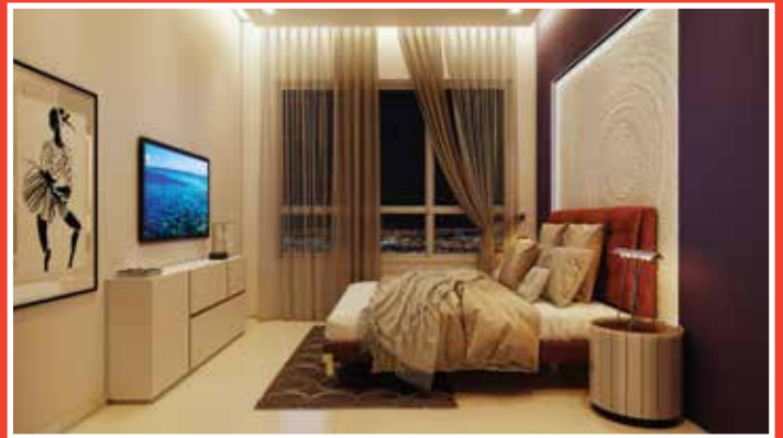
Artist's Impression of Guest Room