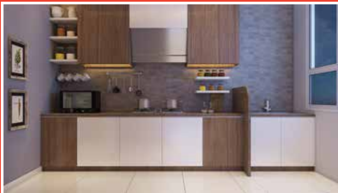
Artist's Impression of Kitchen