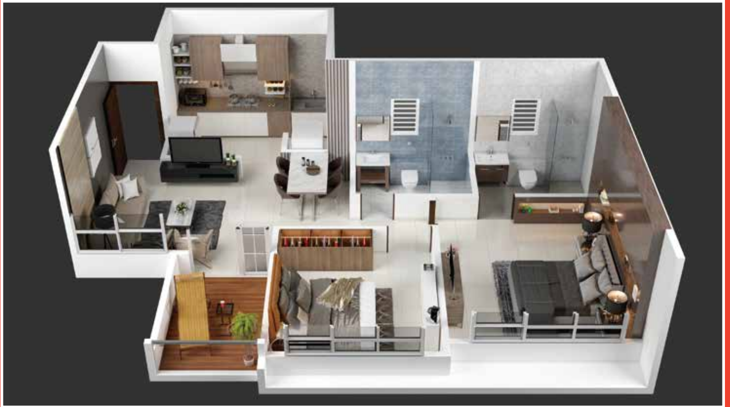
Artist's Impression of 2 BHK Cut Section