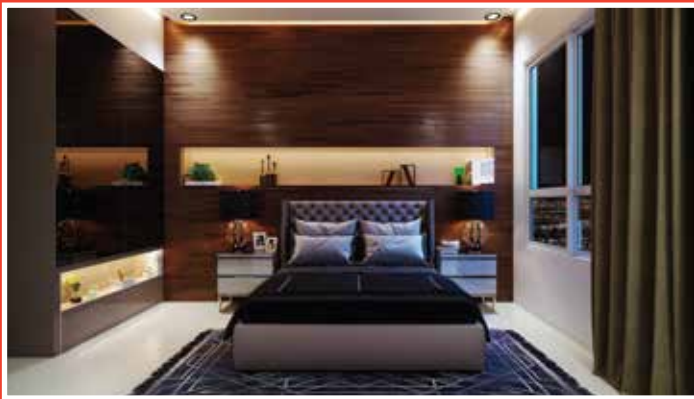
Artist's Impression of Master Bedroom