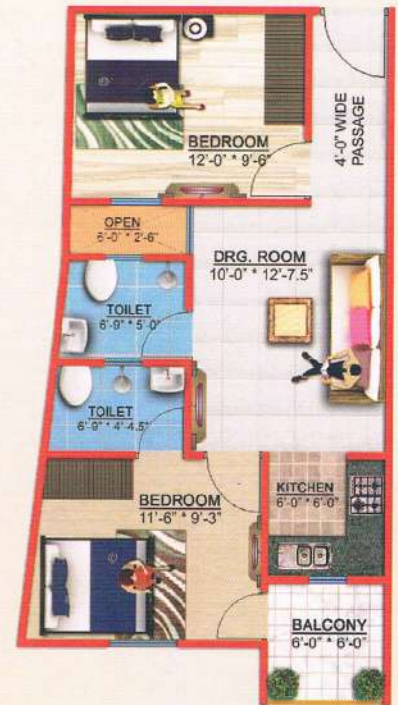
UNIT - 01 (2BHK) 700 SQ.FT. Aprox