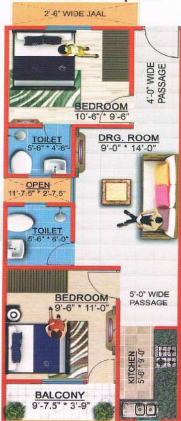
UNIT - 03 (2BHK) 725 SQ.FT. Aprox