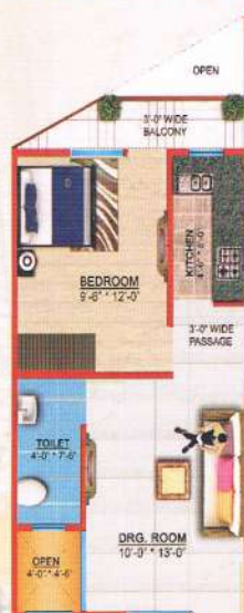
UNIT - 07 (1BHK) 500 SQ.FT. Aprox