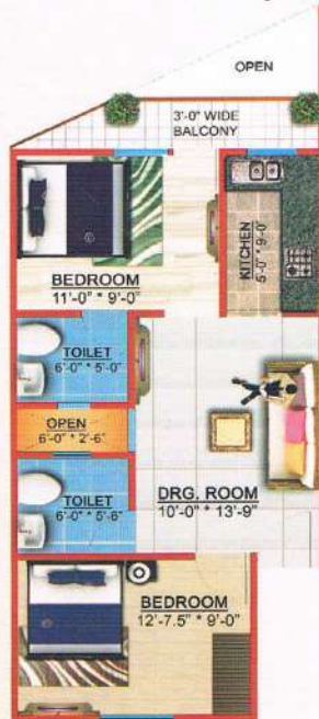
UNIT - 06 (2BHK) 700 SQ.FT. Aprox