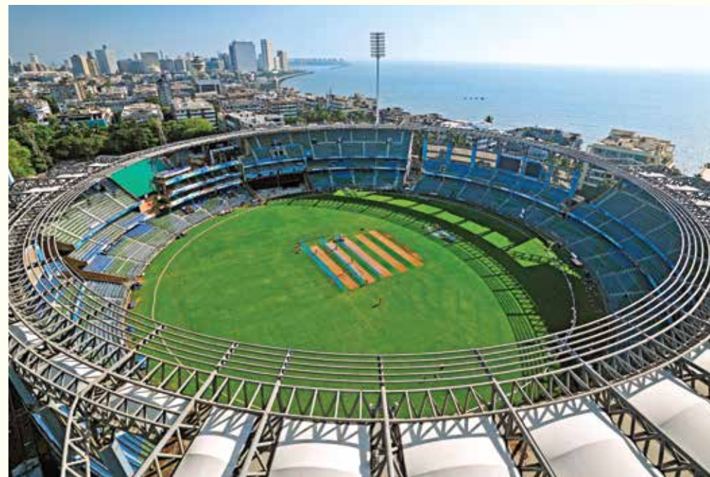
Wankhede Stadium, Mumbai

Larsen & Toubro, a USD 21 Billion conglomerate. You've seen this name on megastructures, gigantic construction sites and in the headlines - reporting benchmark setting projects in India and abroad. From our earliest days of manufacture to our most recent projects, L&T has been a critical part of India's growth. Today, many of India's iconic buildings, airports to IT parks, malls to monuments, carry our signature of excellence.