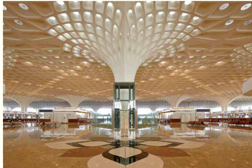
Chhatrapati Shivaji International Airport Terminal 2, Mumbai

Larsen & Toubro, a USD 21 Billion conglomerate. You've seen this name on megastructures, gigantic construction sites and in the headlines - reporting benchmark setting projects in India and abroad. From our earliest days of manufacture to our most recent projects, L&T has been a critical part of India's growth. Today, many of India's iconic buildings, airports to IT parks, malls to monuments, carry our signature of excellence.