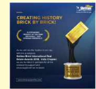
Golden Brick International Real Estate Awards 2018 Outstanding Project Of The Year