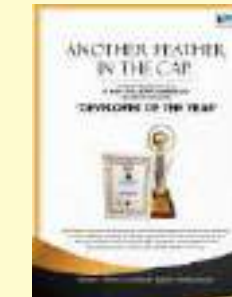
ET Now Real Estate Awards 2018 Developer of the year