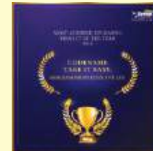
Winner of South India's Real Estate Leadership Awards, 2018 Most Admired Upcoming Project Of The Year 2018