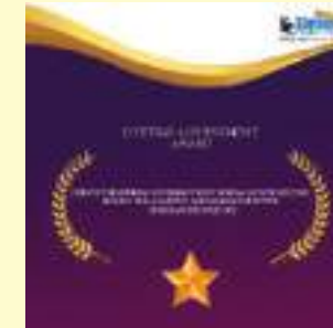
South India's Real Estate Leadership Awards 2018 by Global Real Estate Congress - 2nd Edition Lifetime Achievement Award

...and a legacy of winning hearts and then some more.