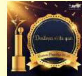
ET NOW Rise with India , 2018 Developer of the year