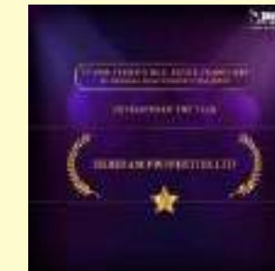
ET Now Presents Real Estate Awards 2019 by Global Real Estate Congress Developer of the Year