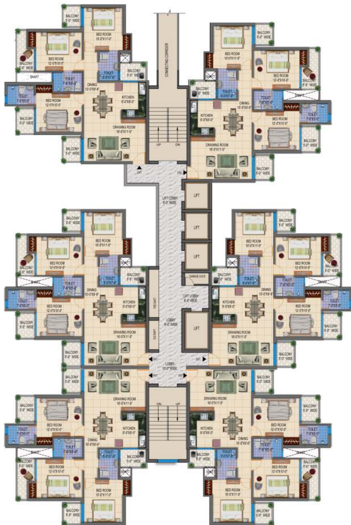
TOWER - F & G TYPICAL FLOOR PLAN