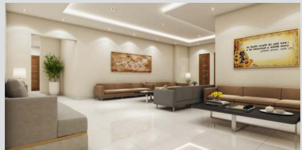
Senior Citizens Lounge