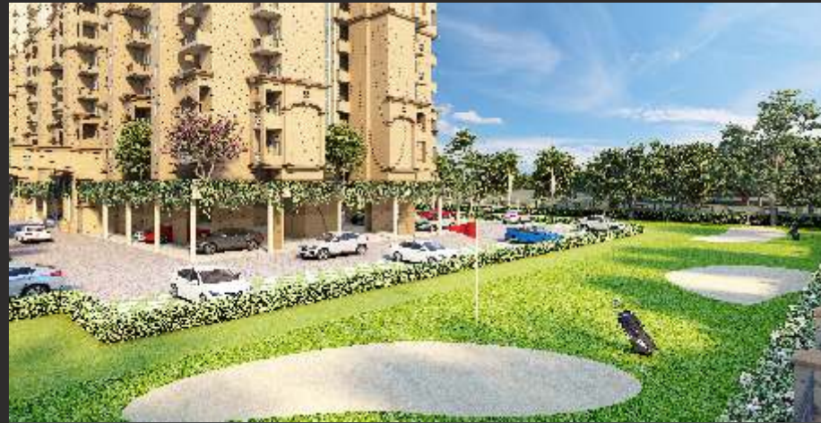
Mini Golf Putting