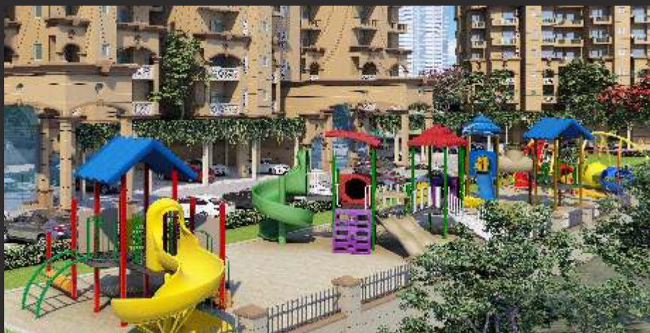
Kids Play Area