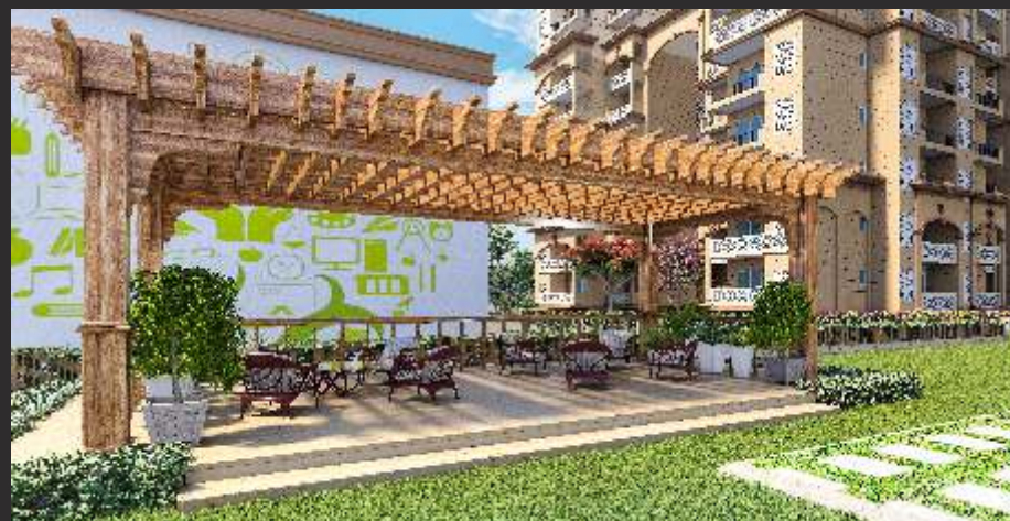
Open Sitting Area