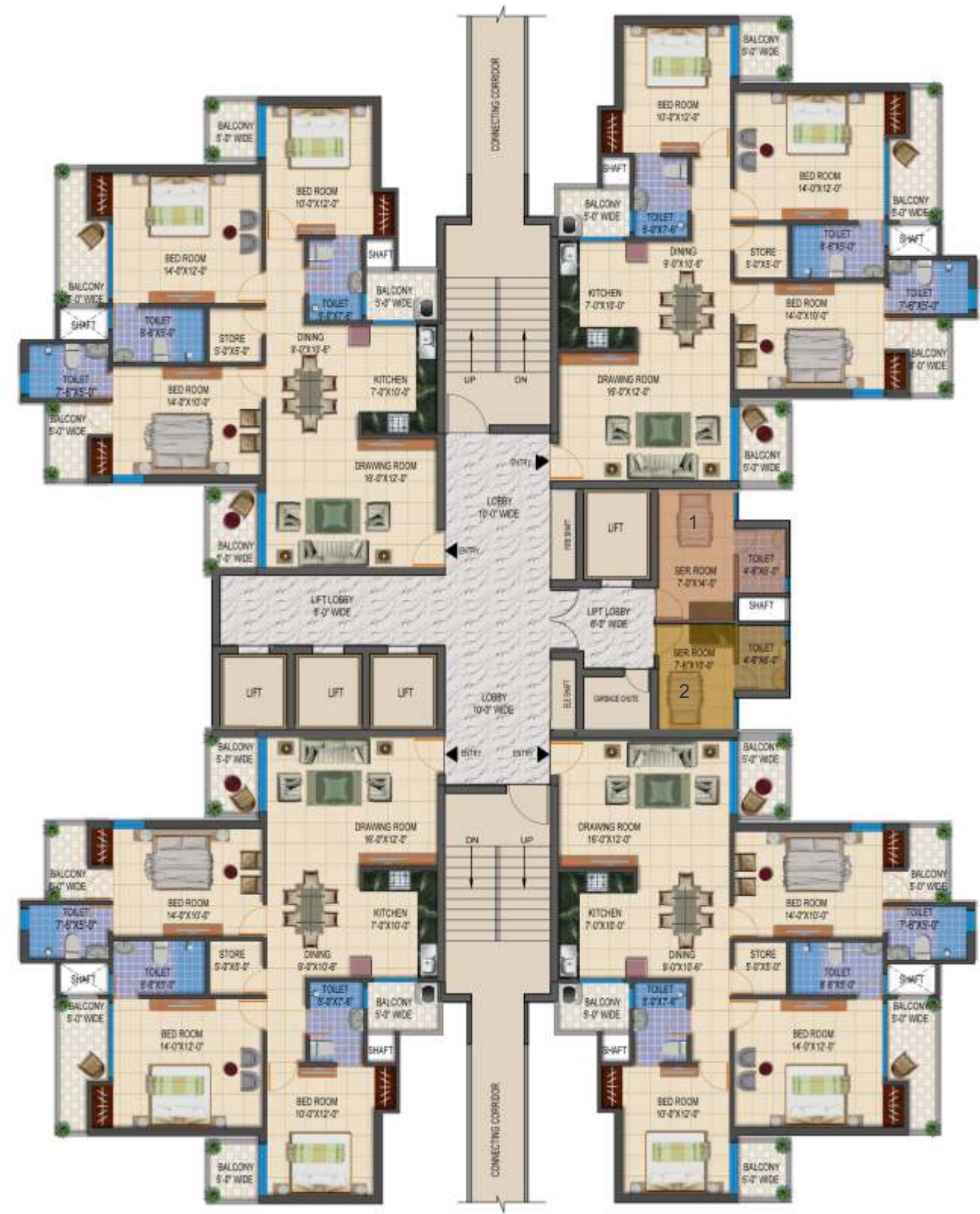
TOWER - B TYPICAL FLOOR PLAN