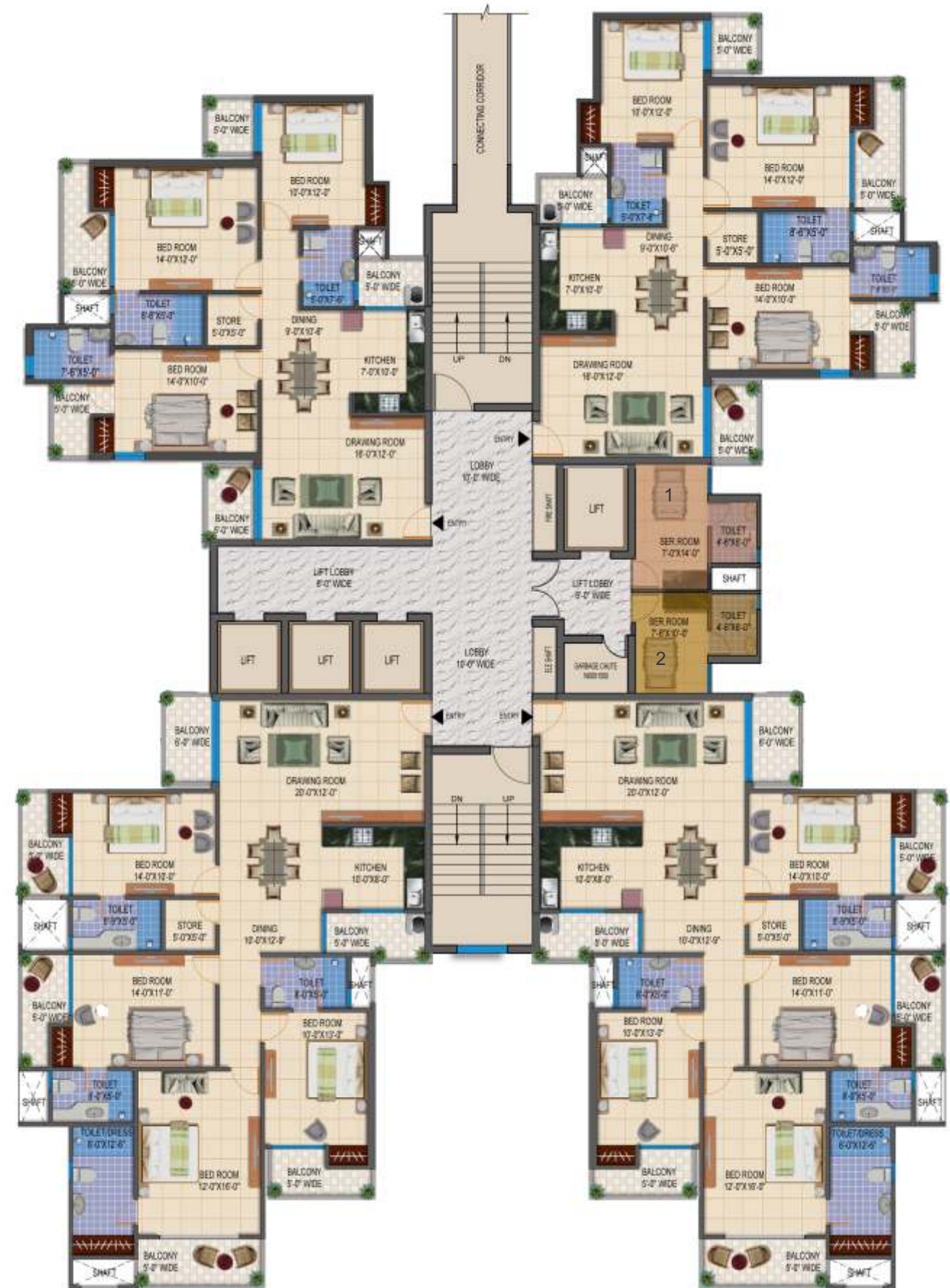
TOWER-A & D TYPICAL FLOOR PLAN