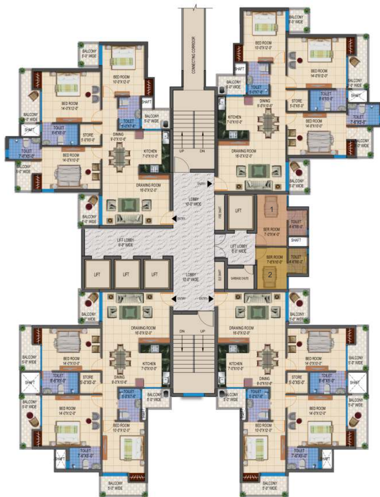
TOWER - C & E TYPICAL FLOOR PLAN