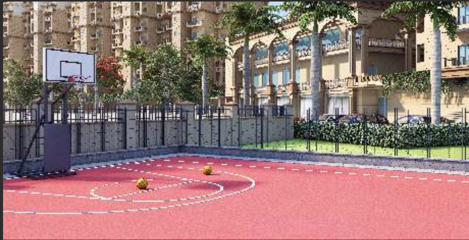
Basket Ball Court

Embrace yourself for a much desired living full of Multiple Sports and Entertainment facilities for elders and kids alike. An Imperial life where ordinary is nothing.