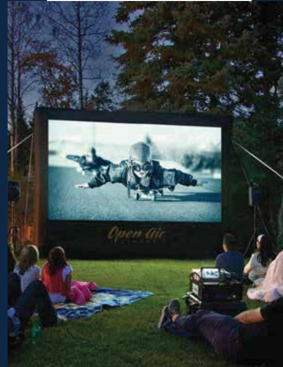
Open to sky mini theatre