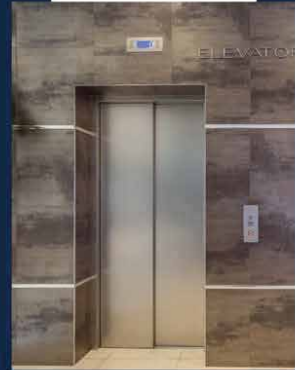
3-high Speed Elevators