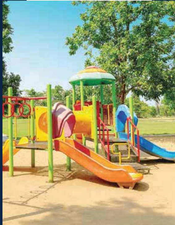
Garden Area With Play Area