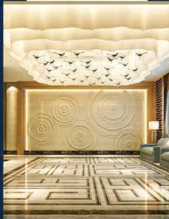
Lavish Entrance Lobby