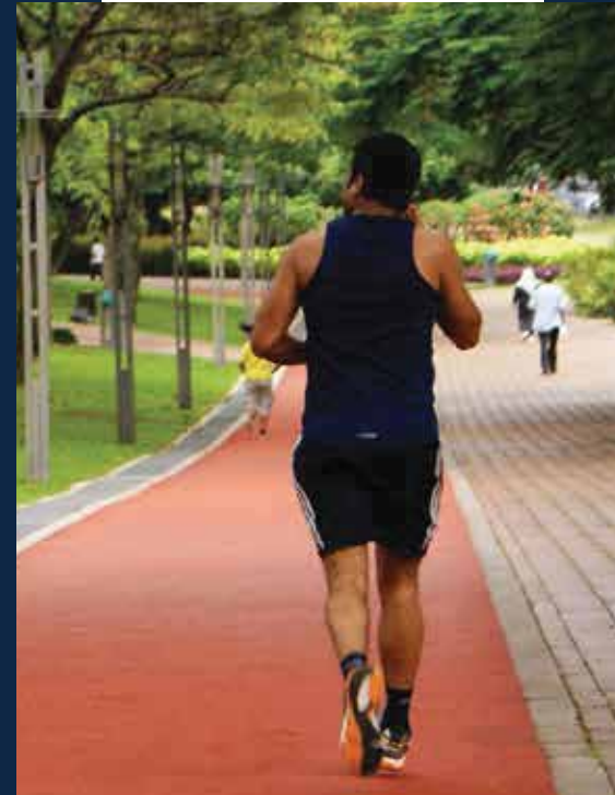
Walk Way - Jogging Track