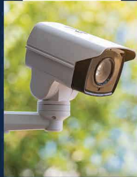
Cctv & Intercom