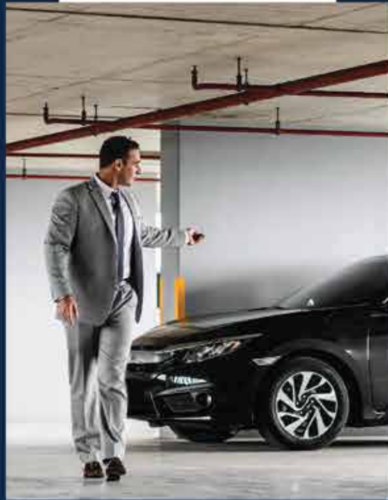
Podium Car Parking