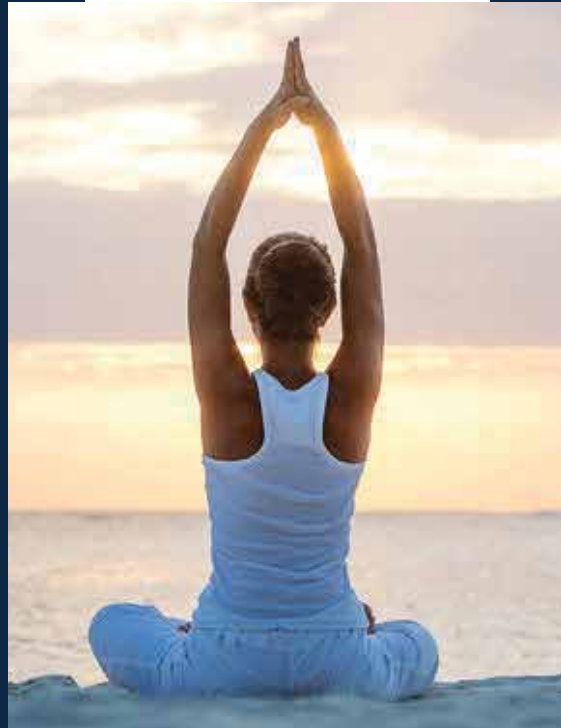
Terrace Yoga Area