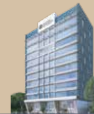
Crescent Solitaire Business Park Andheri (East) Maha Rera No.: P51800010460