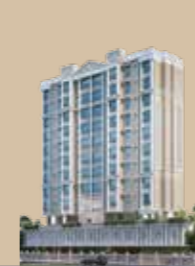
Crescent Exotica Andheri (East) Maha Rera No.: P51800013188