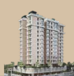
Crescent Grande Andheri (East)