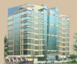
Crescent Business Park Andheri (East)