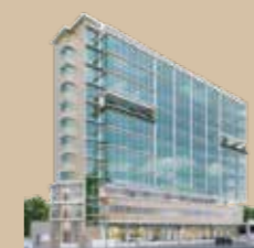
Crescent Business Square Andheri (East)