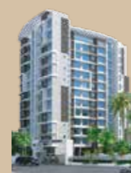
Crescent Residency Andheri (East)