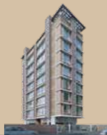
Crescent Rudra Kandivali (East) Maha Rera No.: P51800010461