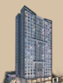
Crescent Horizon Kandivali (East) Maha Rera No.: P51800024455