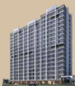
Crescent Sky Heights Dahisar (East) Maha Rera No.: (Phase-1) P51800011325 Maha Rera No.: (Phase-2) P51800014393