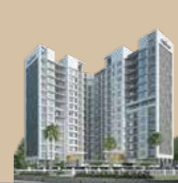
Crescent Solitaire Andheri (East)