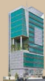
Crescent Ruby Business Boulevard Kandivali (East)