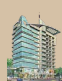
Crescent Plaza Andheri (East)