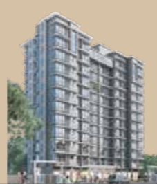
Crescent Landmark Andheri (East) Maha Rera No.: P51800003163