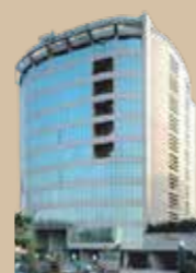
Crescent Avenue Andheri (East)