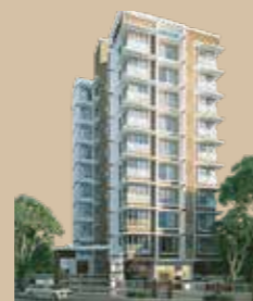
Crescent Imperia BKC NX. Kalina Maha Rera No.: P51800002184