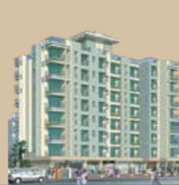
Crescent Hill View Vikhroli (West)