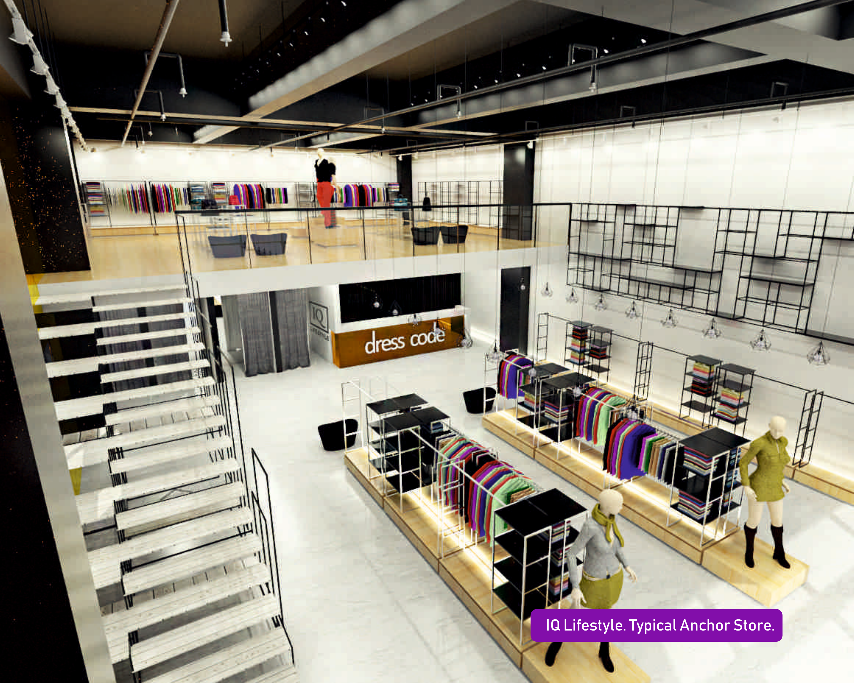
IQ Lifestyle. Typical Anchor Store.