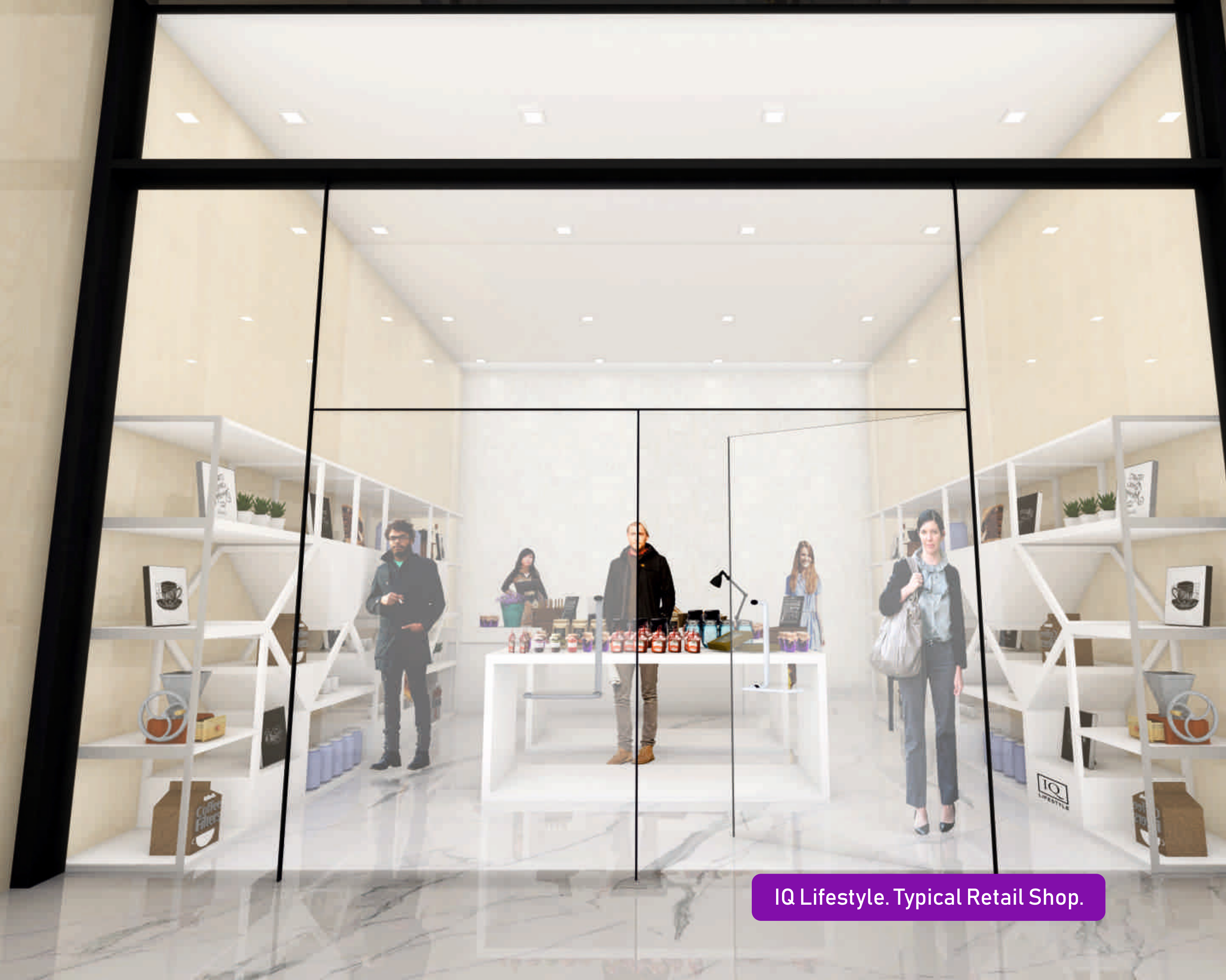
IQ Lifestyle. Typical Retail Shop.