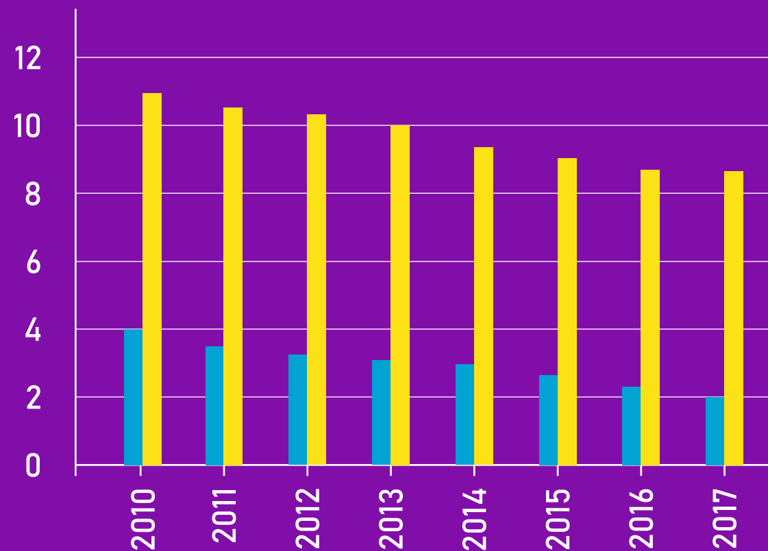
GRAPH : YIELD IN REAL ESTATE SEGMENTS

Year 2014-15 saw saturated residential market which shifted the investor focus to commercial real estate