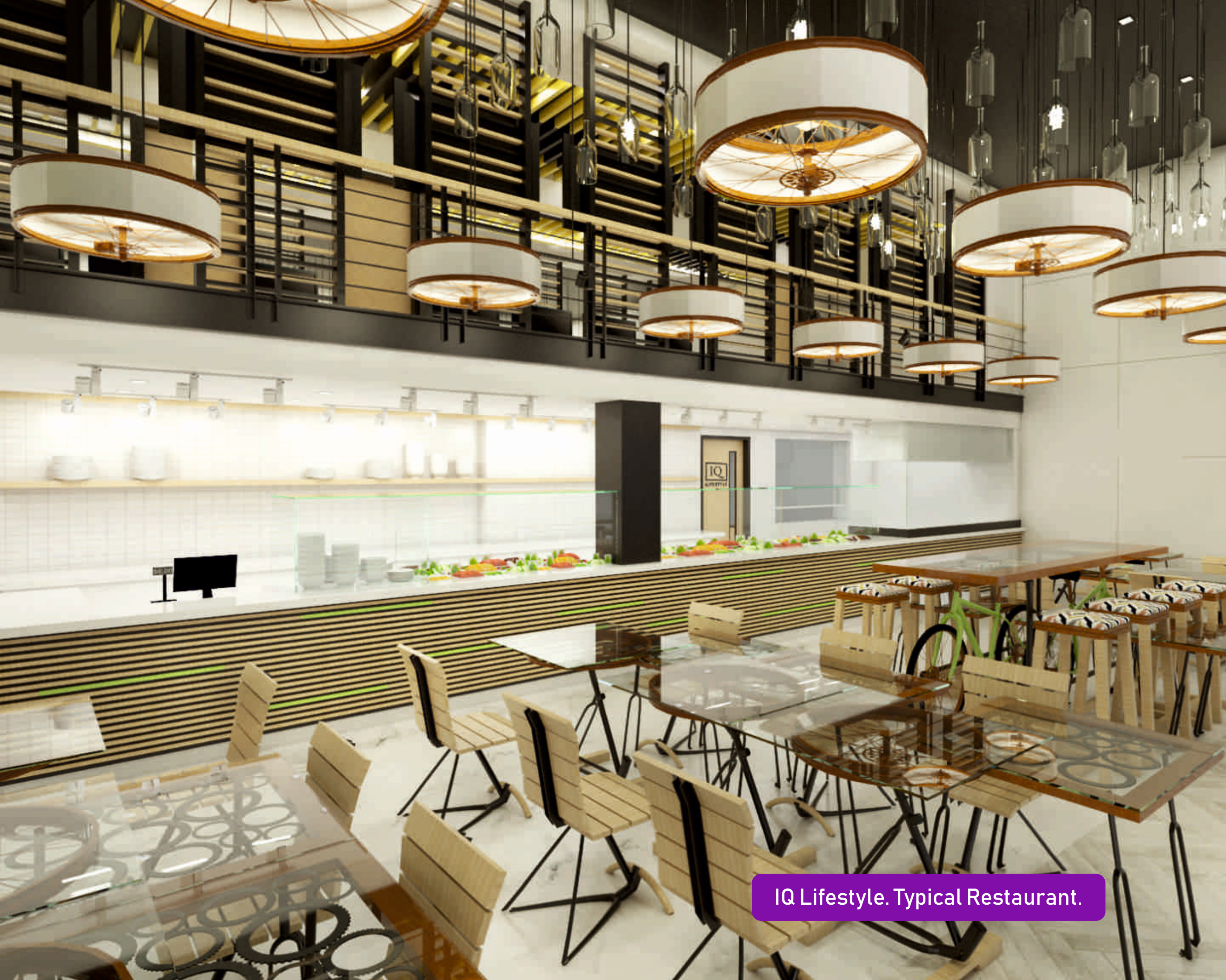
IQ Lifestyle. Typical Restaurant.