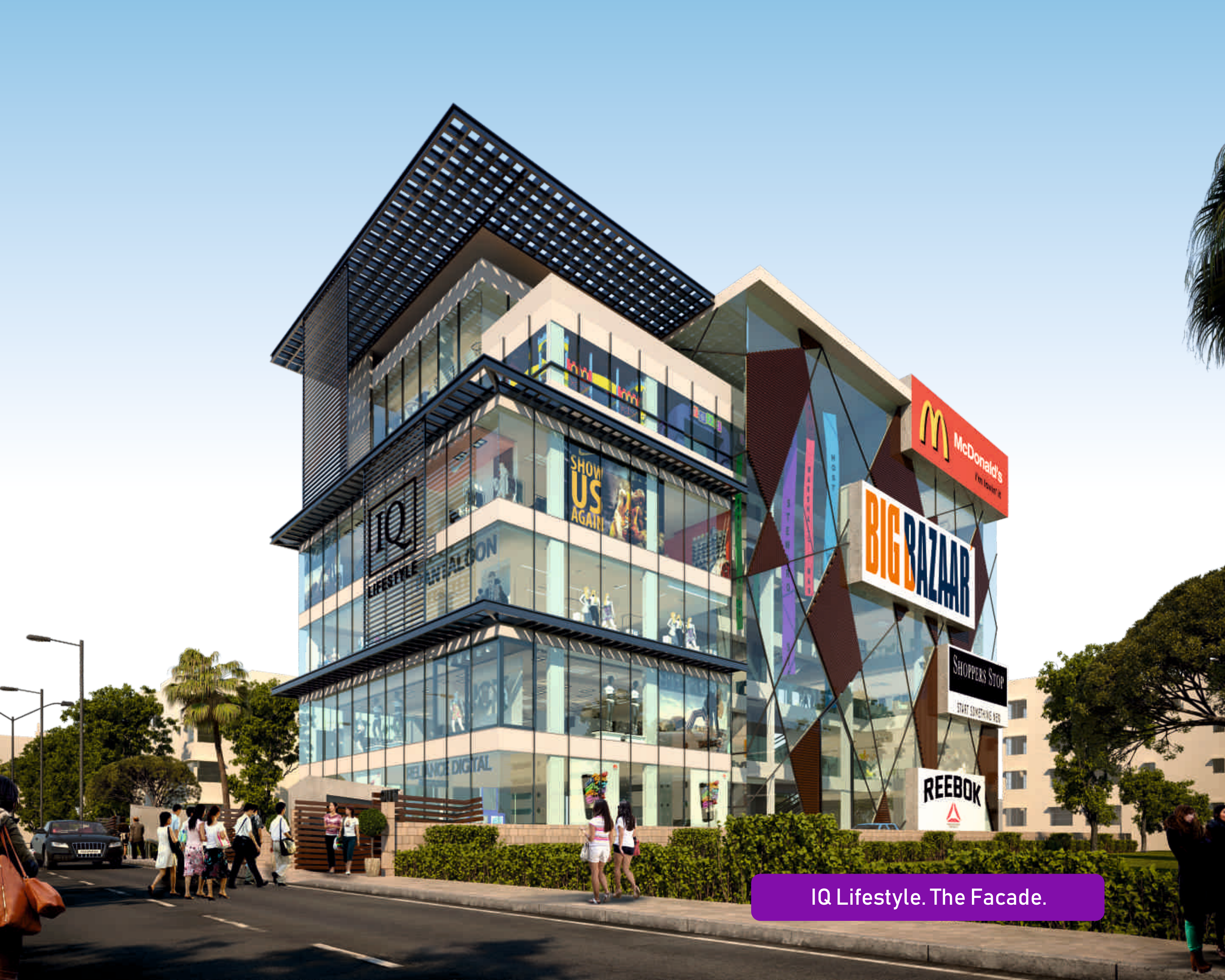
IQ Lifestyle. The Facade.