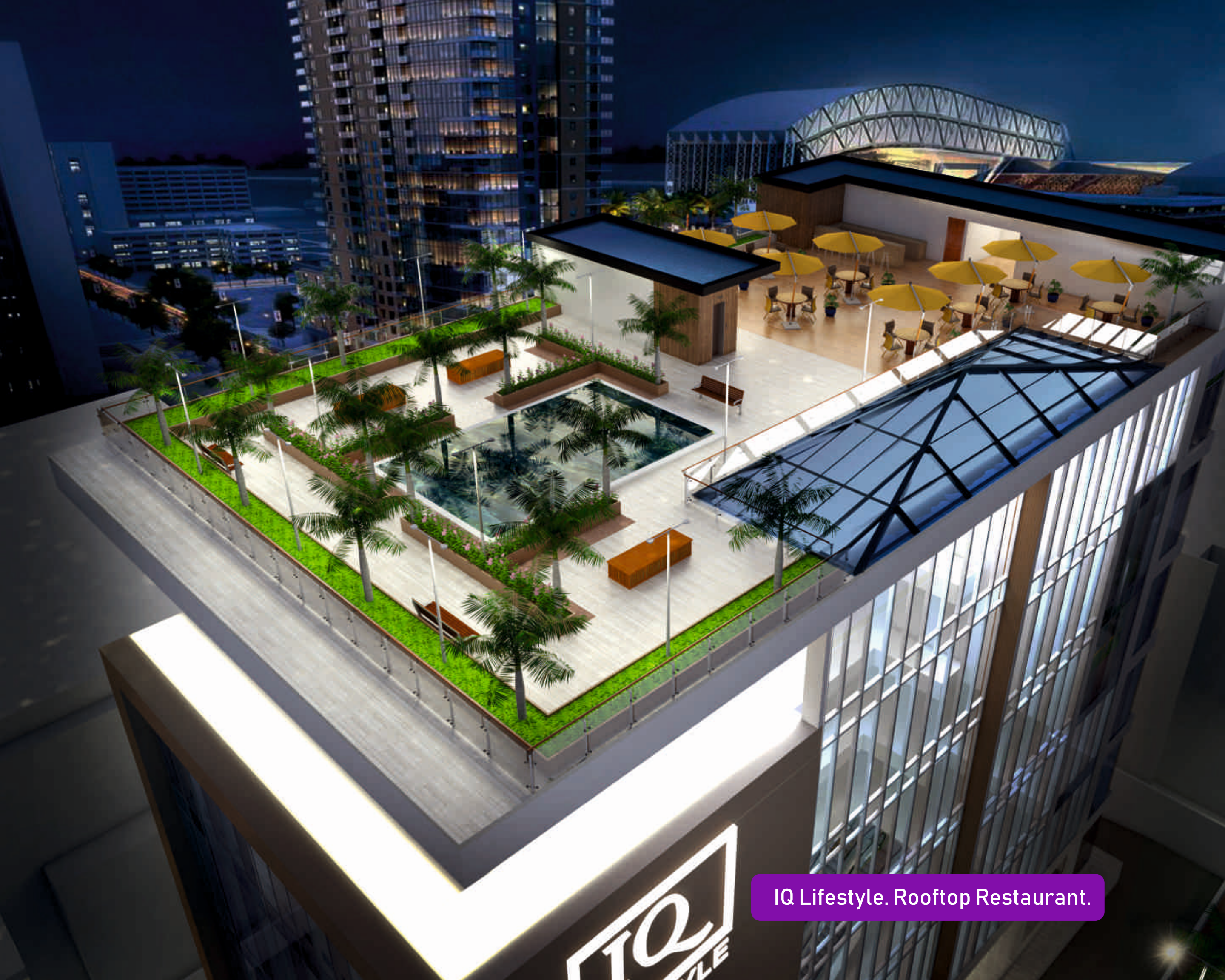
IQ Lifestyle. Rooftop Restaurant.