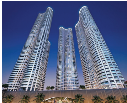
The World Towers

India's finest residences on Mumbai's Billionaires' Row.