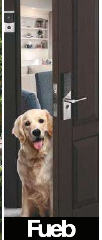
HOMES THAT ARE INTELLIGENT ...