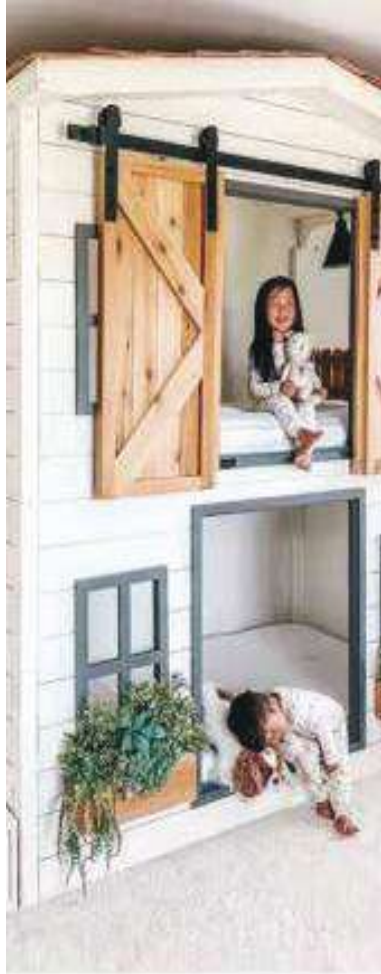
HOMES THAT FLEX ...