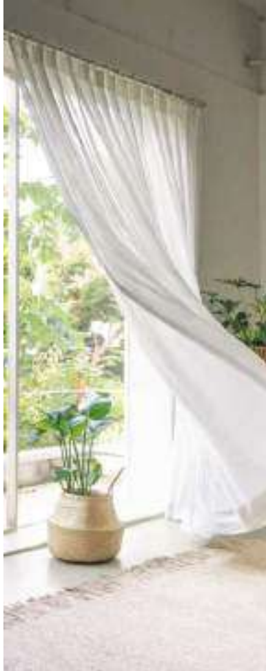
HOMES THAT BREATHE ...