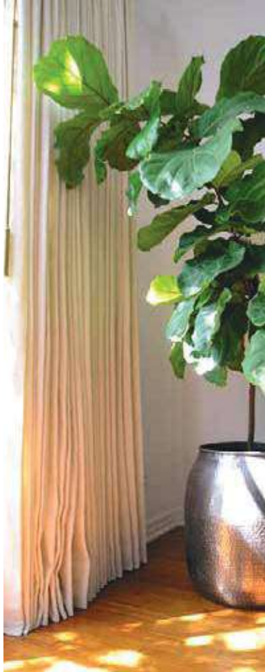
HOMES THAT SHINE ...