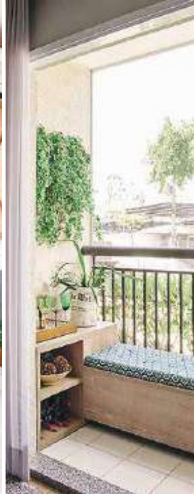
HOMES THAT CONNECT ...