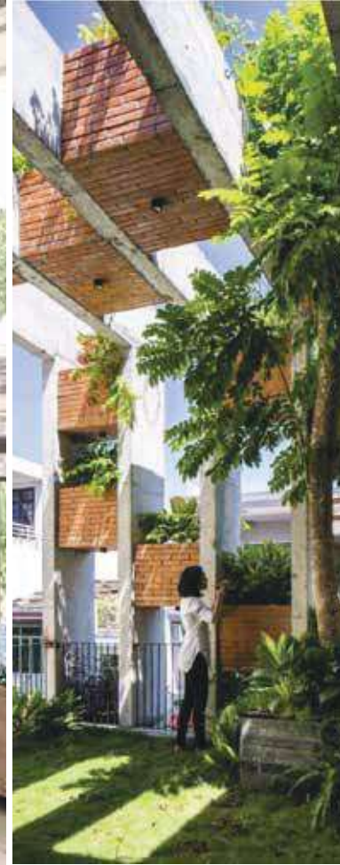
HOMES THAT EXPERIENCE NATURE ...