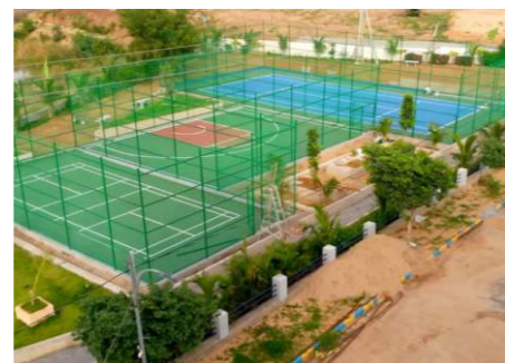
Actual Photograph from the Project

Every sport ever played encourages a spirit of taking pleasure in the process than the result. Winning is just a part of any game. Here, at Giridhari Elite, accommodated in the our very own Green County located at Amistapur in Mahabubnagar, studded into its enclave are numerous facilities that bring out the sport in you. Embrace your love for sports & games and make joy your best neighbour.