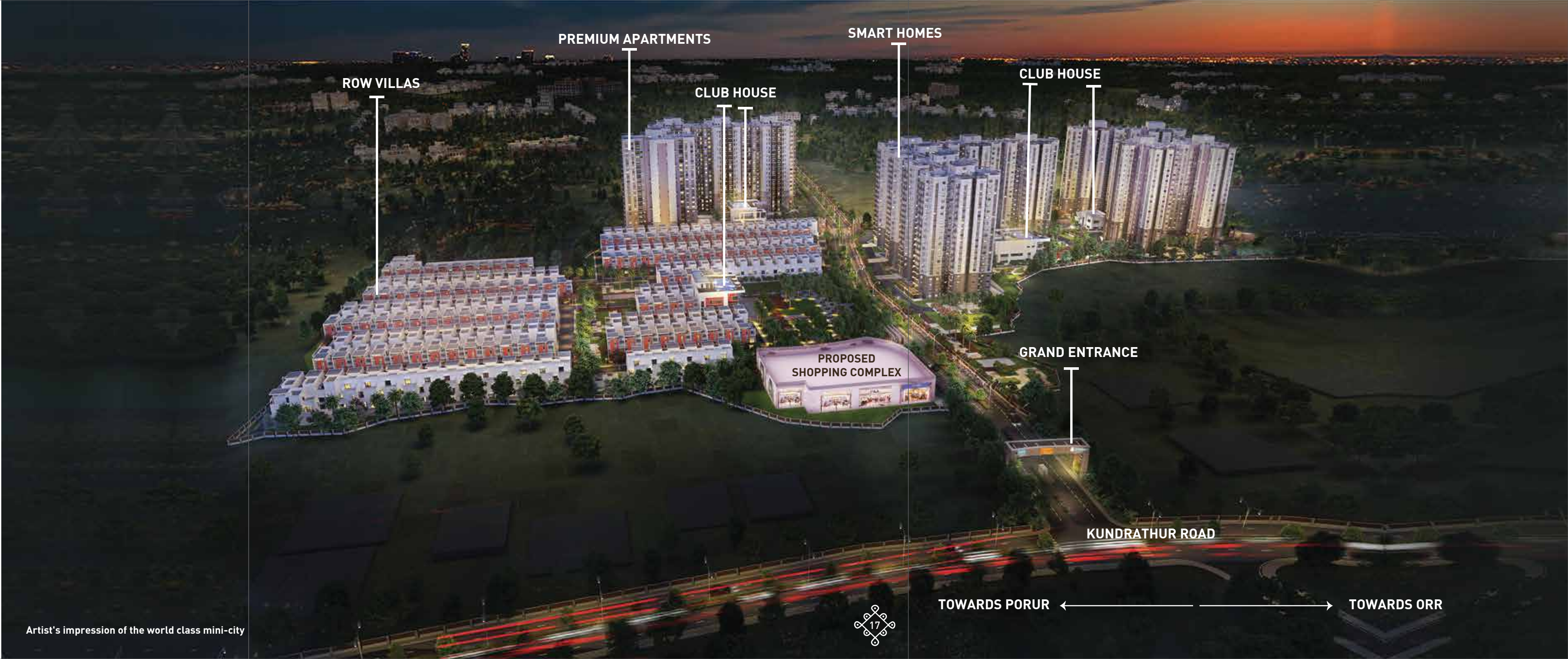
Artist's impression of the world class mini-city