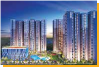
Marina Skies, Hyderabad

Track record of successful deliveries in high-rise residential and commercial real estate for the past 12 years