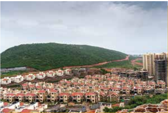
Vizag's most premium address. Phase - 1 delivered.