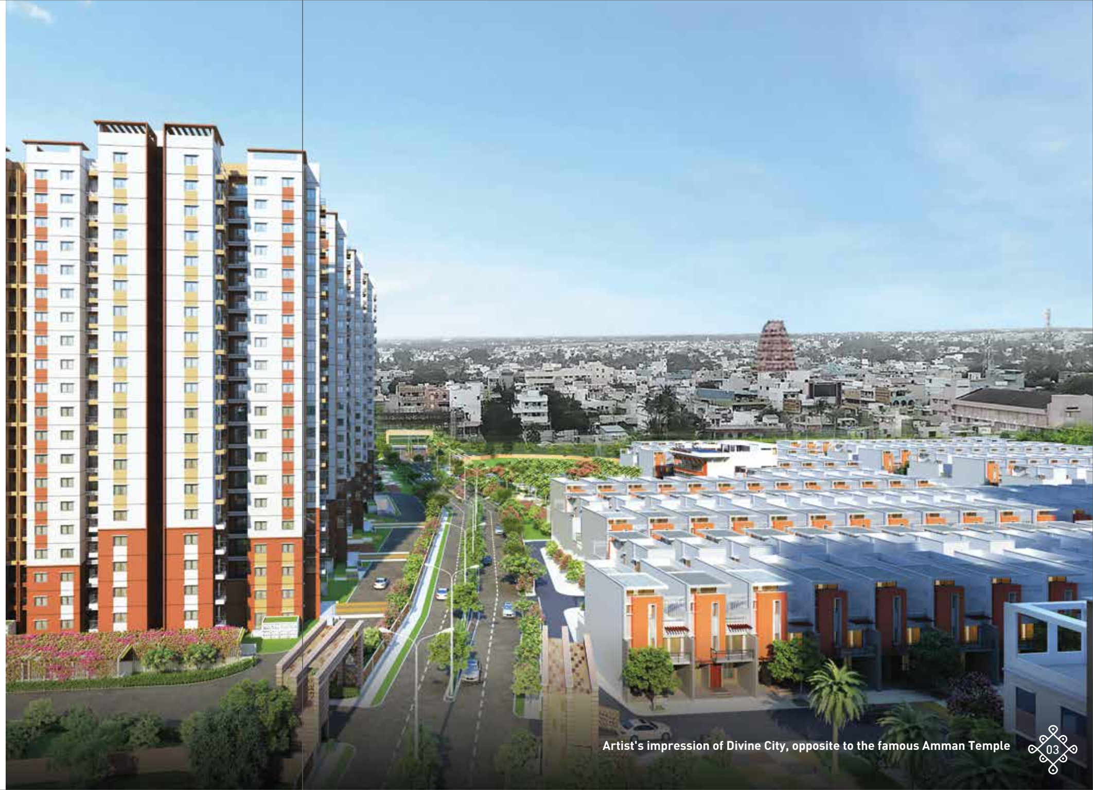
Artist's impression of Divine City, opposite to the famous Amman Temple

Now Mangadu will get it's second famous address.