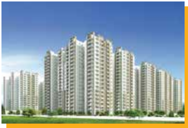
Rainbow Vistas @ Rock Garden, Hyderabad

Delivered 5 million sq.ft. of residential living spaces