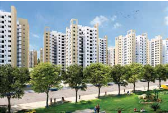
A 314 acre mega city under development in Kolkata