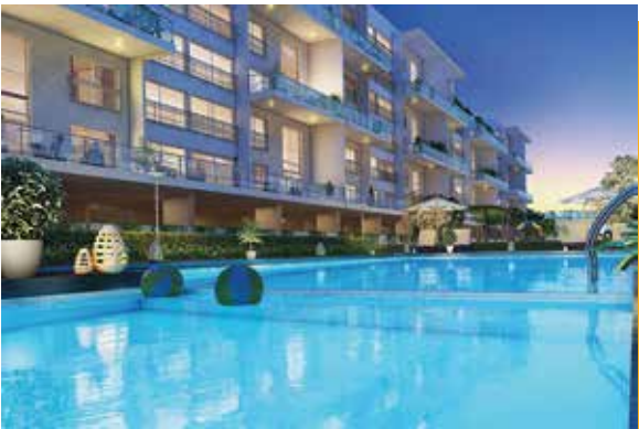
16 completed projects and 10 ongoing projects in Bangalore