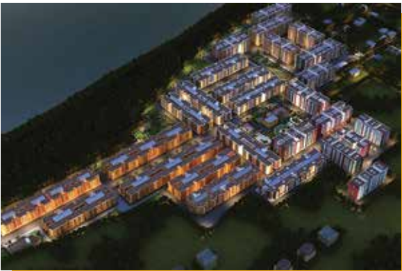
2 projects delivered/under construction in Chennai On an aggressive spree with 5 new projects in the pipeline.