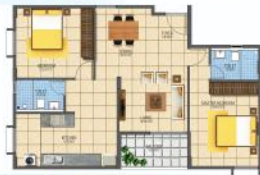
2 BHK EAST FACING