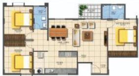
3 BHK NORTH FACING