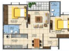
2 BHK West Facing

“ Our good ventilation systems will help expel a build up of pollutants, bacteria and moisture. A ventilated room will instantly be more comfortable and reduces condensation.