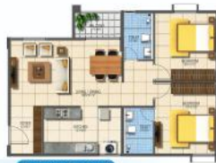
2 BHK NORTH FACING