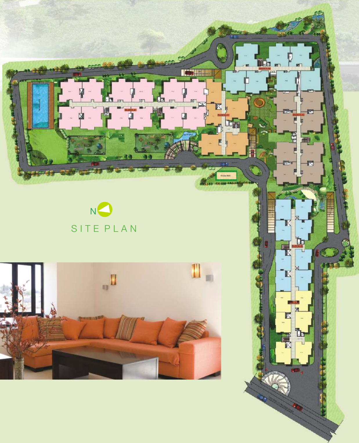
N SITE PLAN