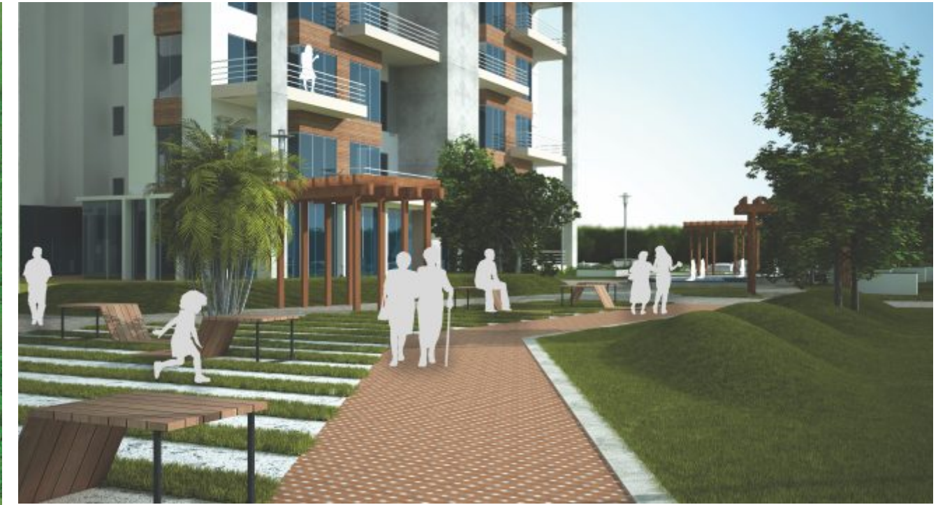
Children Play Area with Sand Pit Acupressure Track Proposed Wing E Microplex Half Basketball Court Jogging Track Club House Beach Volleyball Cricket Pitch Swimming Pool