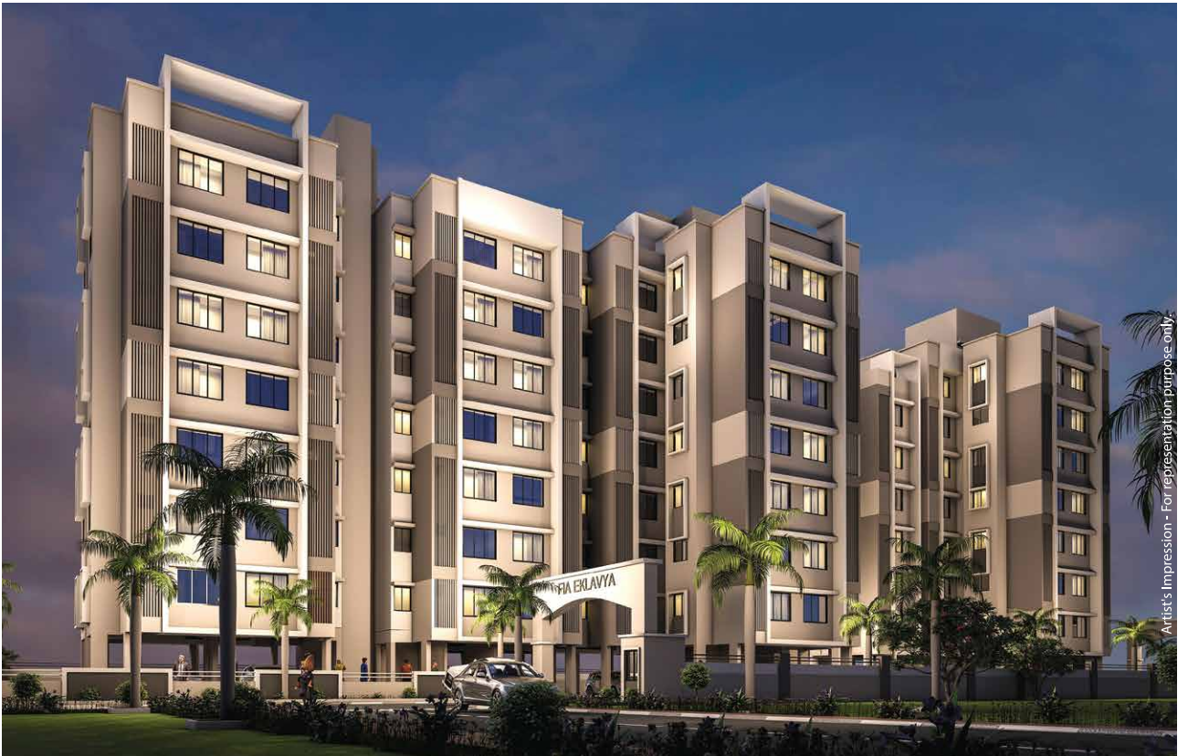
Artist's Impression - For representation purpose only.