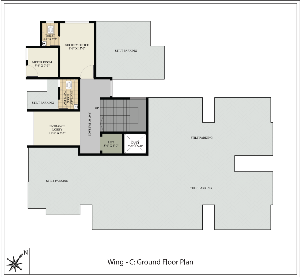
Wing - C: Ground Floor Plan