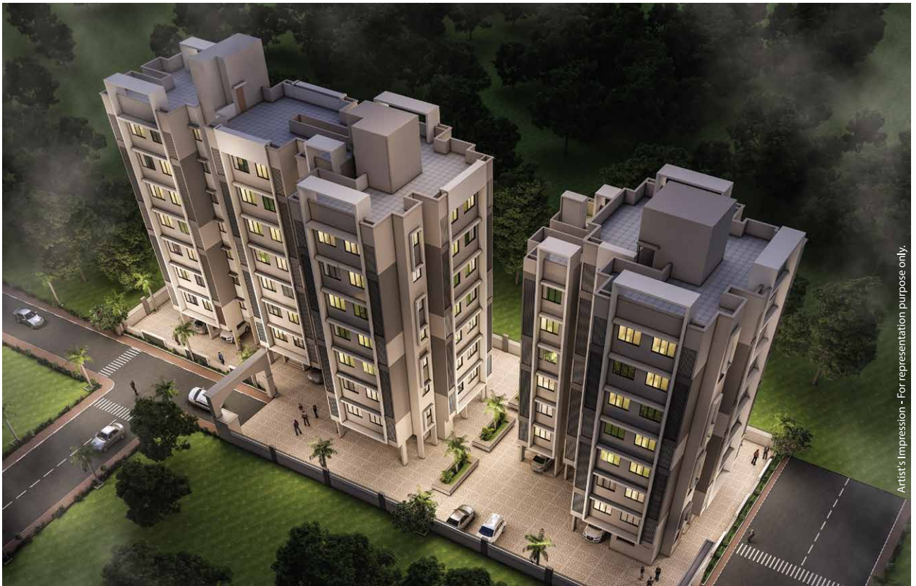
Artist's Impression - For representation purpose only.