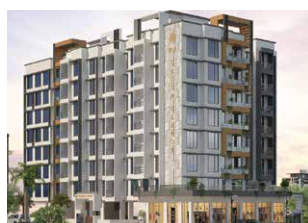
FIA ORION GRANDE