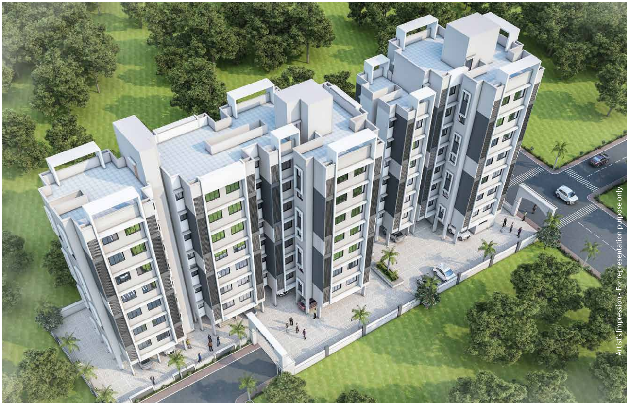
Artist's Impression - For representation purpose only.