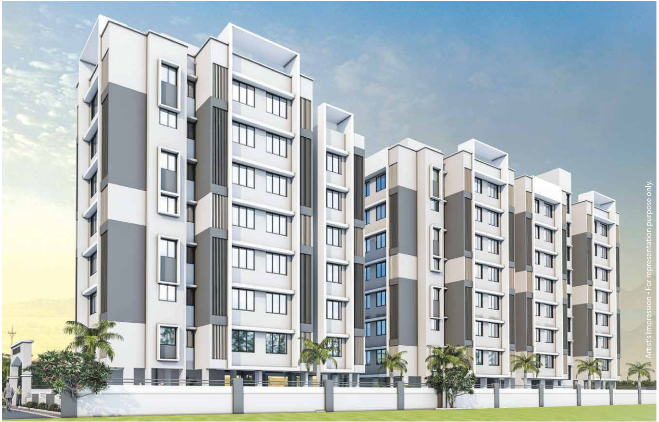
Artist's Impression - For representation purpose only.