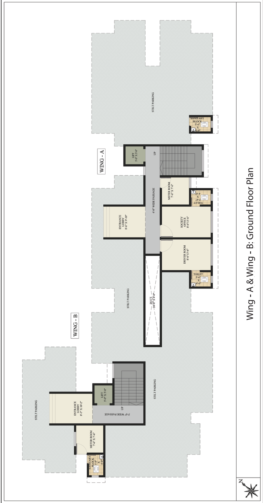
Wing - A & Wing - B: Ground Floor Plan