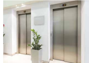
HIGH SPEED LIFT