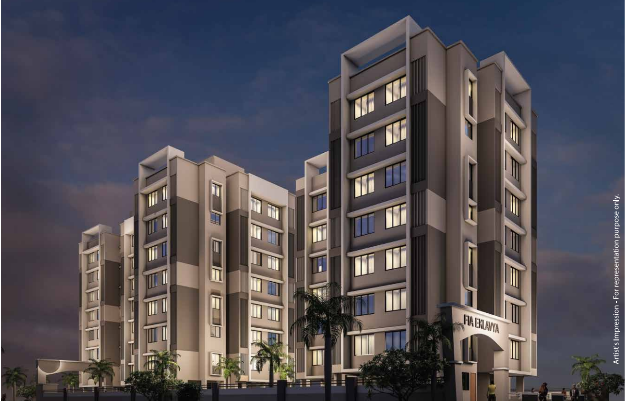
Artist's Impression - For representation purpose only.