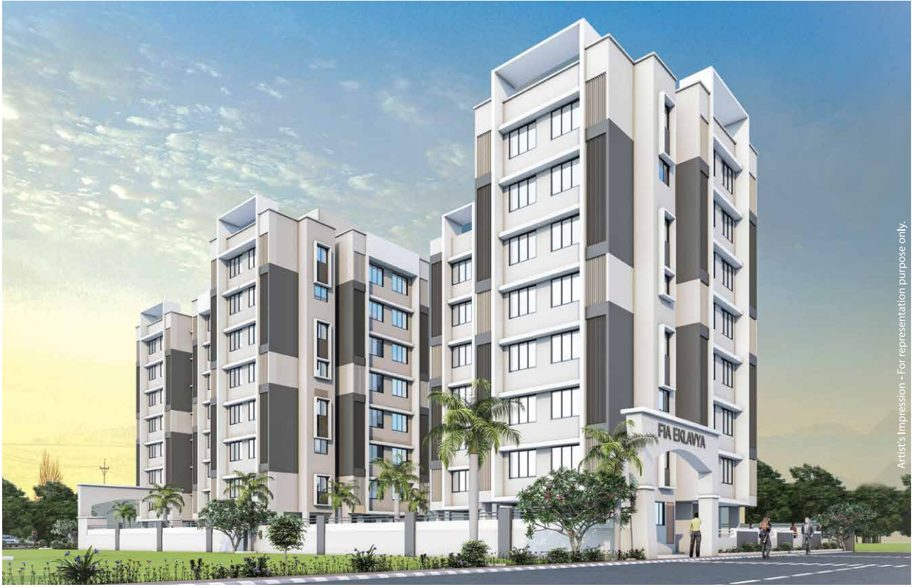
Artist's Impression - For representation purpose only.