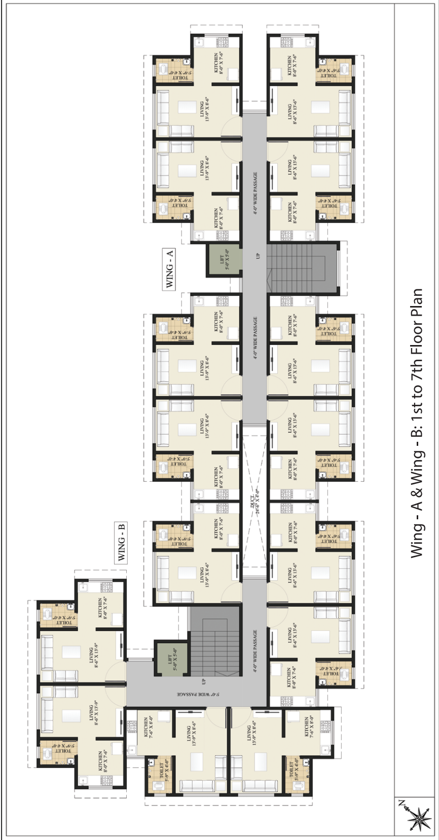
Wing - A & Wing - B: 1st to 7th Floor Plan