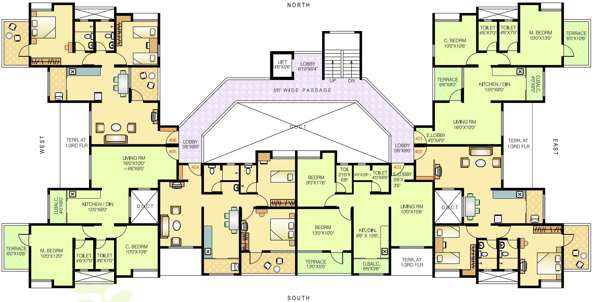
AREA STATEMENT IN SQ.FT.