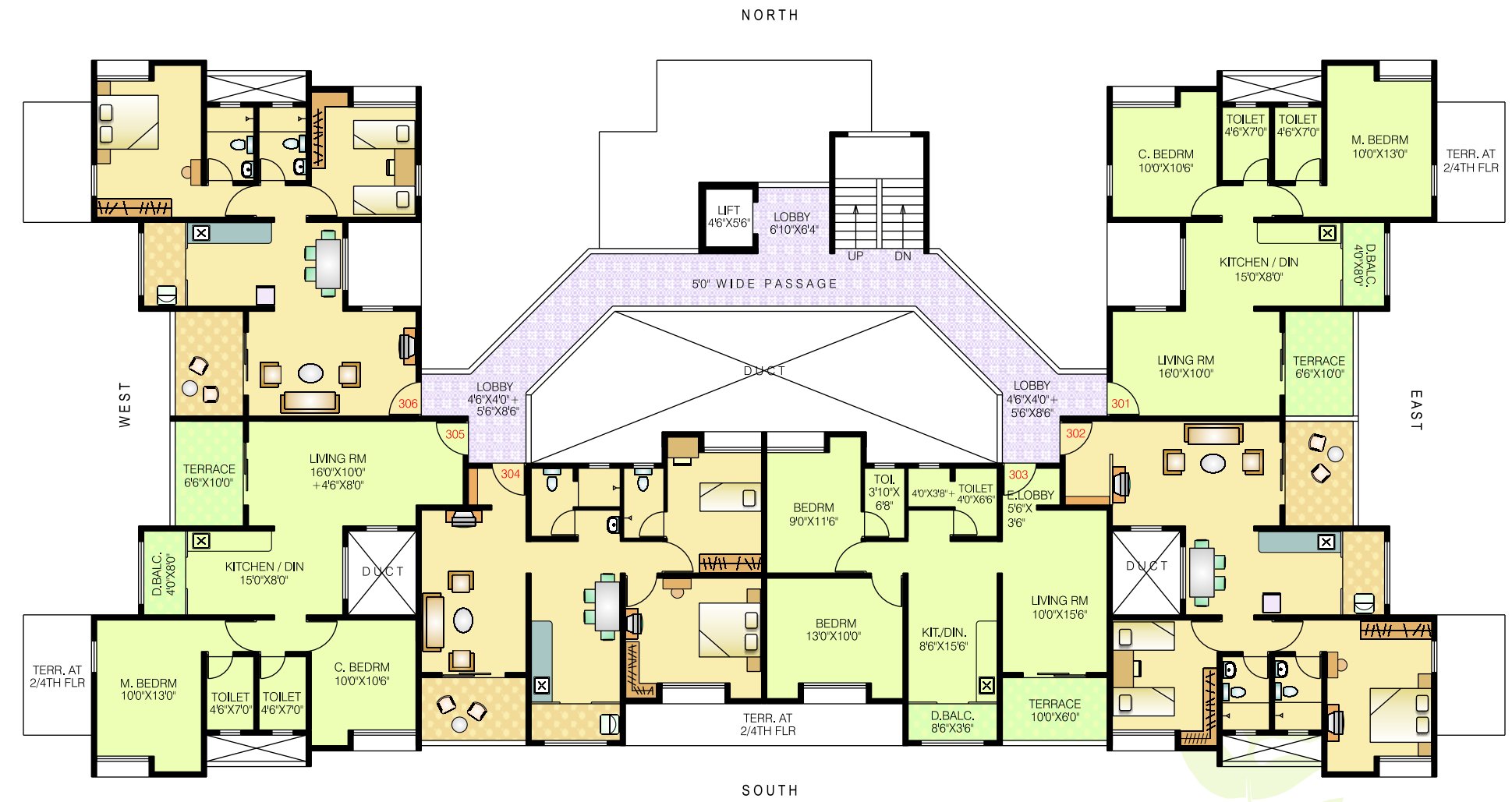
AREA STATEMENT IN SQ.FT.