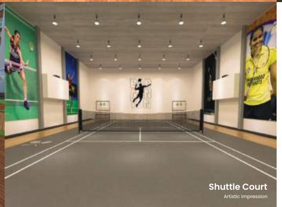
Shuttle Court Artistic impression