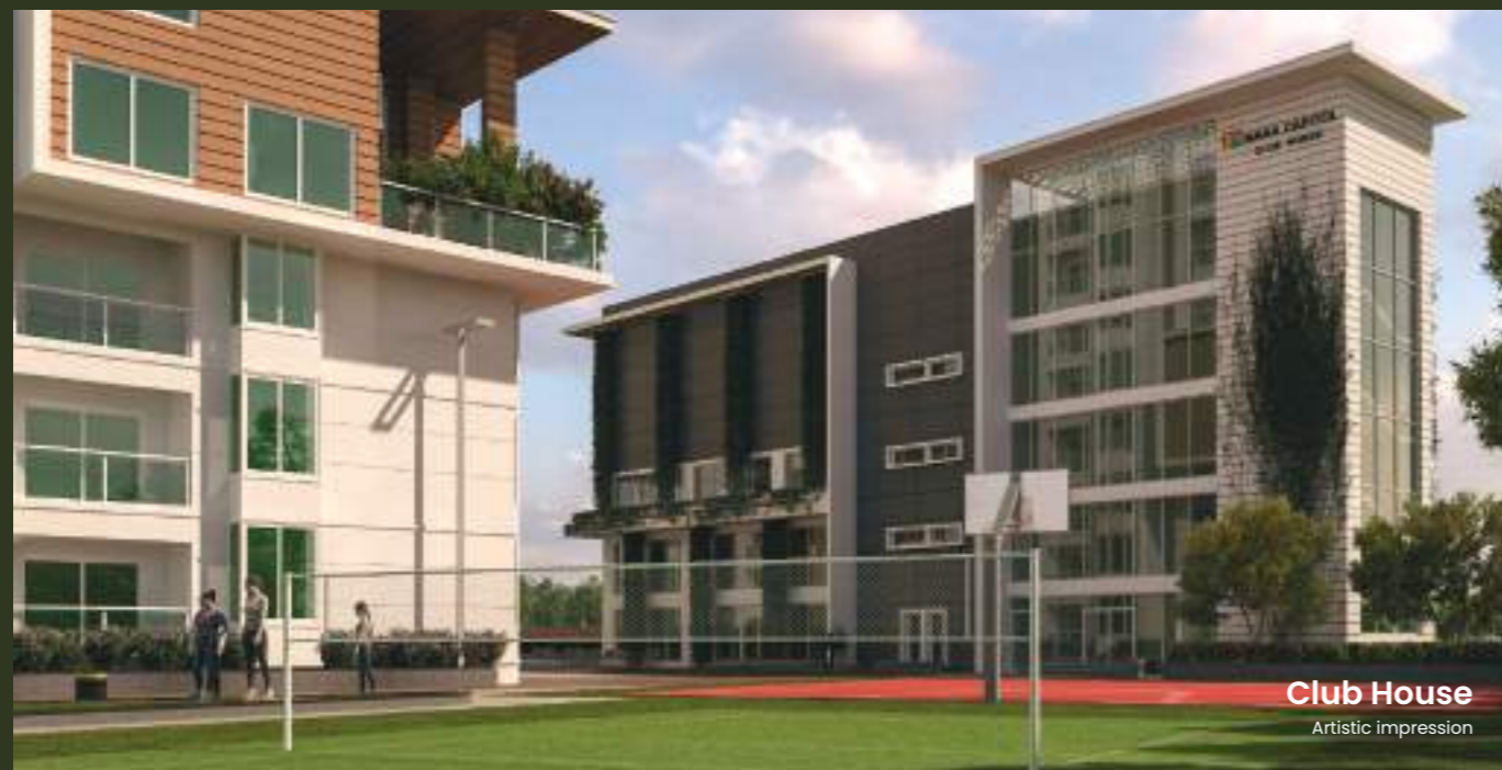
Club House Artistic impression