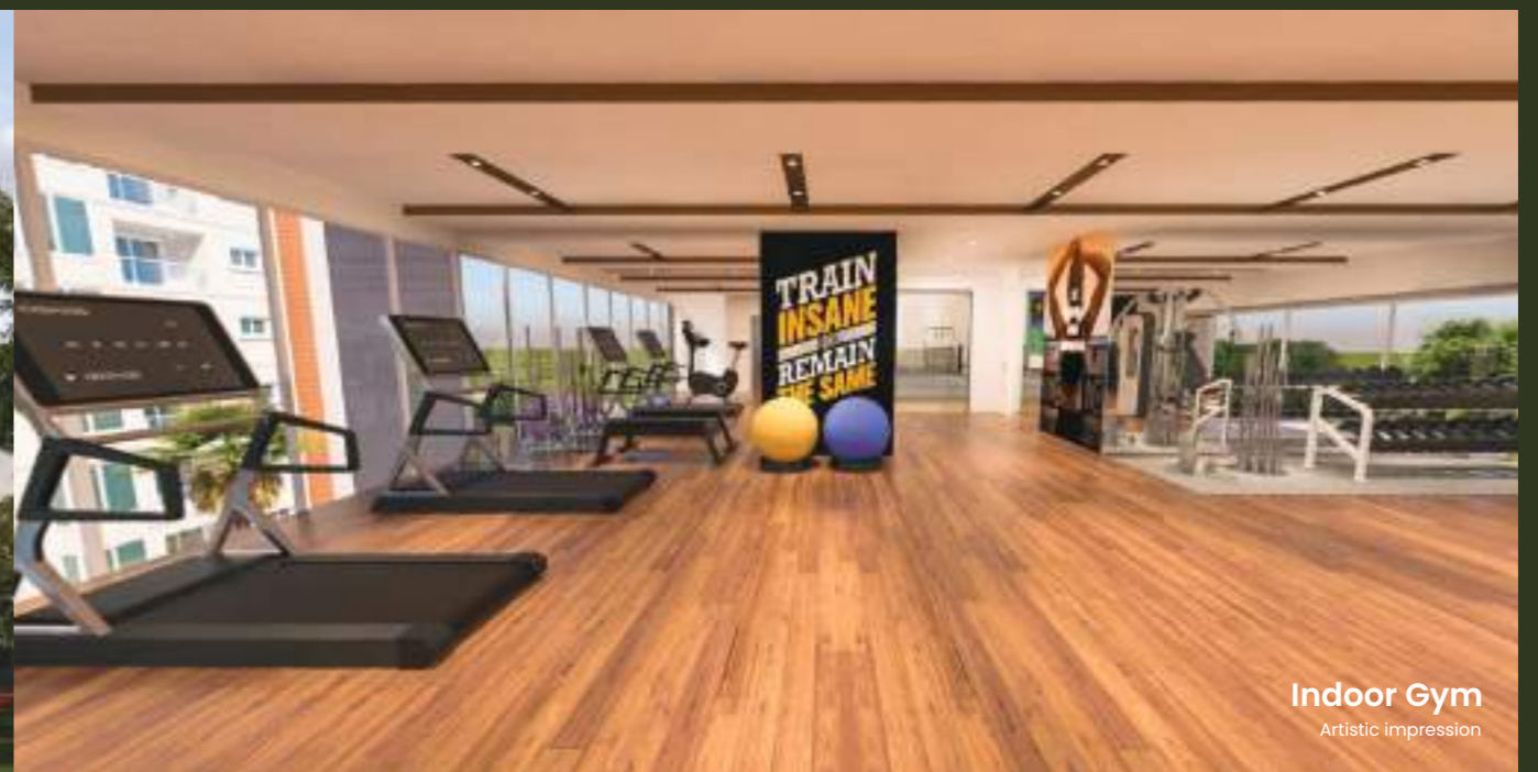
Indoor Gym Artistic impression