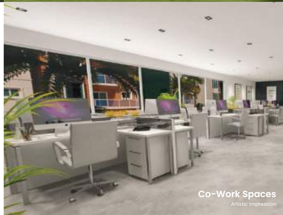
Co-Work Spaces Artistic impression