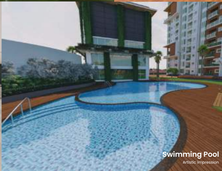
Swimming Pool Artistic impression