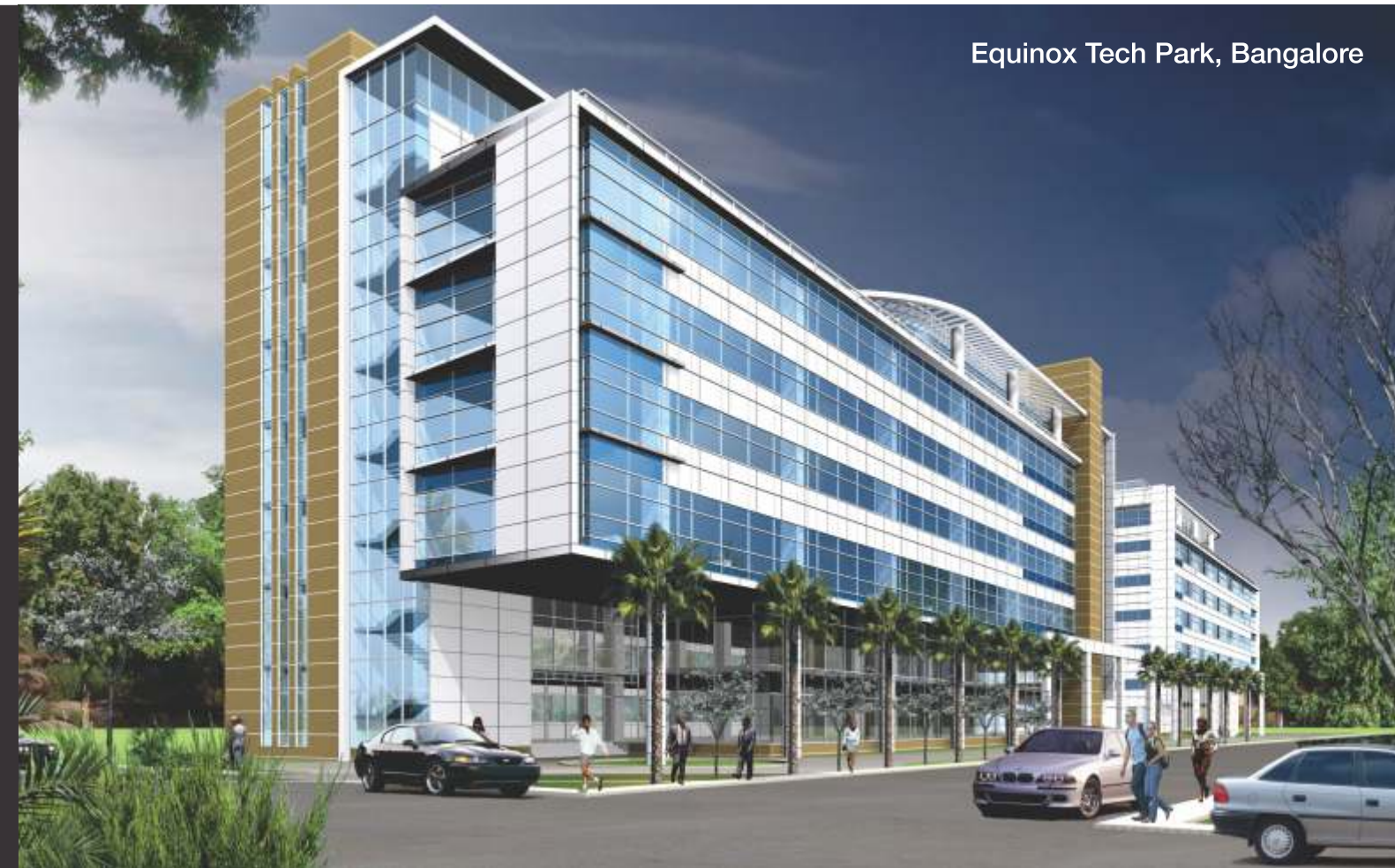
Equinox Tech Park, Bangalore