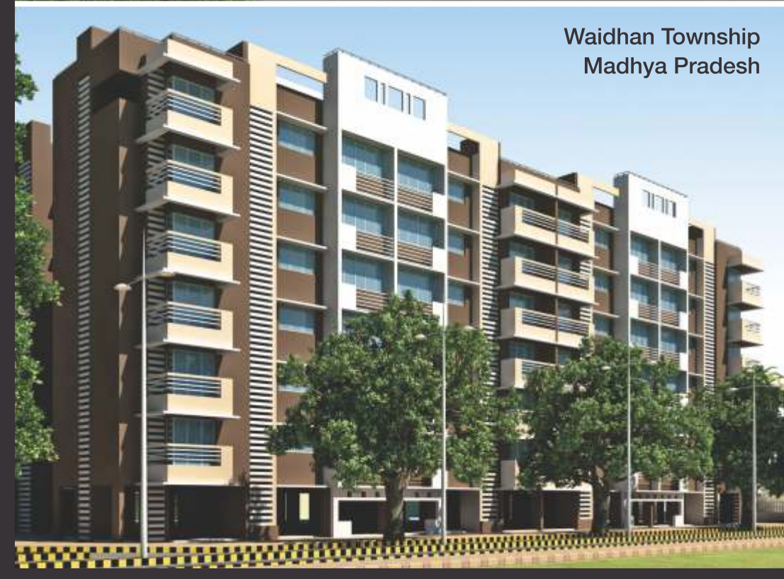
Waidhan Township Madhya Pradesh