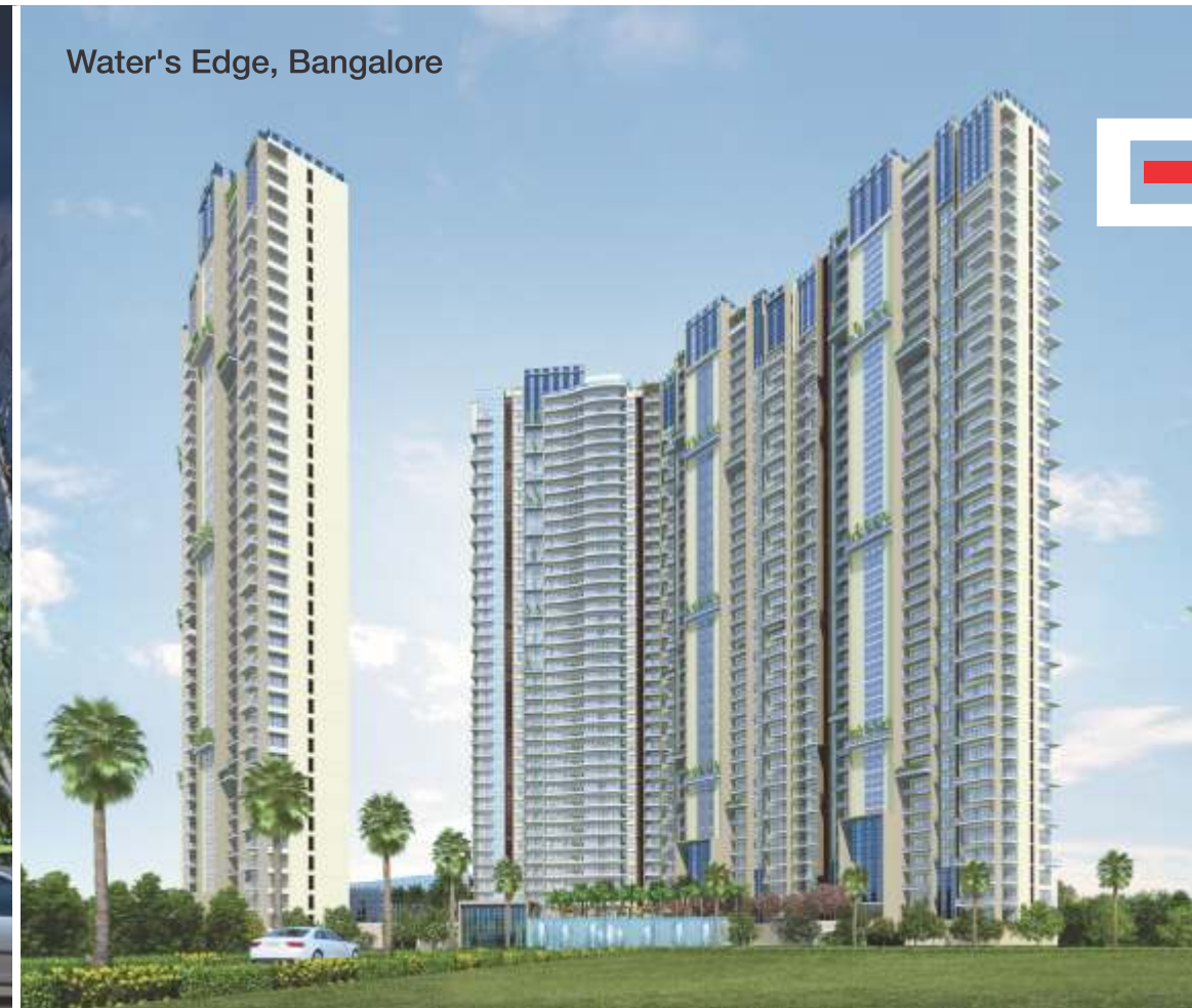
Water's Edge, Bangalore