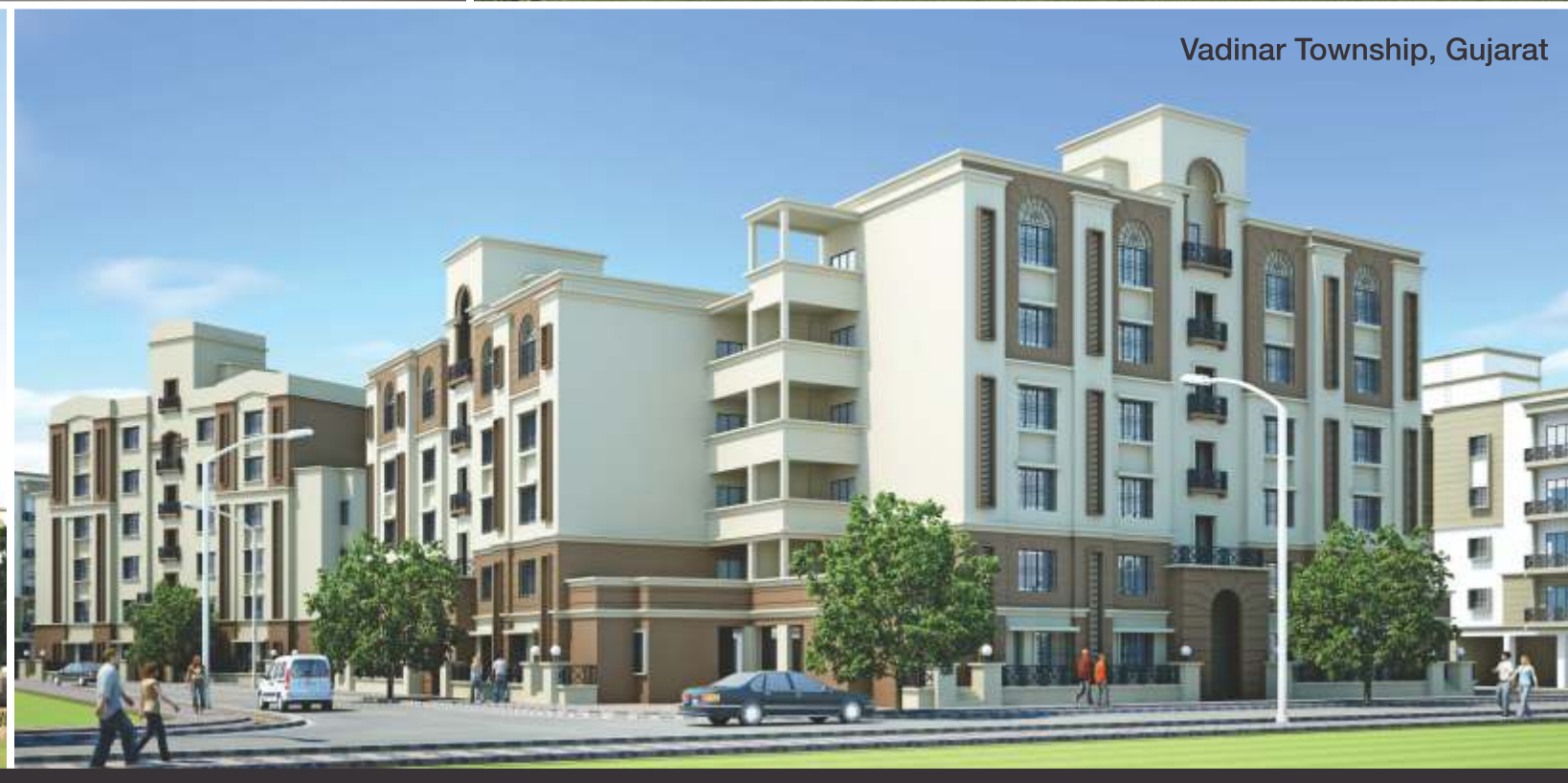
Vadinar Township, Gujarat