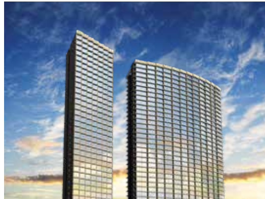
Nexworld , Dombivali (E)