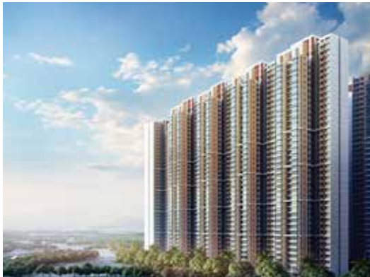
Nexzone , Panvel