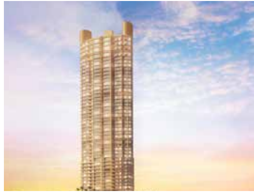
Monte Carlo , Mulund (W)