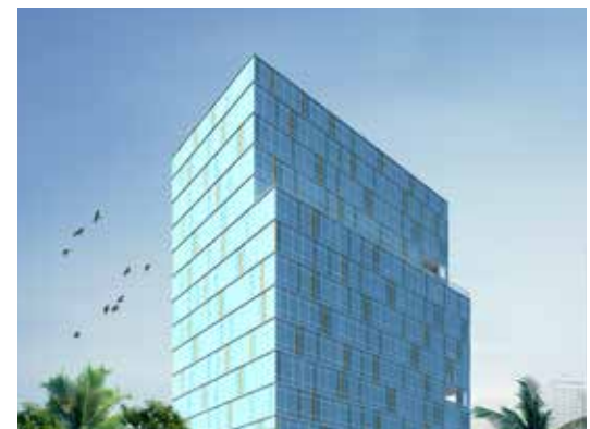
Icon , Lower Parel