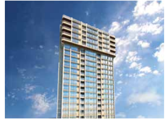
Emblem , Mulund (W)