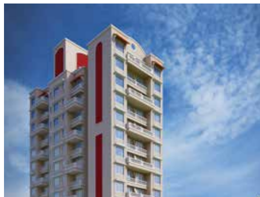
Nagari-NX , Badlapur (E)