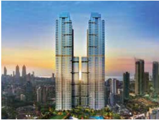
Monte South , Byculla

We are currently building several townships in the fastest growing neighborhoods, affordable housing projects, ultra-luxury skyscrapers, small offices and large business centers, with projects spread across the Mumbai Metropolitan Region (MMR).