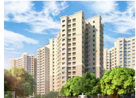
Nextown , Kalyan-Shill Road