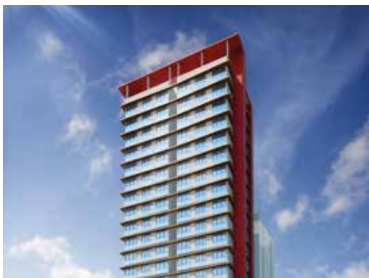
Eminence , Mulund (W)