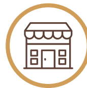
UTILITY RETAIL SHOPS