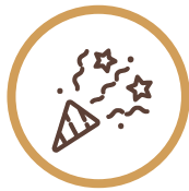
PARTY LAWN/ GARDEN