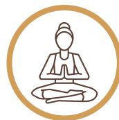
YOGA/ MEDITATION ROOM