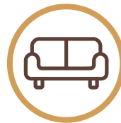
PERGOLAS WITH SEATING