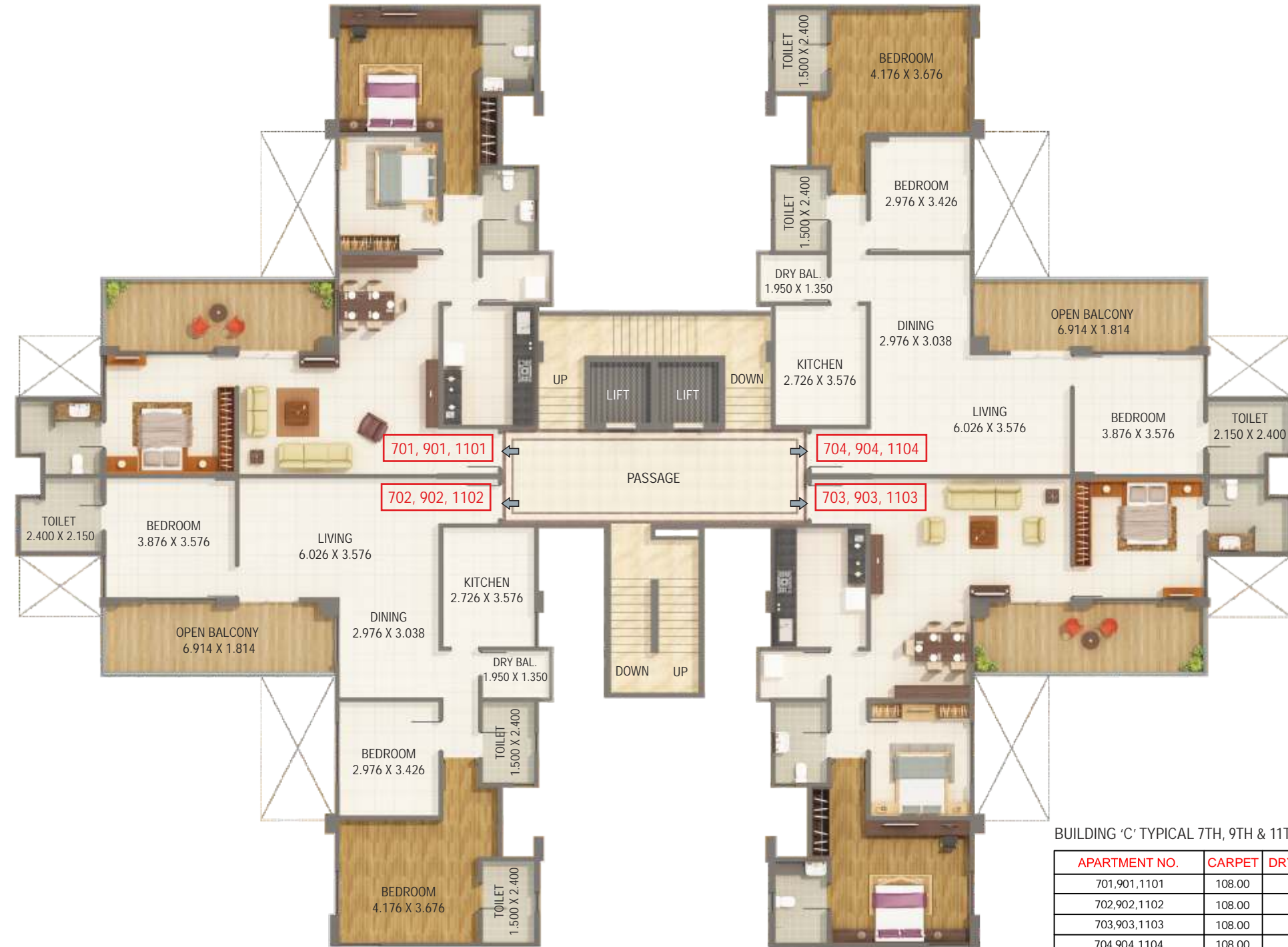
BUILDING 'C' TYPICAL 7TH, 9TH & 11TH FLOOR PLAN (AREA IN SQ. M.)