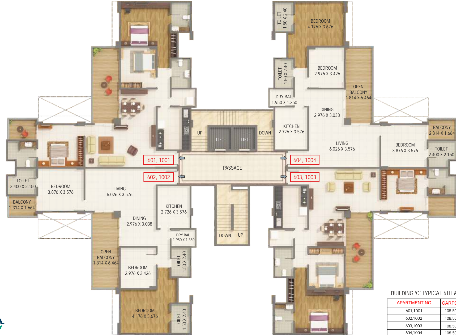
BUILDING 'C' TYPICAL 6TH & 10TH FLOOR PLAN (AREA IN SQ. M.)