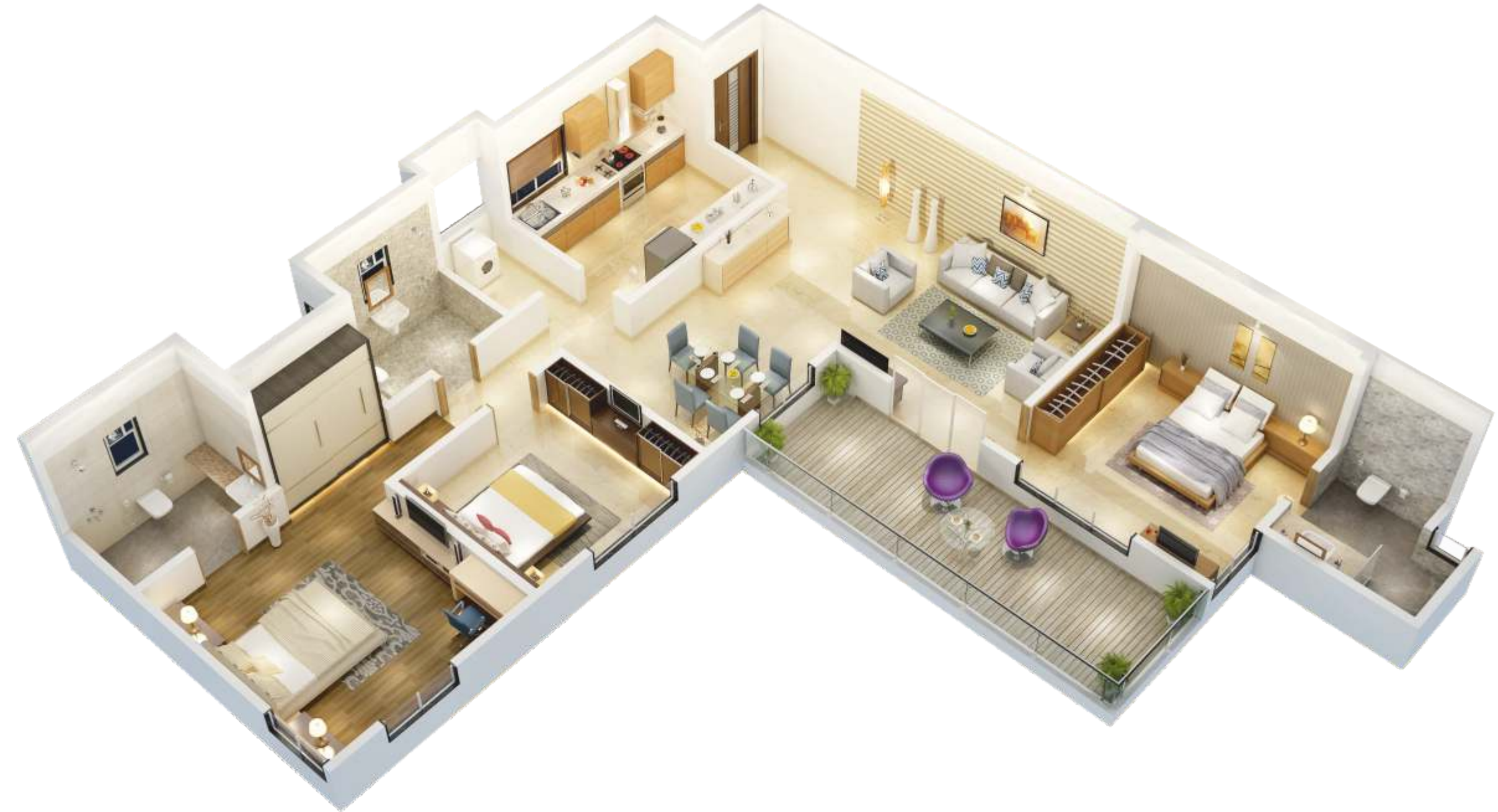
3BHK CUT SECTION TYPICAL FLATS ON ODD FLOOR

Kumar peninsula 3 BHK spacious homes at Baner-Pashan link road