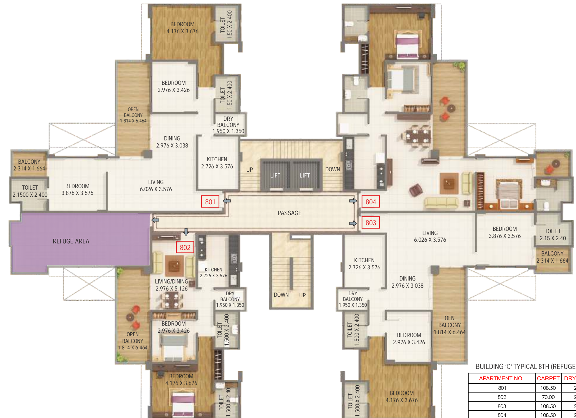
BUILDING 'C' TYPICAL 8TH (REFUGE) FLOOR PLAN (AREA IN SQ. M.)