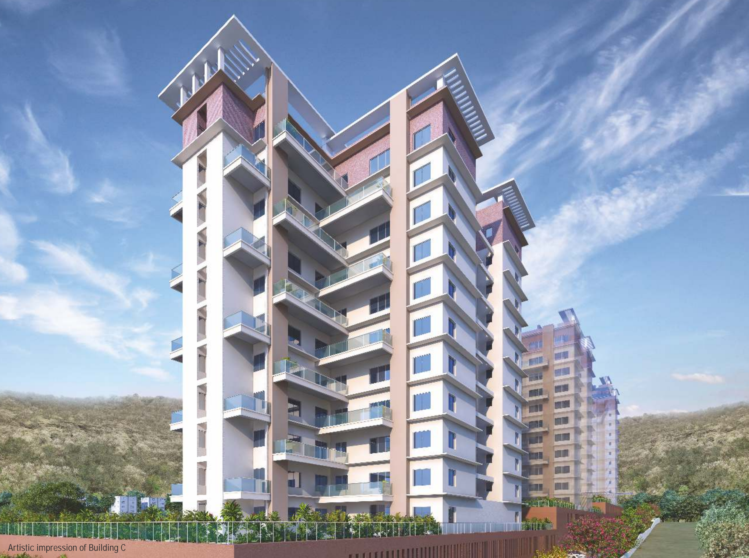
Artistic impression of Building C