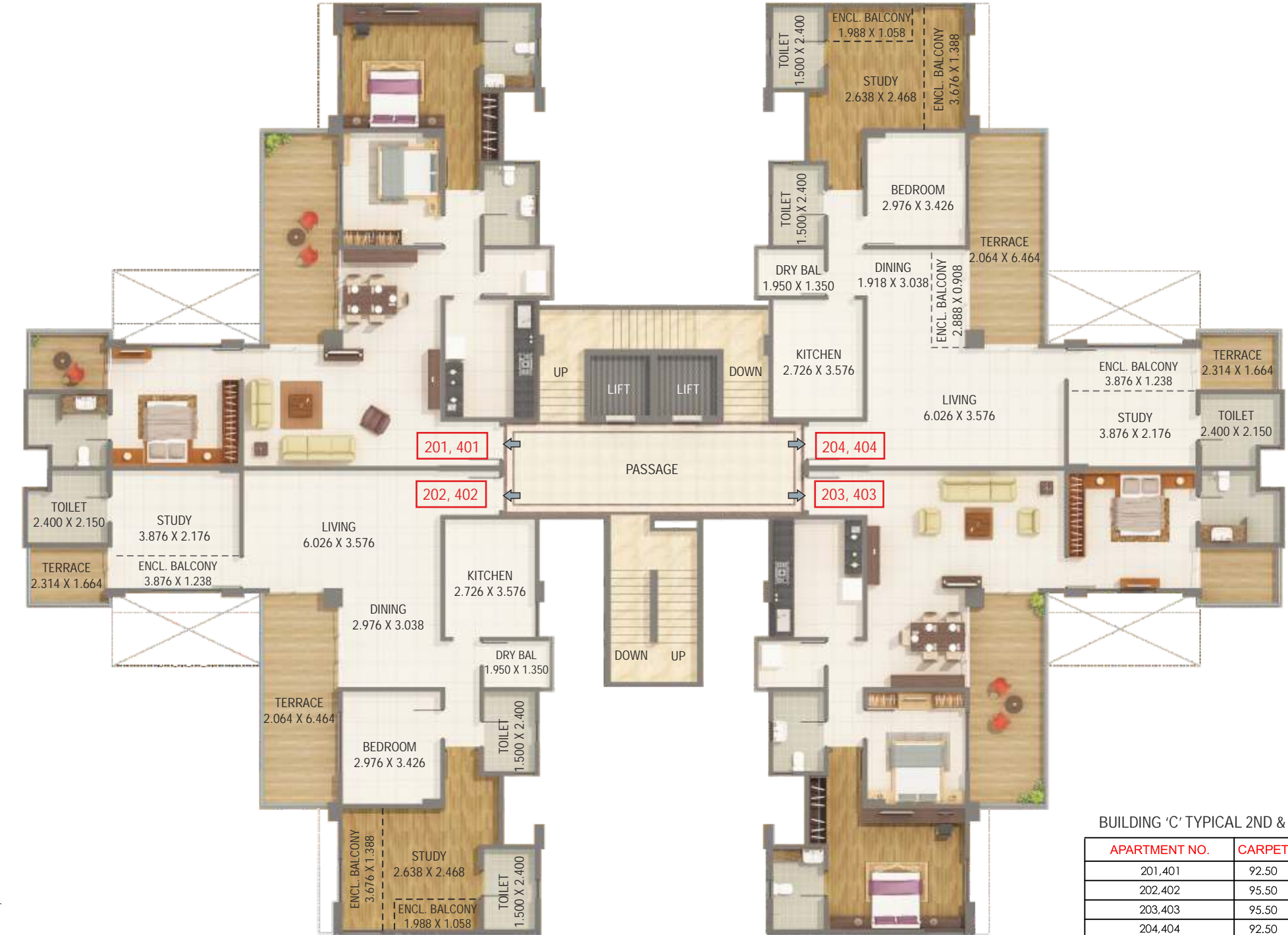
BUILDING 'C' TYPICAL 2ND & 4TH FLOOR PLAN (AREA IN SQ. M.)