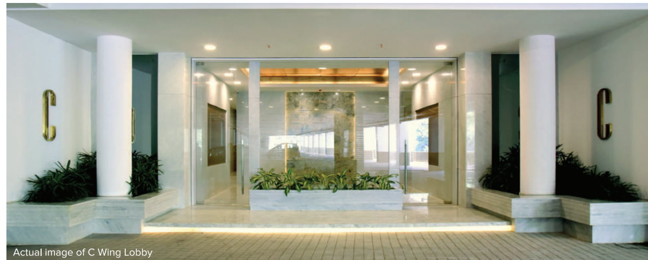
Actual image of C Wing Lobby