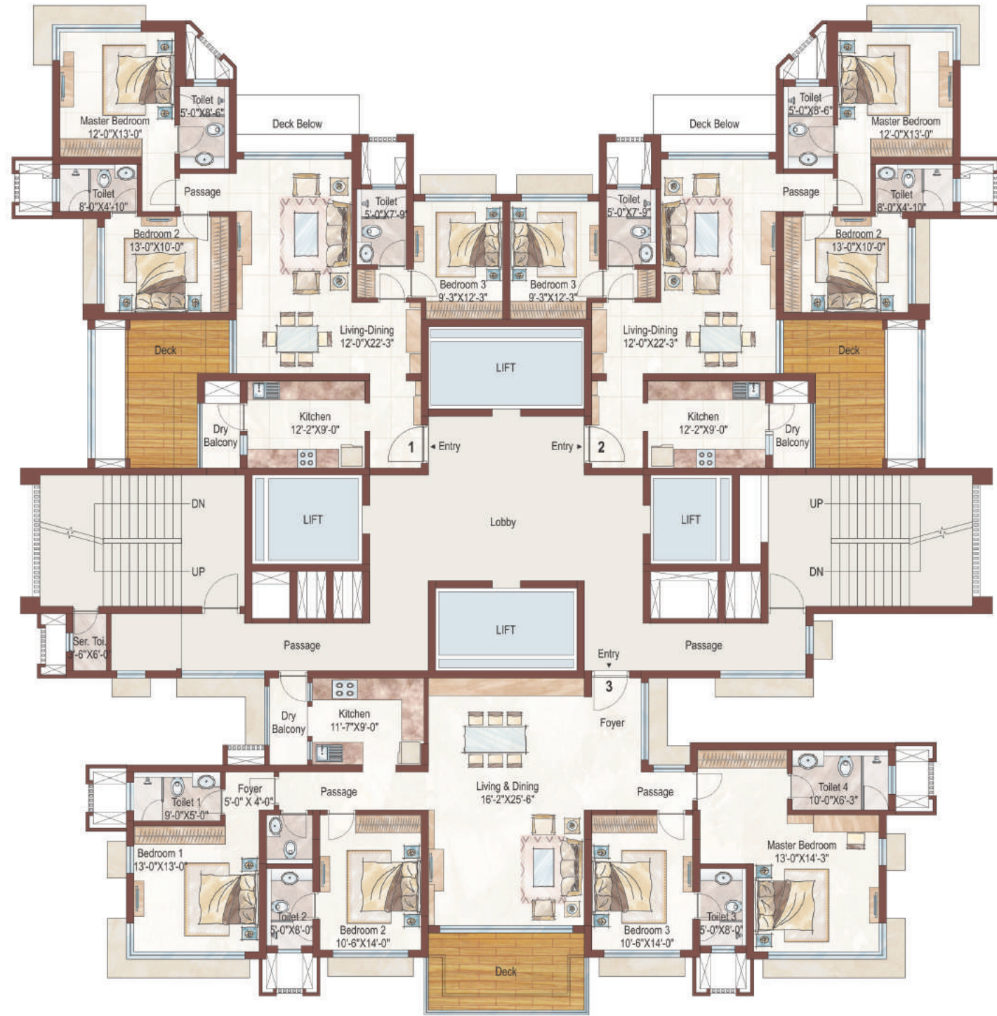
TYPICAL FLOOR PLAN OF TOWER 'D' WITHOUT DECK