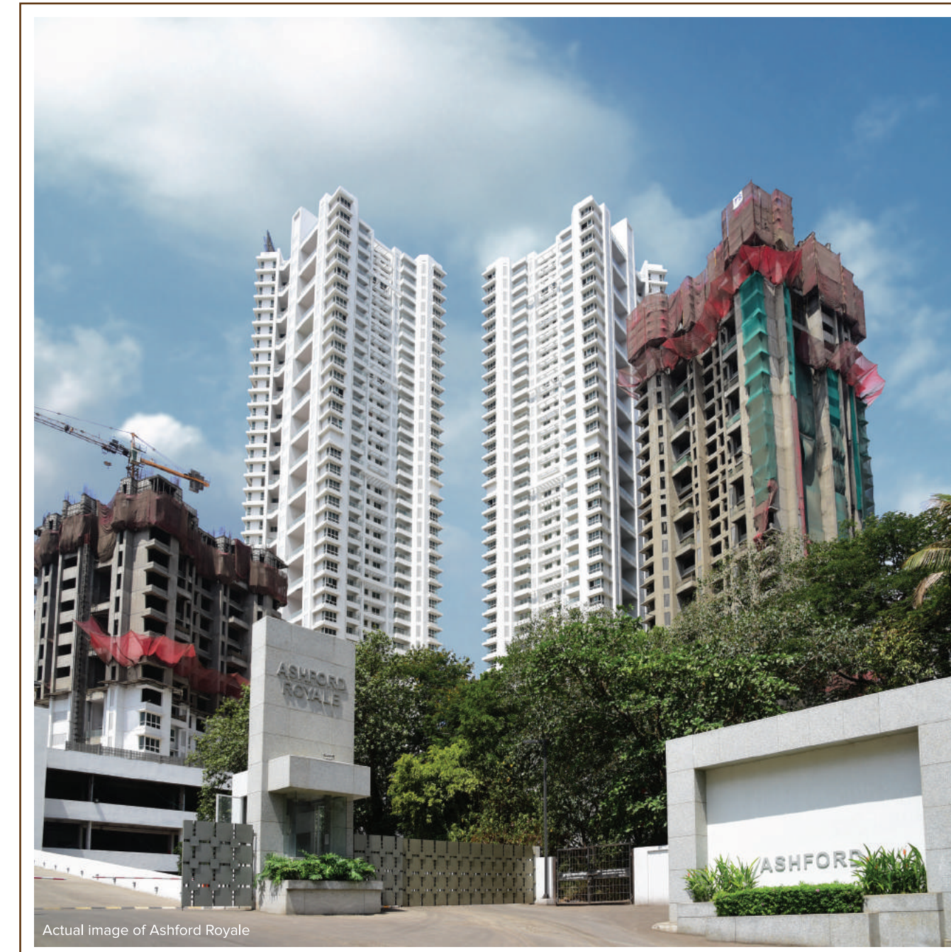
Actual image of Ashford Royale