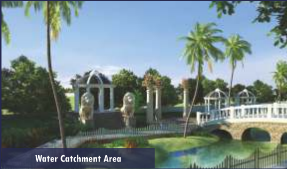
Water Catchment Area