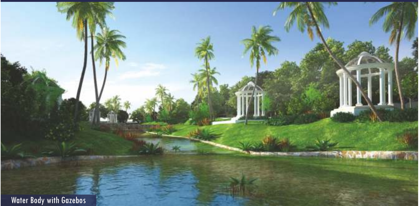
Water Body with Gazebos