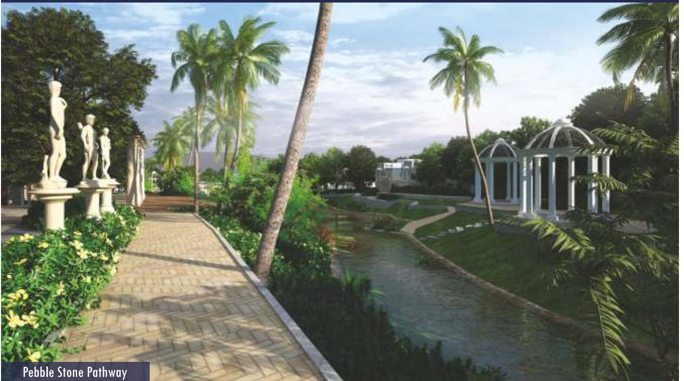
Pebble Stone Pathway