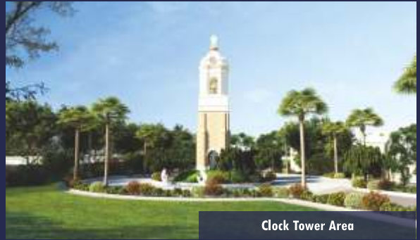
Clock Tower Area