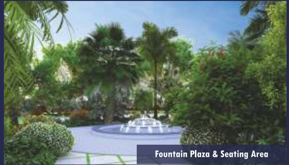
Fountain Plaza & Seating Area