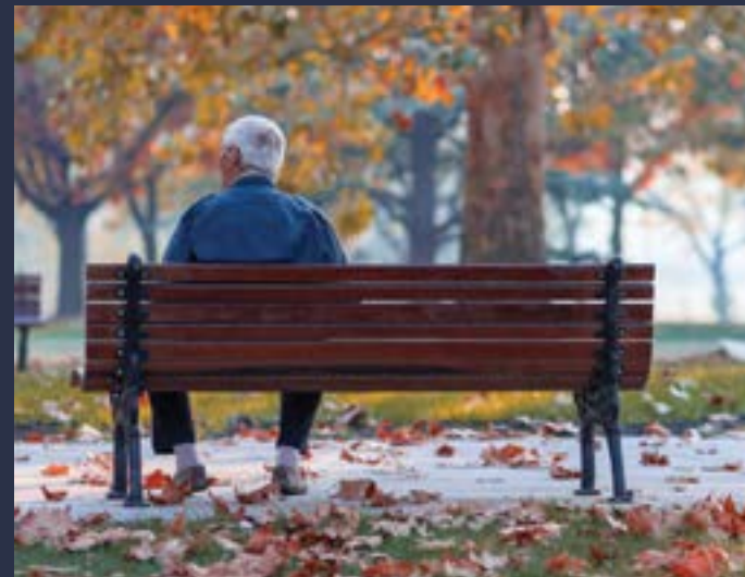
SENIOR CITIZENS ZONE