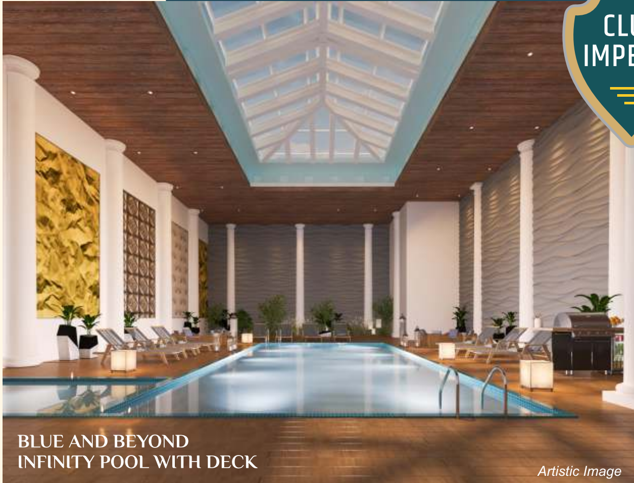
BLUE AND BEYOND INFINITY POOL WITH DECK