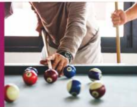
TABLE TENNIS & KIDS ZONE

Surprise friends and family with your amazing skills. You can enjoy pool and billiards with the quality equipment, right at home at the club house.