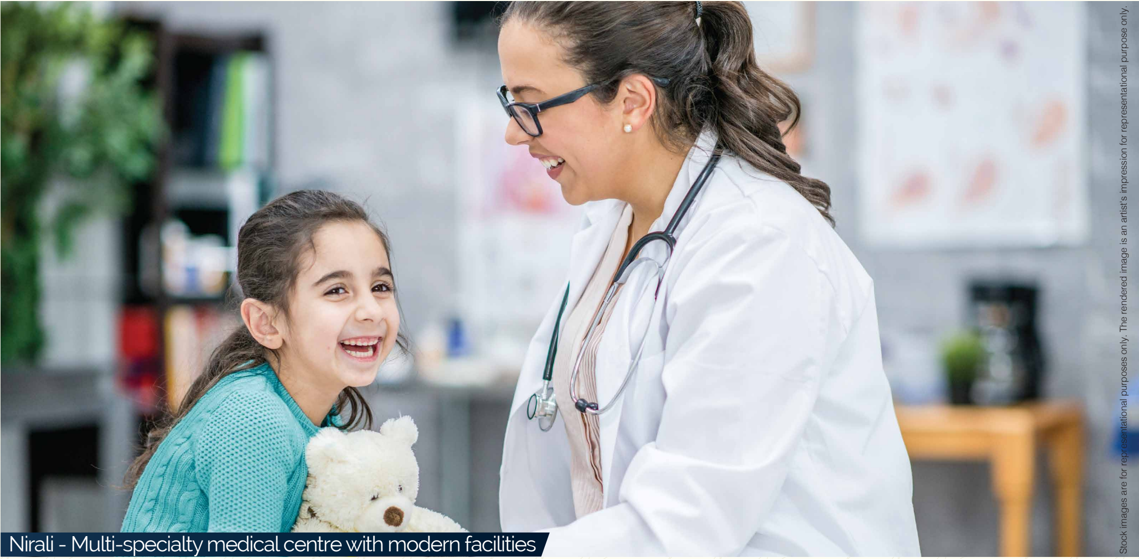
Nirali - Multi-specialty medical centre with modern facilities

Stock images are for representational purposes only. The rendered image is an artist's impression for representational purpose only.