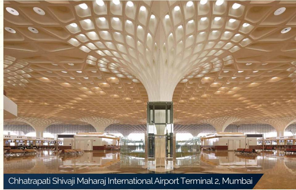
Chhatrapati Shivaji Maharaj International Airport Terminal 2, Mumbai

Larsen & Toubro is a USD 21 Billion conglomerate. You've seen this name on megastructures, gigantic construction sites and in the headlines - reporting benchmark setting projects in India and abroad. From our earliest days of manufacturing to our most recent projects, L&T has been a critical part of India's growth. Today, many of India's iconic buildings, airports to IT parks, malls to monuments, carry our signature of excellence.