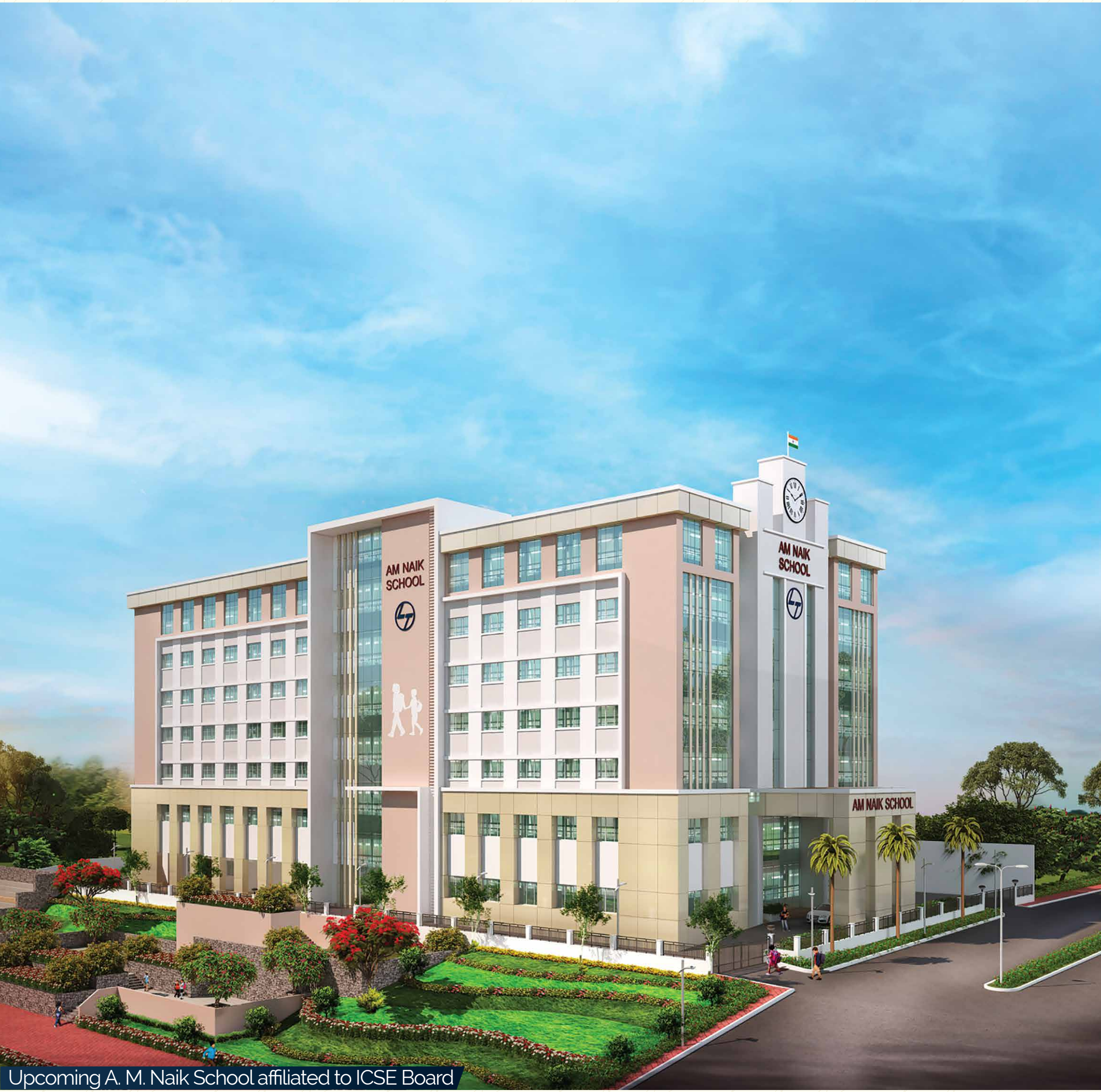
Upcoming A. M. Naik School affiliated to ICSE Board