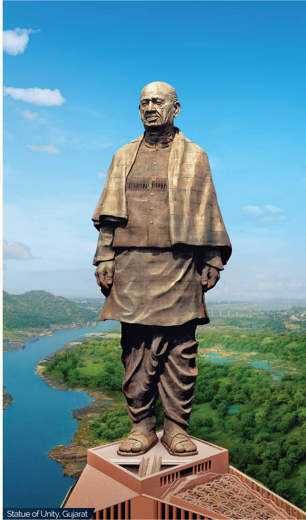
Statue of Unity, Gujarat