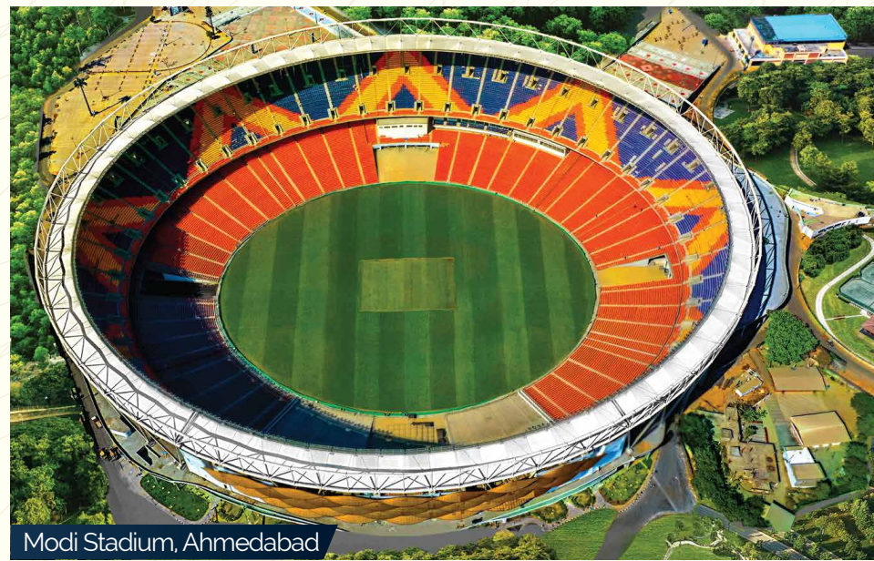
Modi Stadium, Ahmedabad

Larsen & Toubro is a USD 21 Billion conglomerate. You've seen this name on megastructures, gigantic construction sites and in the headlines - reporting benchmark setting projects in India and abroad. From our earliest days of manufacturing to our most recent projects, L&T has been a critical part of India's growth. Today, many of India's iconic buildings, airports to IT parks, malls to monuments, carry our signature of excellence.