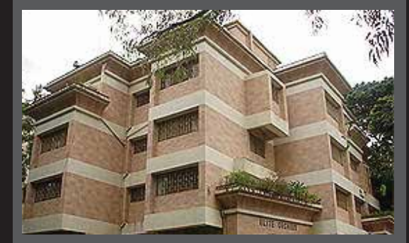
ELITE ORCHIDS, AUNDH