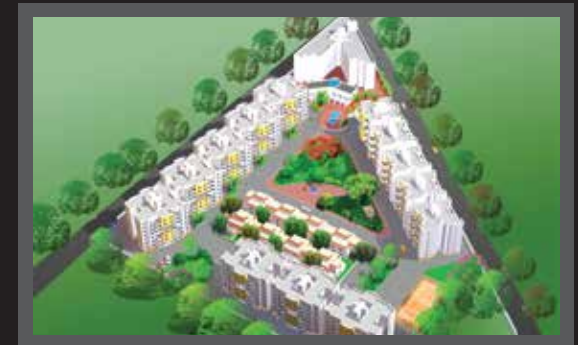
ELITE EMPIRE, BALEWADI