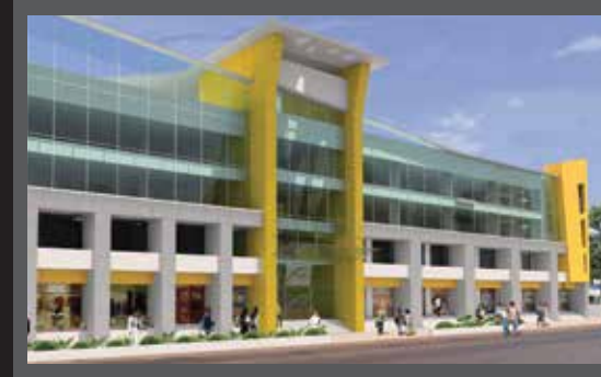
ELITE PREMIO, BALEWADI