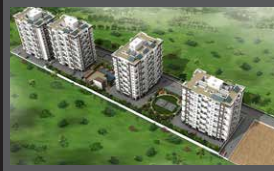
ELITE HOMES, TATHAWADE