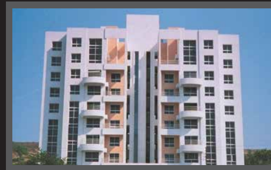
ELITE EMBASSY, BAWDHAN