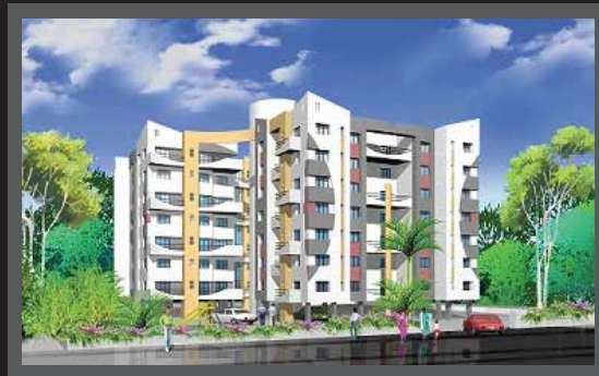
ELITE GALAXY, BAWDHAN