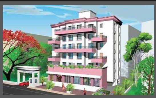
ELITE GARDENS, AUNDH