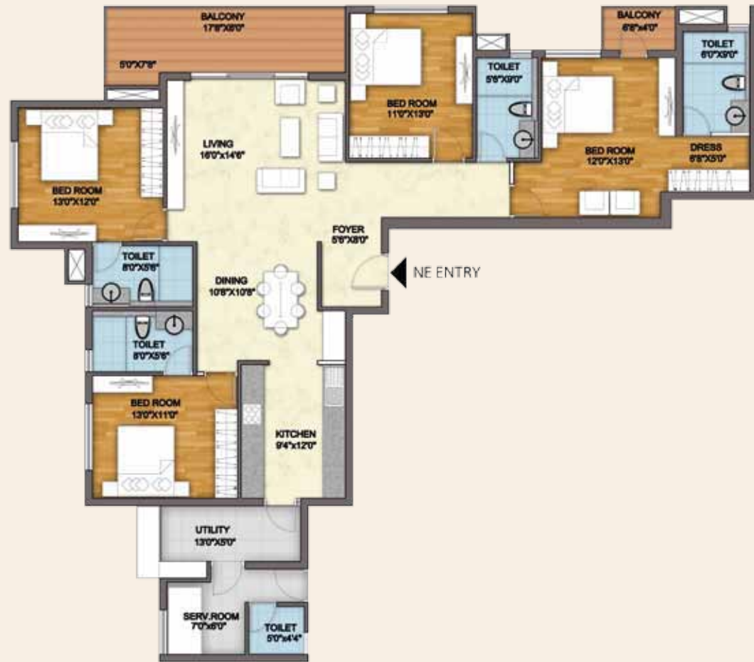
ZENITH - 02 4 BHK - 2255 sqft