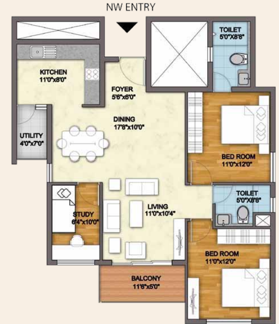
CORONET - 06 2.5 BHK - 1220 sqft