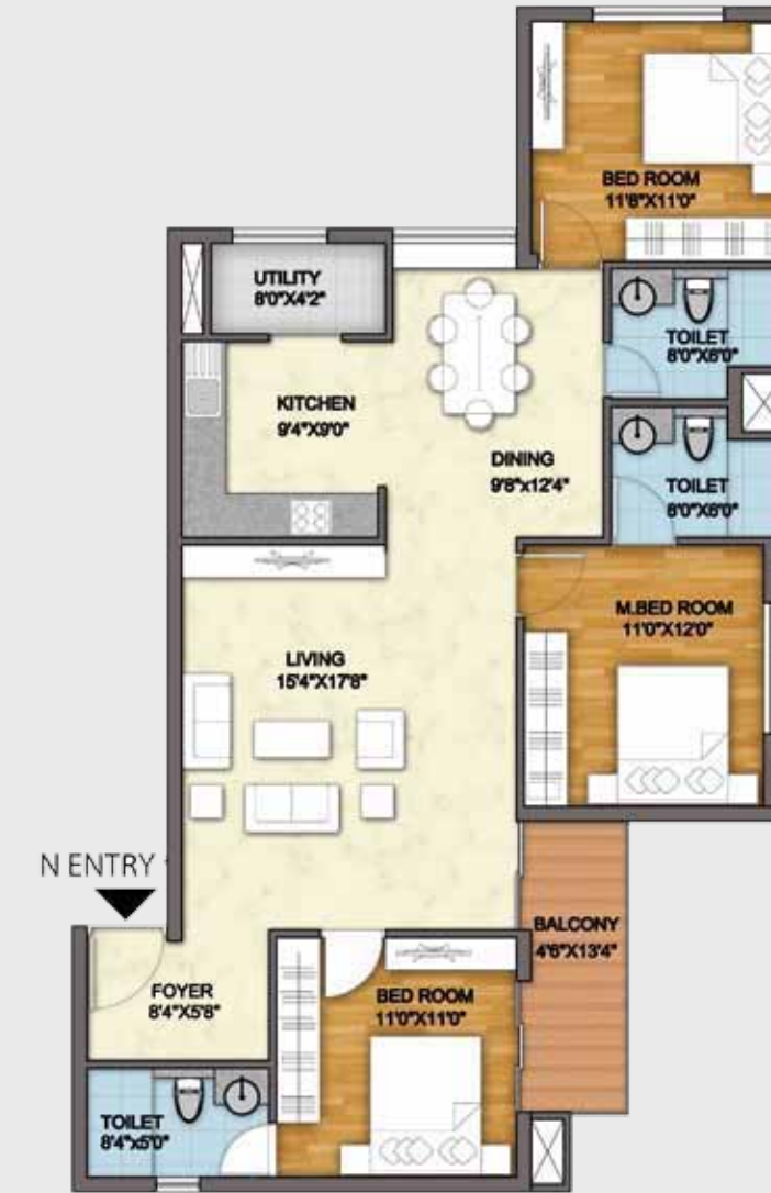
CREST - 11 3 BHK - 1500 sqft