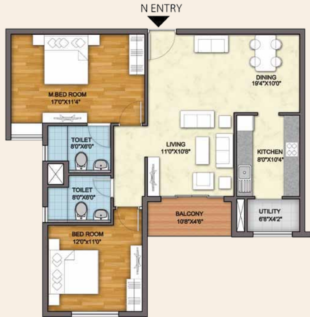
CREST - 07 2 BHK - 1240 sqft