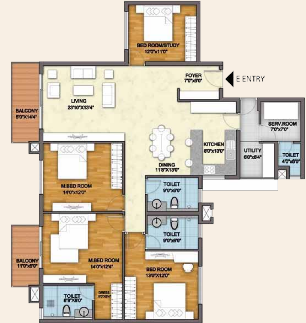
ZENITH - 01 3.5 BHK - 2135 sqft