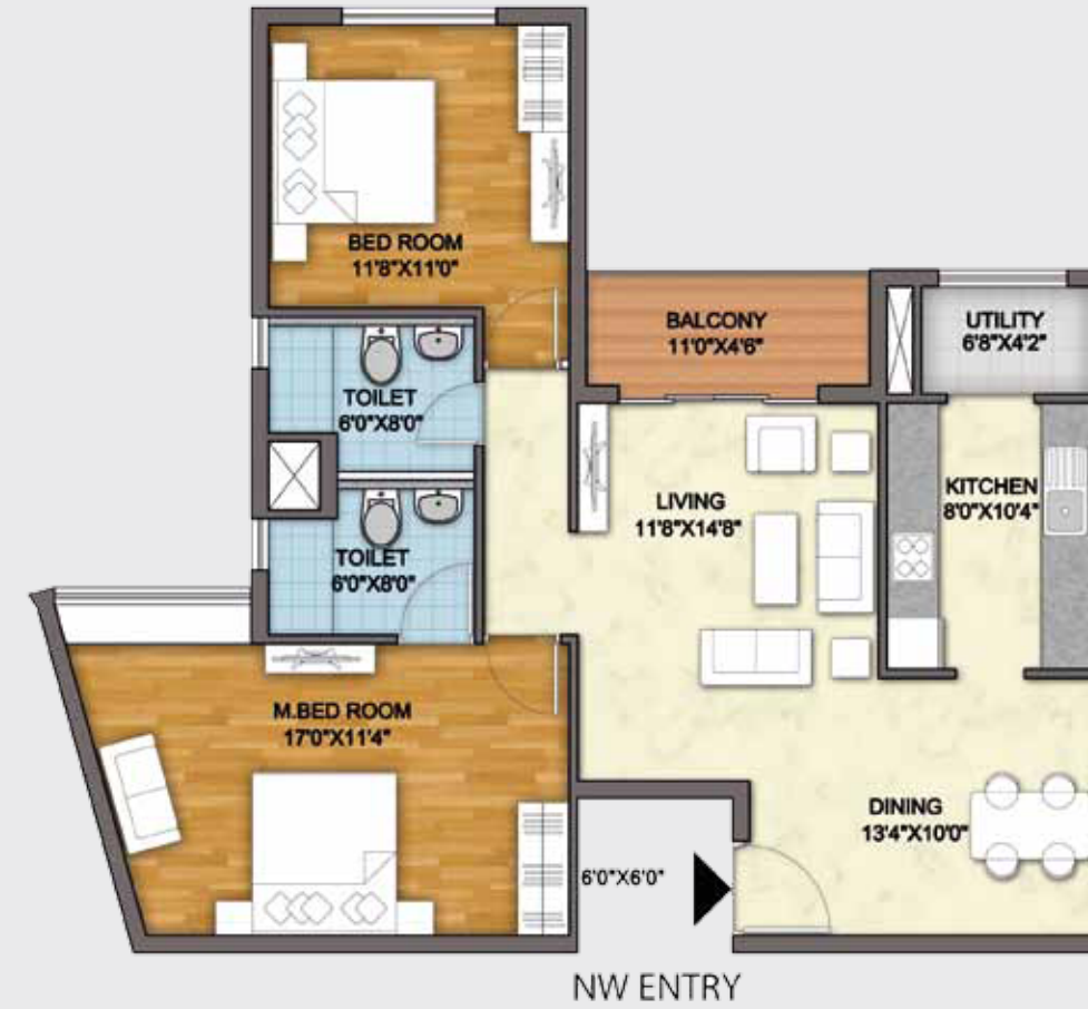
CREST - 10 2 BHK - 1220 sqft