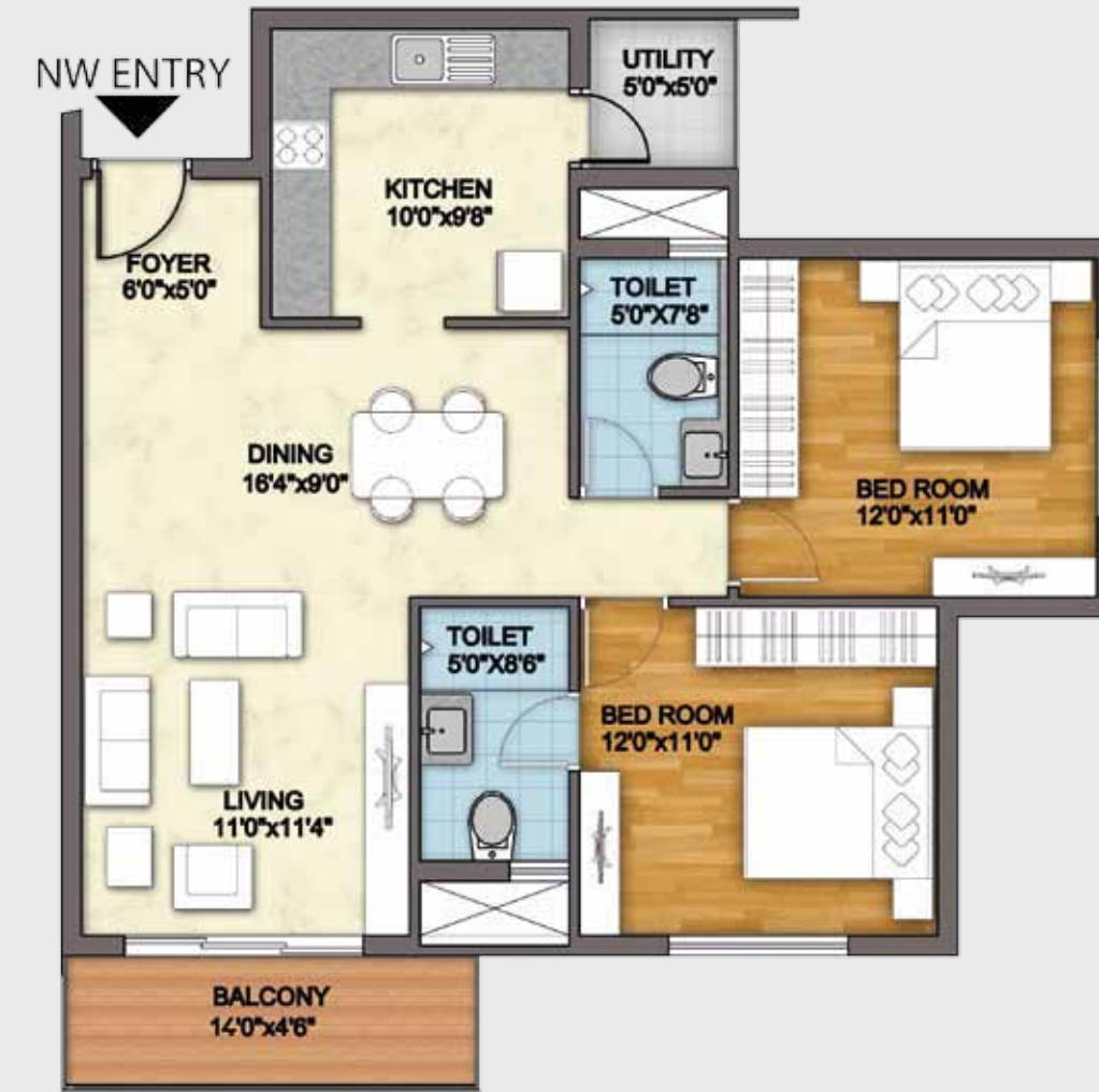
CORONET - 05 2 BHK - 1115 sqft