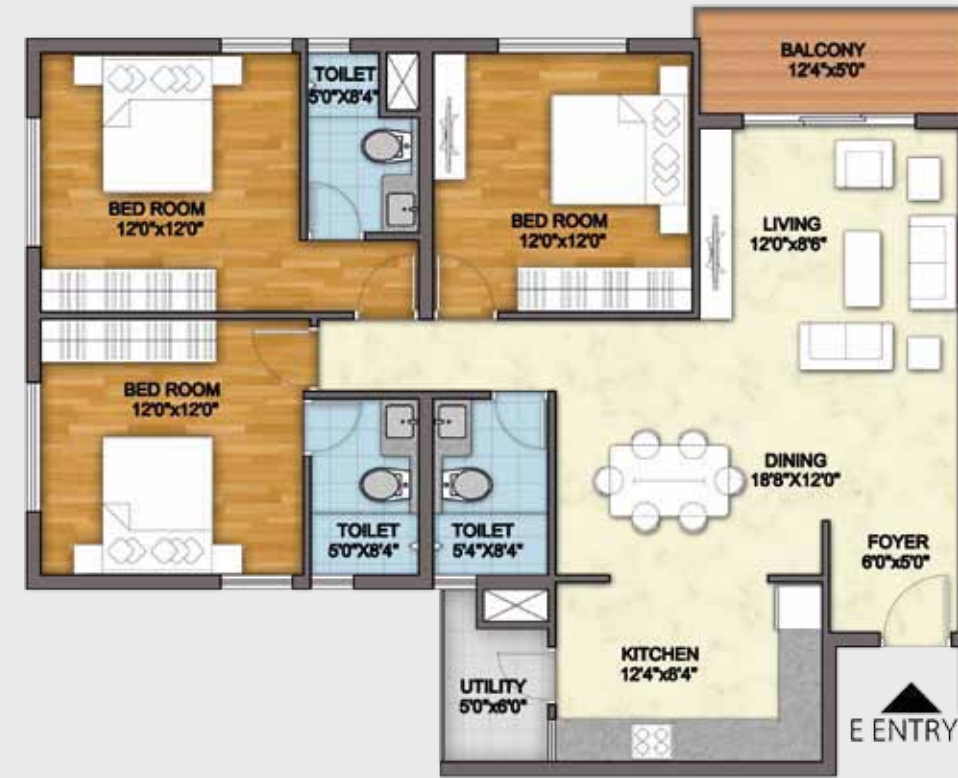
CORONET - 01 3 BHK - 1495 sqft