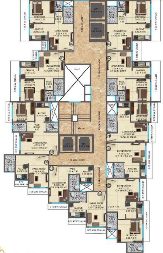
23RD FLOOR PLAN